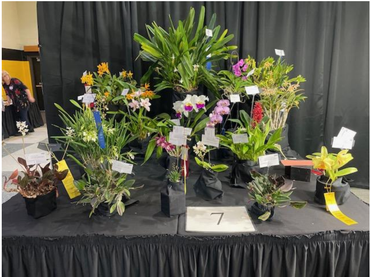
NHOS Exhibit at Amherst OS Show