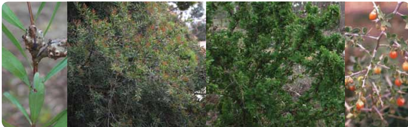
Small to medium shrubs