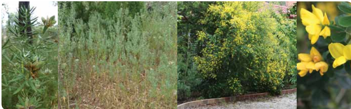
Small to medium shrubs

Status: Declared Noxious Weed (Regionally Controlled).