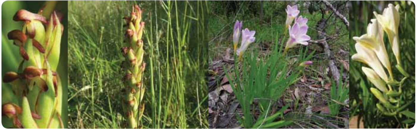
Lillies and bulbs