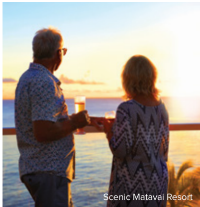
Scenic Matavai Resort

Visitors are able to get married in Niue, for more information contact the Matavai Conference Centre or the Niue Visitor Information Centre.