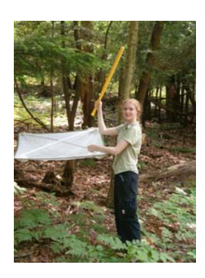
Figure 3. Sampling for C. nipponicus

From 2000 to 2008, 339,050 C. nipponicus were released into EHS infested hemlock sites throughout NJ (Table 1). Release sites where data were collected were found to have statistically significant fewer scales than the controls after inundative releases (Mayer et. al. 2005).