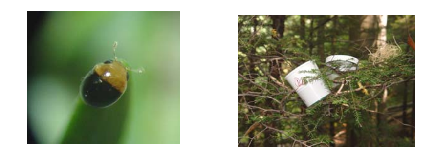
Figure 2. C. nipponicus dorsal view of male and release container