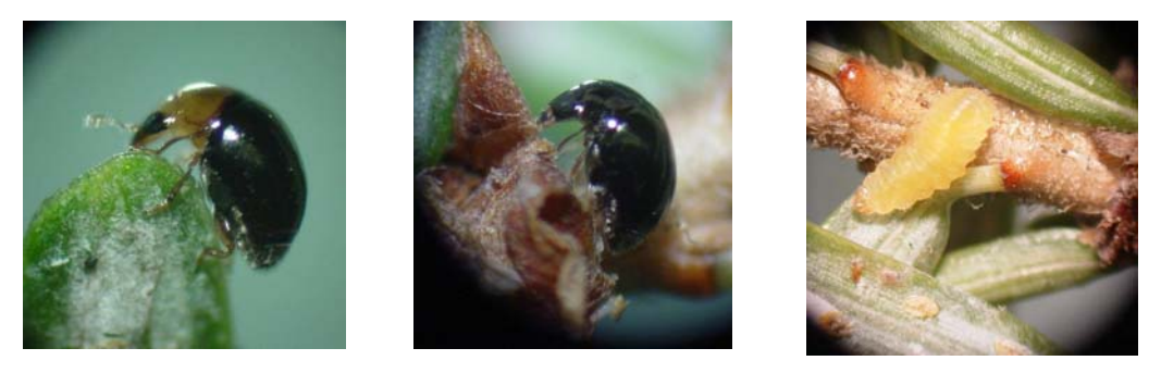
Figure 1. Cybocephalus nipponicus male, female and larva

The genus Cybocephalus has recently been revised in North America by Smith and Cave (2006) resulting in the placement of the genus in its own family, the Cybocephalidae. Cybocephalus used to be in the Nitidulidae but there are sufficient morphological and behavioral differences to warrant the change in families. Cybocephalus nipponicus is now the official taxonomic name of the species and it is no longer Cybocephalus sp. nr. nipponicus .