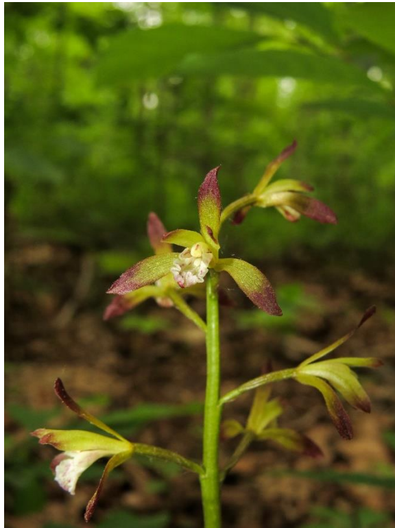
Aplectrum hyemale by Lee Minicucci 2019