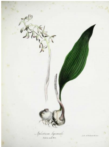
Aplectrum hyemale illus. by J.A. Torrey (CC BY-NC-ND 4.0)

Orchids comprise ten percent of the world's plant population meanwhile 50 percent of the orchids native to North America are either threatened or endangered in some portion of their range (Smithsonian Environmental Research Center 2019). Aplectrum hyemale , commonly known as Puttyroot or Adam and Eve Orchid is one such orchid, currently listed as "Endangered" in the state of New Jersey (New Jersey Natural Heritage Program [hereafter, "NJNHP"] 2010). The two very different common names of the orchid are both in reference to the corm, which is really a pair of corms, the smaller one an offspring of the original (i.e., Adam's Rib). The mucilaginous (or putty-like) substance produced by the corms when crushed was historically used to repair broken pottery (Richburg 2004). While at one point in time the digging up of Aplectrum to fix a crack in a favorite mug may have added to its rarity in our state, today a number of factors that are likely contributing to the species' decline will be addressed in this profile, in the hopes of creating a comprehensive conservation effort for this species and the many others listed as endangered in New Jersey.