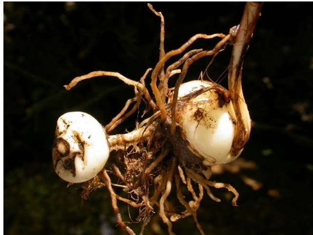
Corms by Gerrit Davidse (CC BY-NC-SA 3.0)