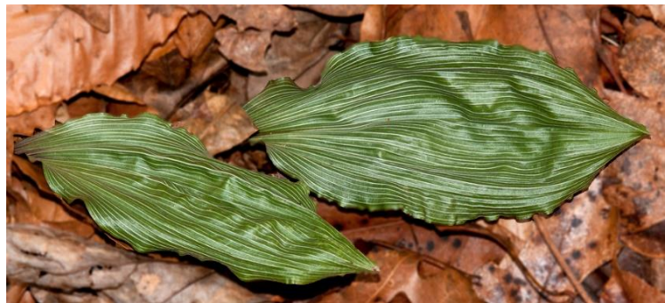
Adam and Eve Orchid (P2)