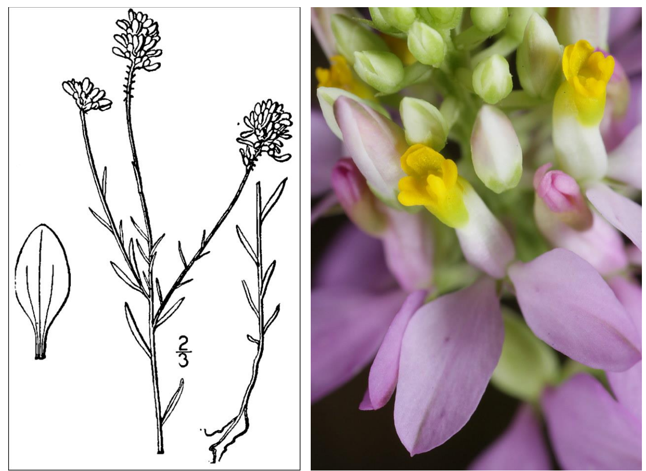
Left: Britton and Brown 1913, courtesy USDA NRCS 2022a. <u>Right</u>: Cotinis, 2013.