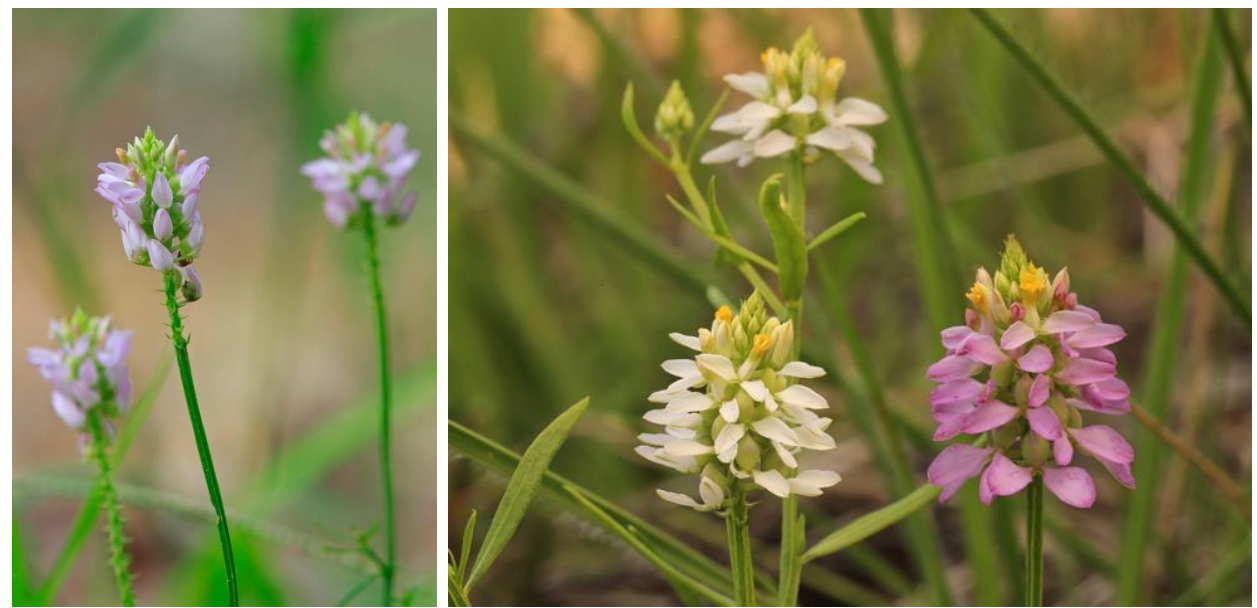
Left: Persistent bracts, Right: Color variations