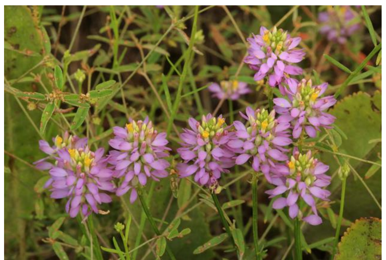
Polygala curtissii