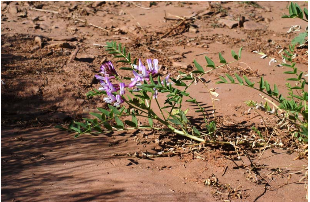
Juvenile flowering plant