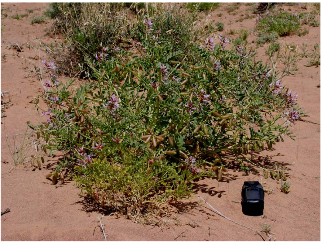
Mature plant with seed pods and flowers