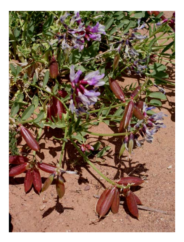
Astragalus beathii, flowers & maturing seed pods