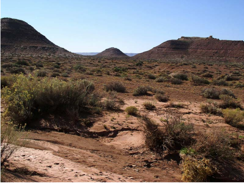
Astragalus beathii habitat