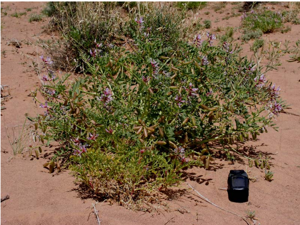
Mature plant with seed pods and flowers