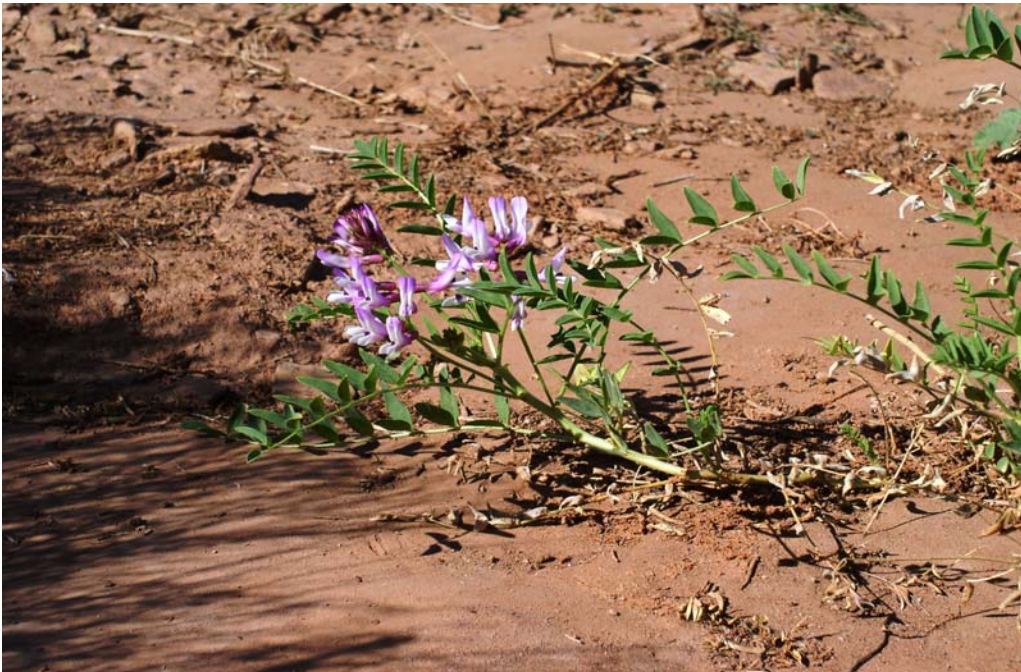
Juvenile flowering plant