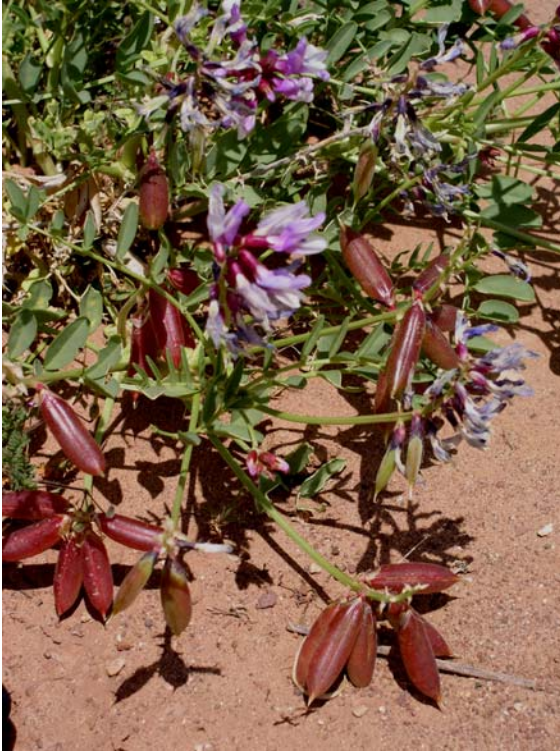
Astragalus beathii , flowers & maturing seed pods