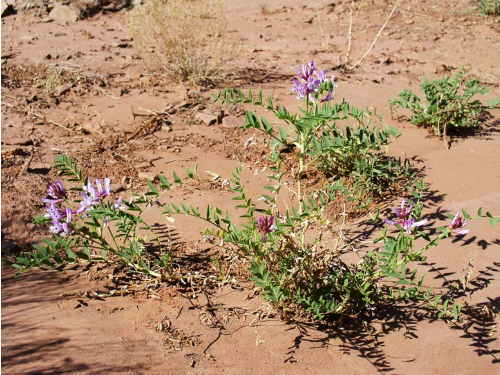
Juvenile flowering plants