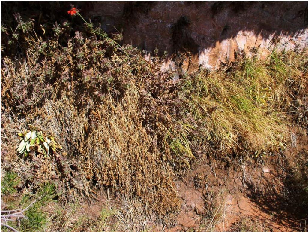
4. Example of drying of the vegetation mat along walls.