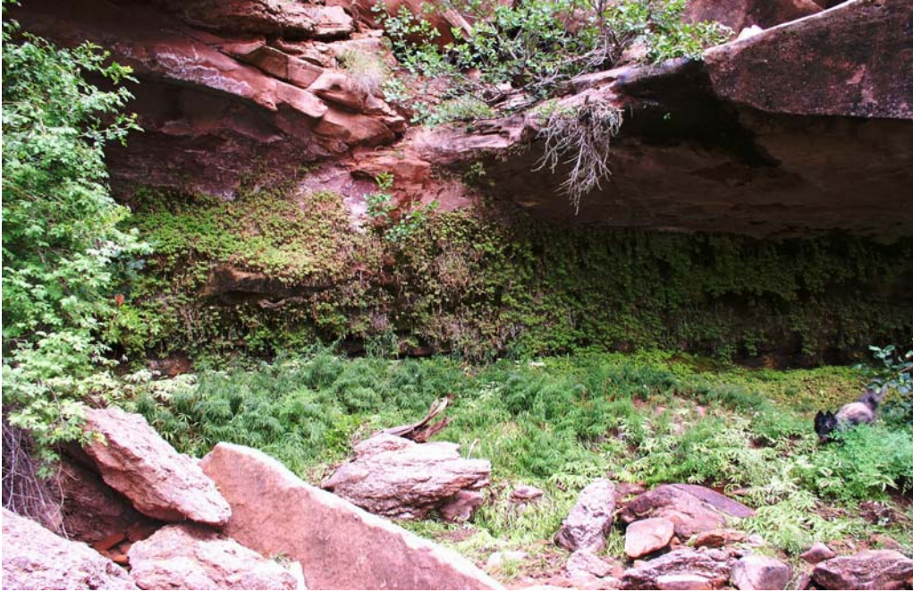
1. Example of healthy hanging garden