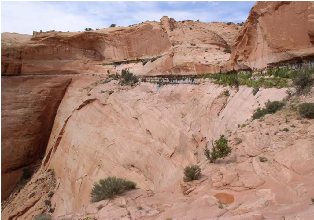
3. Inaccessible portion of the Inscription House Ruin spring site.