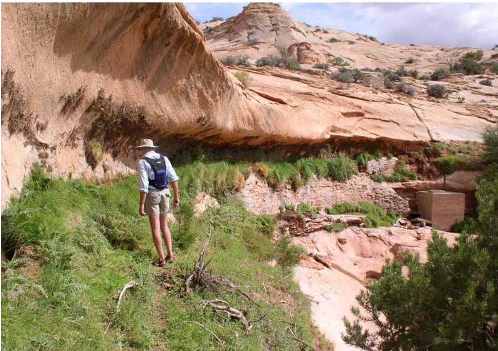
2. Inscription House Ruin spring site