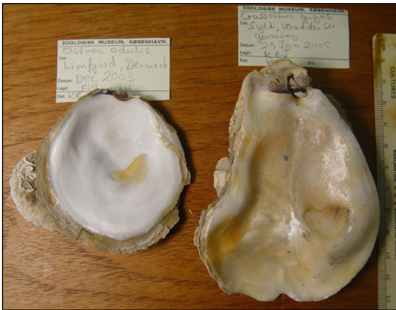
Fig. 3. Ostrea edulis and Crassostrea gigas, left values, (Oe) Limfjord, Denmark, December 2003, (Cg) German Wadden Sea near the island of Sylt, January 2005, photo by Kathe R. Jensen.