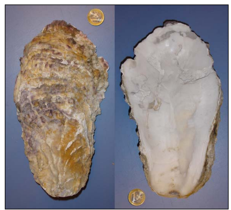
Fig. 1 and 2. Crassostrea gigas , right and left value respectively of a more than 20 years old specimen, Dutch Oosterschelde estuary, undated; photos by Stefan Nehring.

<u>Note</u>: The Portuguese oyster Crassostrea angulata is a name often used for this species. According to genetic studies it was shown that Crassostrea angulata is likely a strain of Crassostrea gigas originating from Taiwan (Huvet et al. 2002). However, the identity of C. gigas and C. angulata remains unsettled. Molecular data indicate higher similarity than usual for distinct species, but still show distinct differences (Huvet et al. 2002, Boudry et al. 2003, Lam 2003, Cross et al. 2005). Common names: giant oyster, Japanese oyster, Pacific oyster, Portuguese oyster (GB), ústřice obrovská (CZ), stillehavsøsters, japansk østers (DK), Felsenauster, Pazifische Auster, Pazifische Felsenauster, Portugiesische Auster (DE), Suur hiidauster (EE), risaostra (IS), Austre (LT), lielâ austere (LV), ostryga pacyficzna (PL), Japanskt jätteostron (SE)