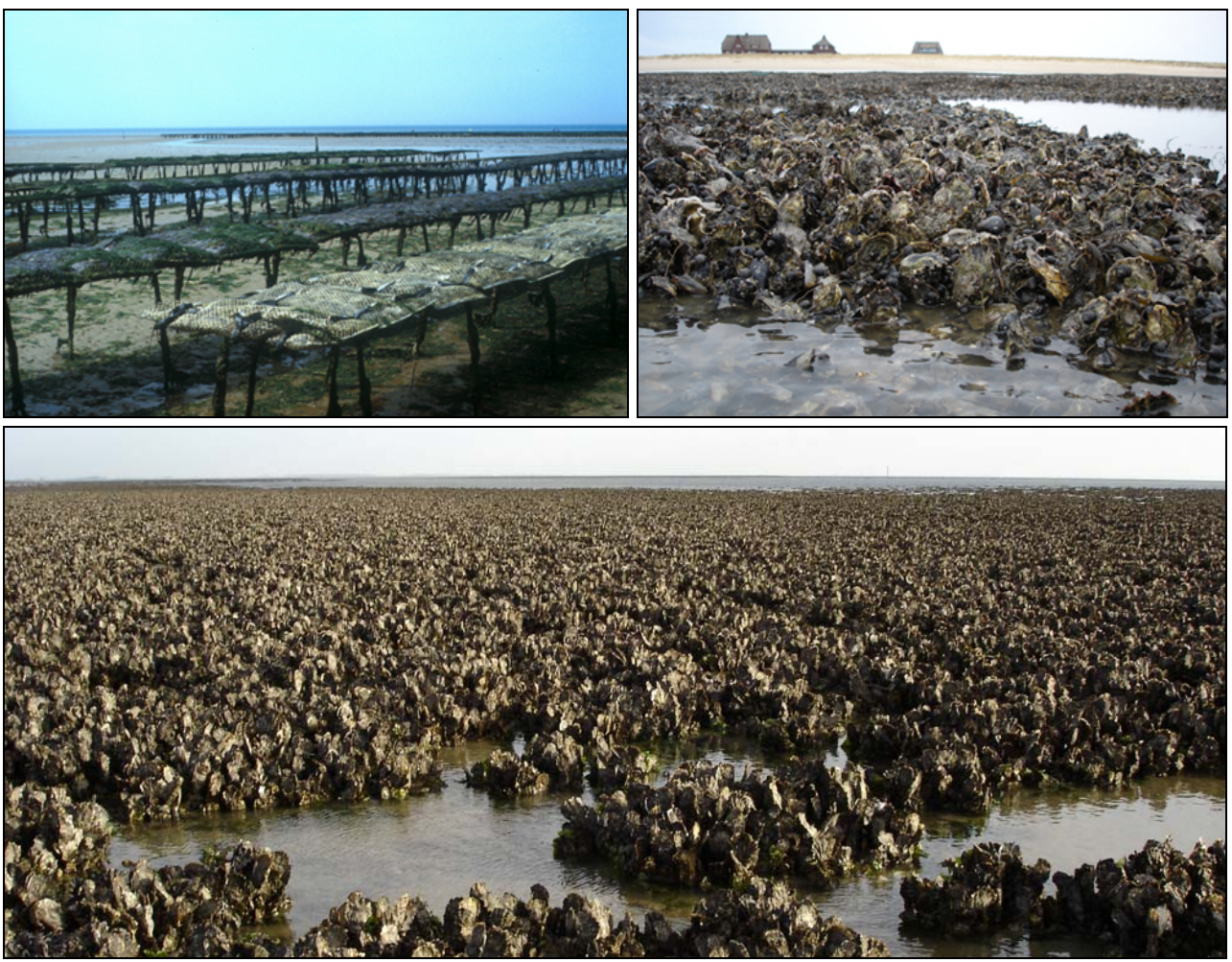
Fig. 4. Farming of Crassostrea gigas near the German island of Sylt, April 2003. Fig. 5. Oyster bed Crassostrea gigas in the German Wadden Sea near the island of Sylt, January 2005. Fig 6. Oyster bed Crassostrea gigas in the Dutch Oosterschelde estuary, November 2005; photos by Stefan Nehring.