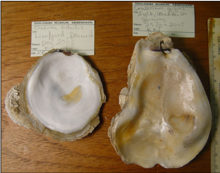
Fig. 3. Ostrea edulis and Crassostrea gigas , left values, (Oe) Limfjord, Denmark, December 2003, (Cg) German Wadden Sea near the island of Sylt, January 2005, photo by Kathe R. Jensen.