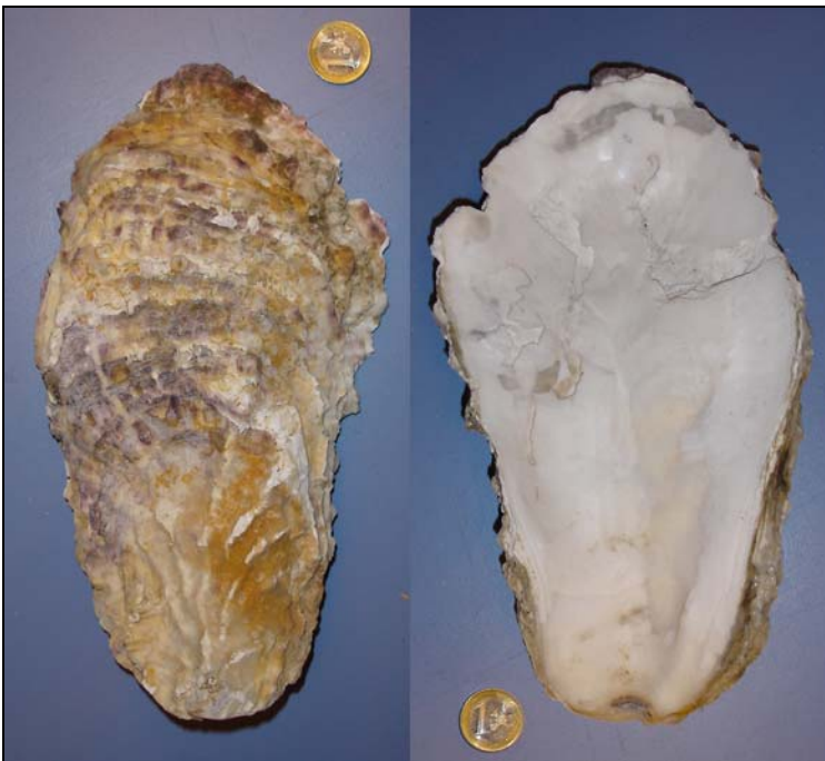
Fig. 1 and 2. Crassostrea gigas , right and left valve respectively of a more than 20 years old specimen, Dutch Oosterschelde estuary, undated; photos by Stefan Nehring.

Common names: giant oyster, Japanese oyster, Pacific oyster, Portuguese oyster (GB), ústřice obrovská (CZ), stillehavsøsters, japansk østers (DK), Felsenauster, Pazifische Auster, Pazifische Felsenauster, Portugiesische Auster (DE), Suur hiidauster (EE), risaostra (IS), Austre (LT), lielā austere (LV), ostryga pacyficzna (PL), Japanskt jätteostron (SE)