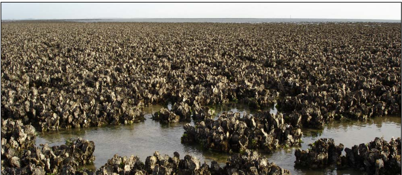
Fig. 4. Farming of Crassostrea gigas near the German island of Sylt, April 2003. Fig. 5. Oyster bed Crassostrea gigas in the German Wadden Sea near the island of Sylt, January 2005. Fig 6. Oyster bed Crassostrea gigas in the Dutch Oosterschelde estuary, November 2005.