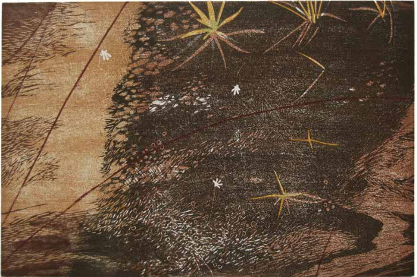
Within the Sand Sheets , water-based woodblock print, 30.3 x 45 cm, 2015.