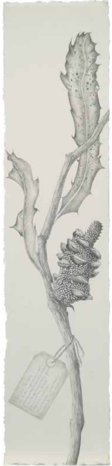
Nymphoides spongiosa , Drosera petiolaris and Banksia dentata , watercolour, colour pencil and graphite on 600gsm Arches hot press watercolour paper, 57 x 13 cm, 2015.