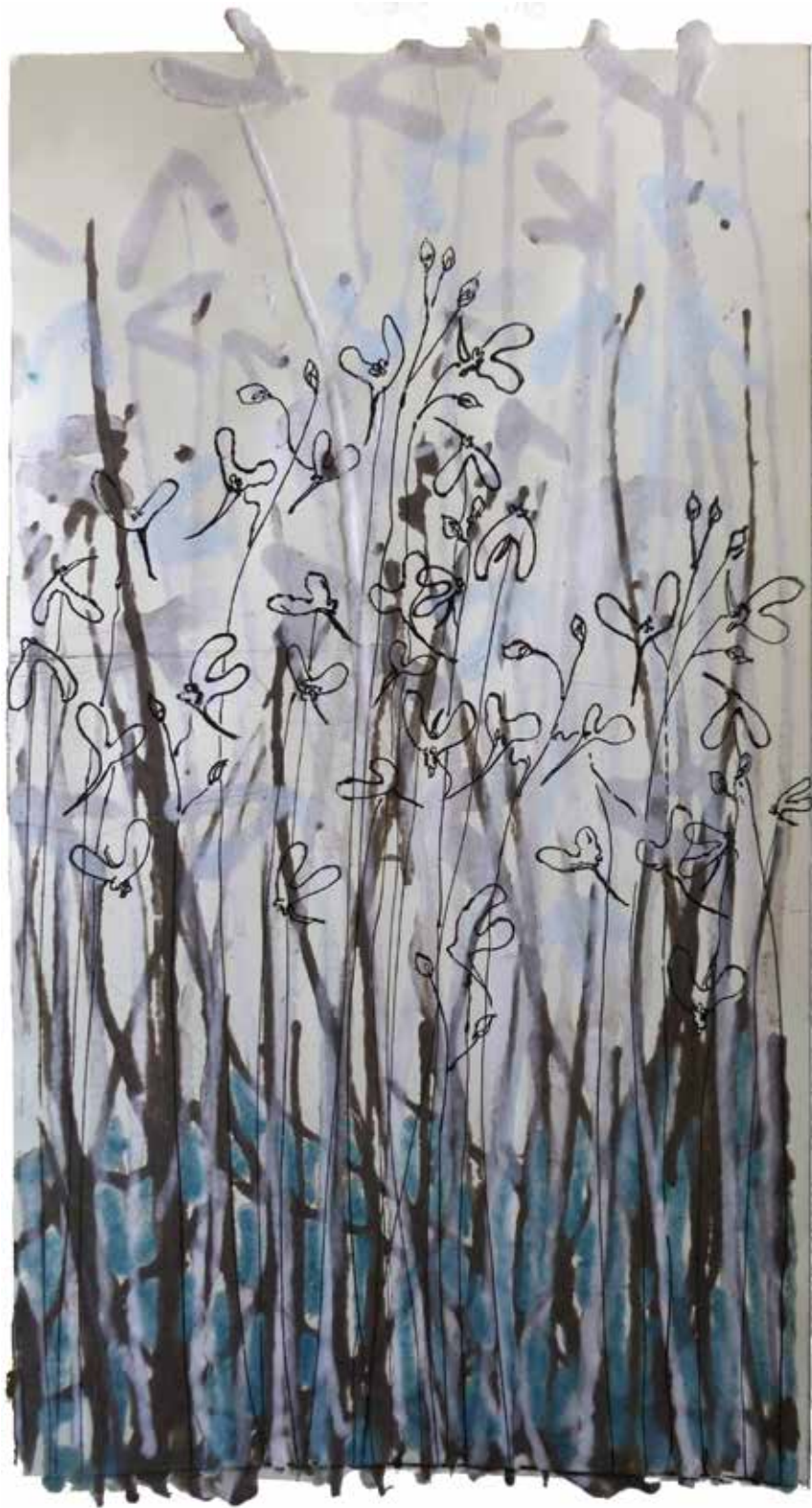
U. leptoplectra , drypoint on pigmented cotton pulp chin colle, 75 x 48 cm, 2015.