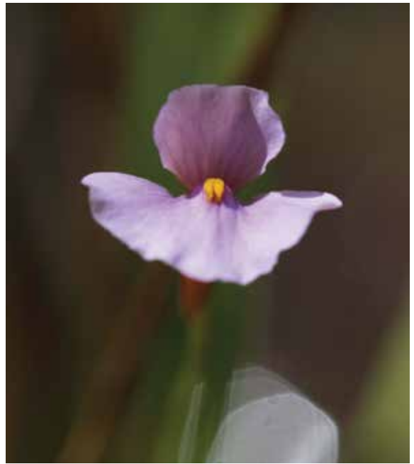
Clockwise from top left: U. chrysantha , Utricularia dunstaniae , Utricularia lasiocaulis , Utricularia holtzei .