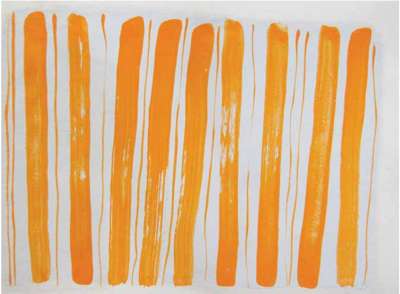
Grevillea , mixed media on paper, 30 x 40 cm, 2015.