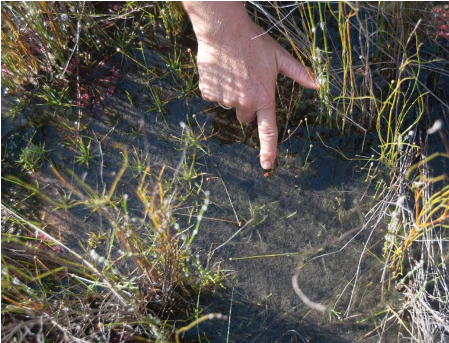
Looking at a Utricularia dunstaniae flower bud.