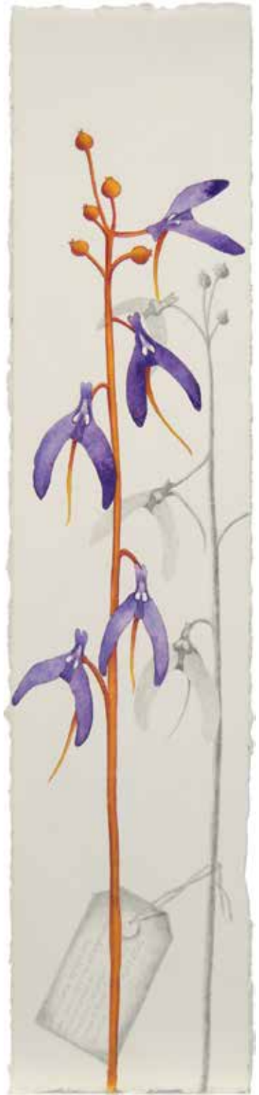
Utricularia hamiltonii , Sowerbaea alliacea and Utricularia leptoplectra watercolour, colour pencil and graphite on 600gsm Arches hot press watercolour paper, 57 x 13 cm, 2015.