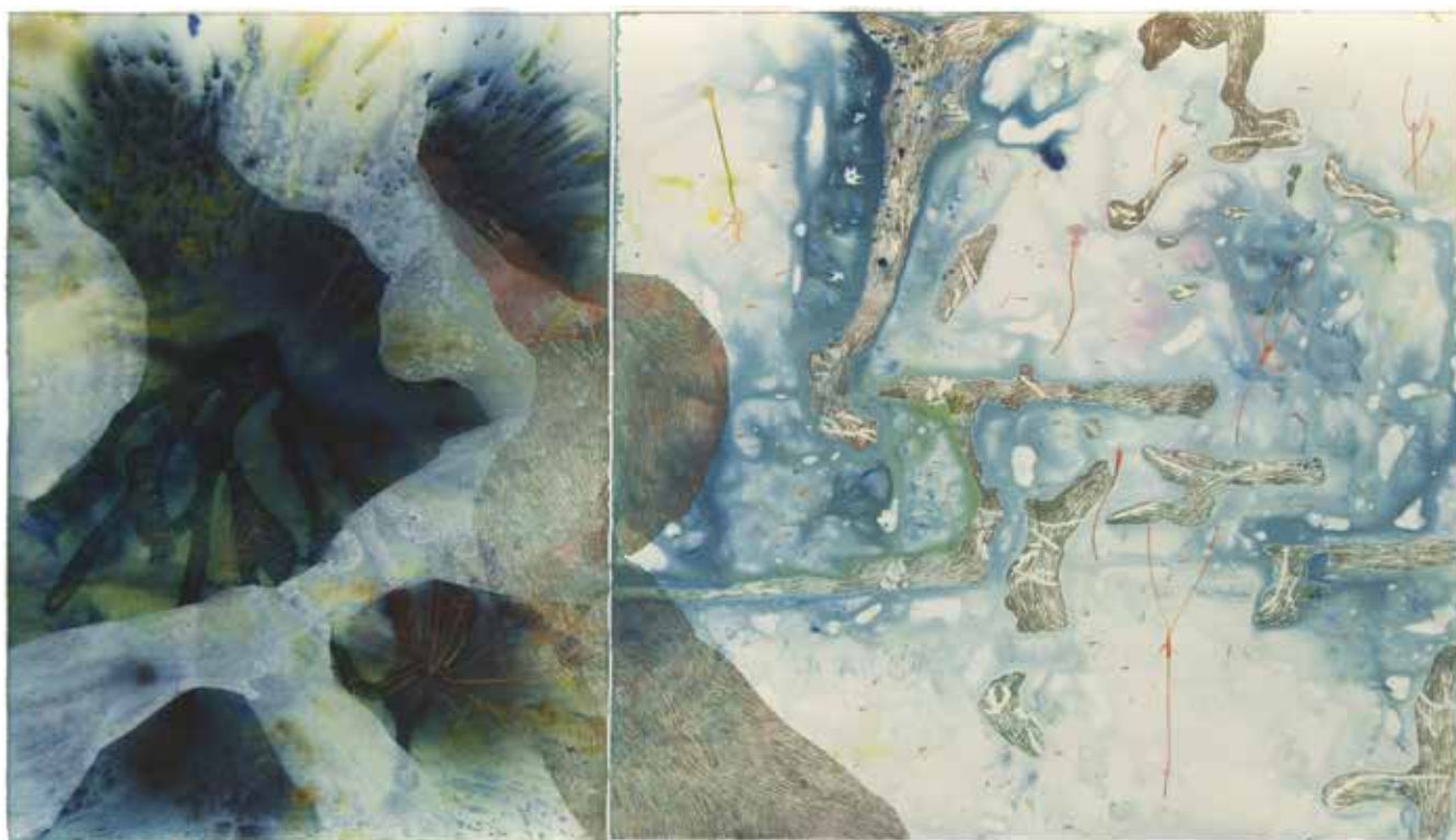
U. leptoplectra enviros , mixed medium on paper, 28 x 48 cm, 2015