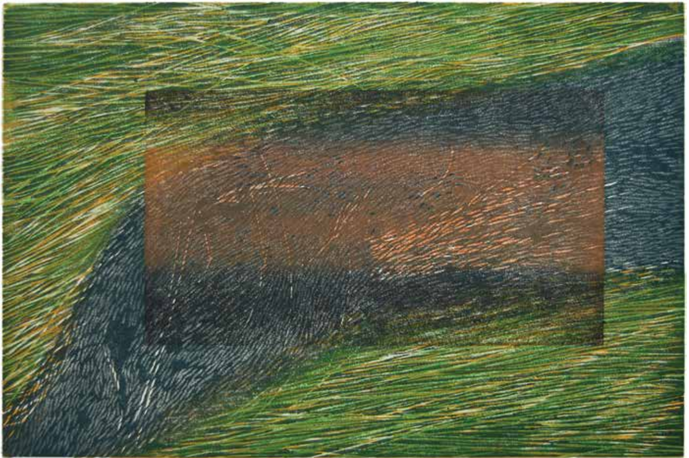
Standing in Water (Utricularia dunstaniae) , water-based woodblock print, 30.3 x 45 cm, 2015.