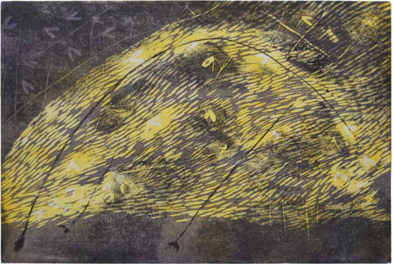
Flight of U. Leptoplectra , water-based woodblock print, 30.3 x 45 cm, 2015.