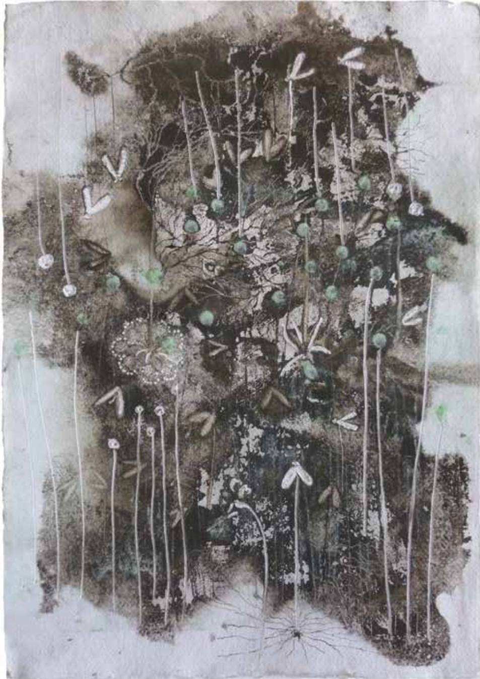
Lurch, Howard sand sheets mud on rag paper, 42 x 30cm, 2015.