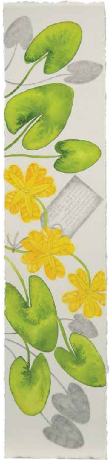
Xyris indica , Utricularia odorata and Nymphoides subacuta , watercolour, colour pencil and graphite on 600gsm Arches hot press watercolour paper, 57 x 13 cm, 2015.