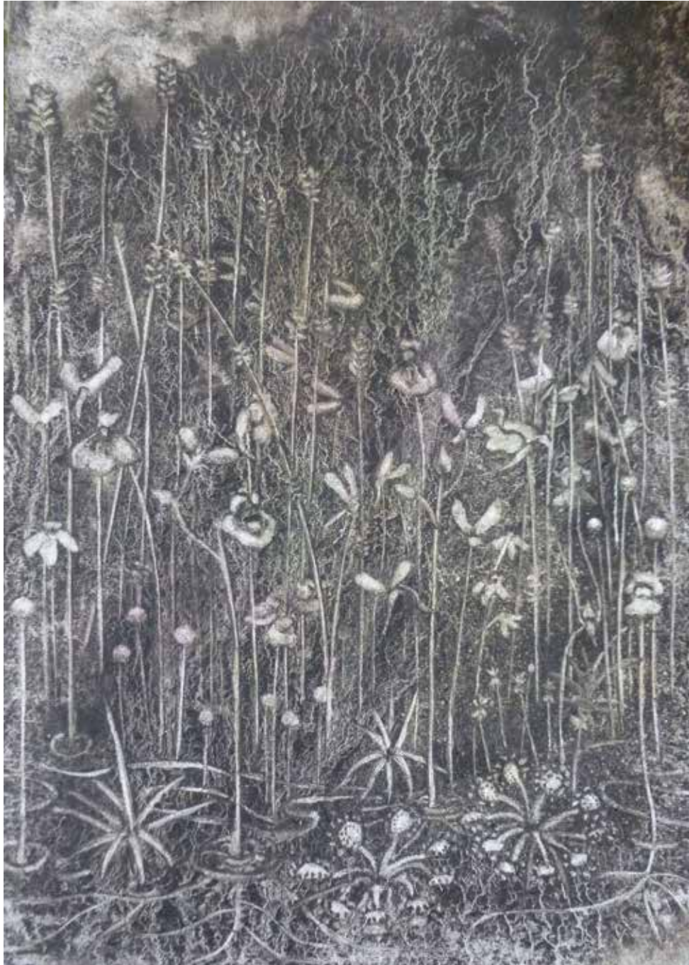
This fragile piece of turf (after Durer), Howard sand sheets mud and ink on rag paper, 42 x 30cm, 2015