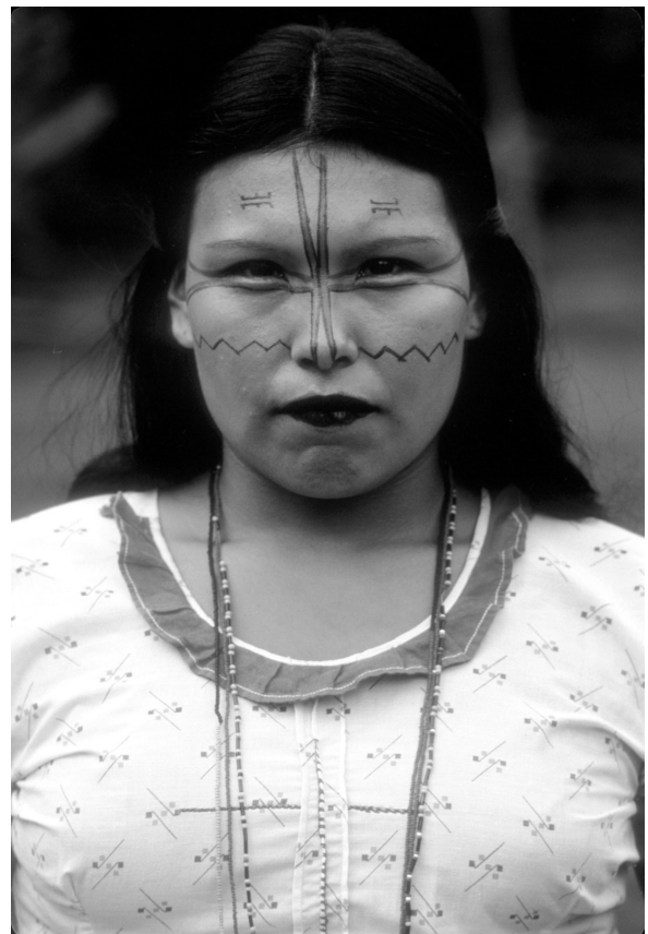
Fig. 3: A Secoya woman from the village of San Pablo (Ecuador) shows blackened lips complemented by geometric facial decorations (1980).

More recent descriptions of lip blackening by Mai Huna echoed this account. Initially the lips were prepared with the rough leaf of gere , the wild grape ( Pouroma spp., e.g., Pouroma cecropiifolia