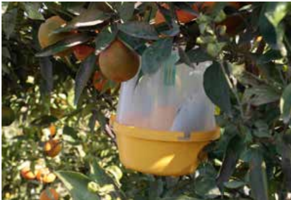
Figure 6.9.6 Ceratitis capitata monitoring trap in Citrus orchard