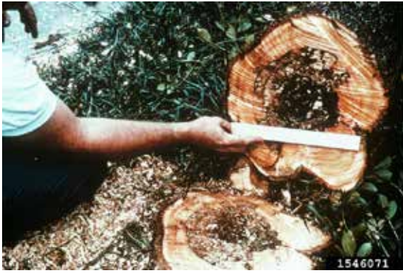
Figure 6.1.2 Tree damage caused by Coptotermes formosanus