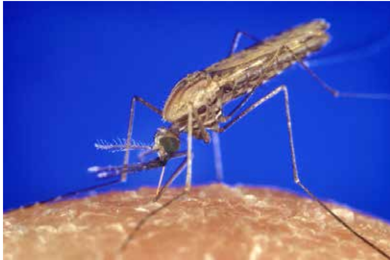
Figure 6.6.1 Anopheles gambiae adult feeding