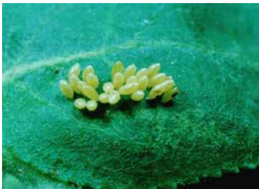
Figure 6.2.2 Harmonia axyridis eggs