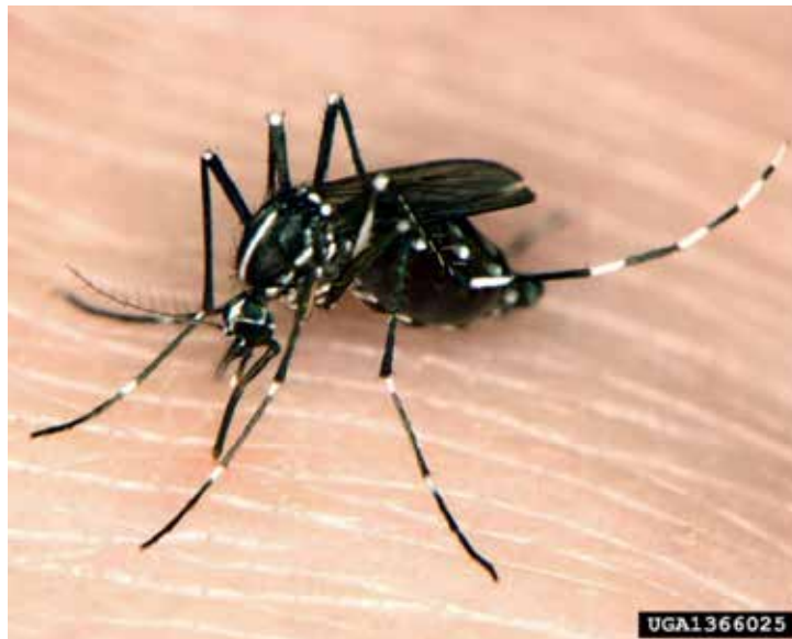
Figure 6.5.1 Adult Aedes albopictus