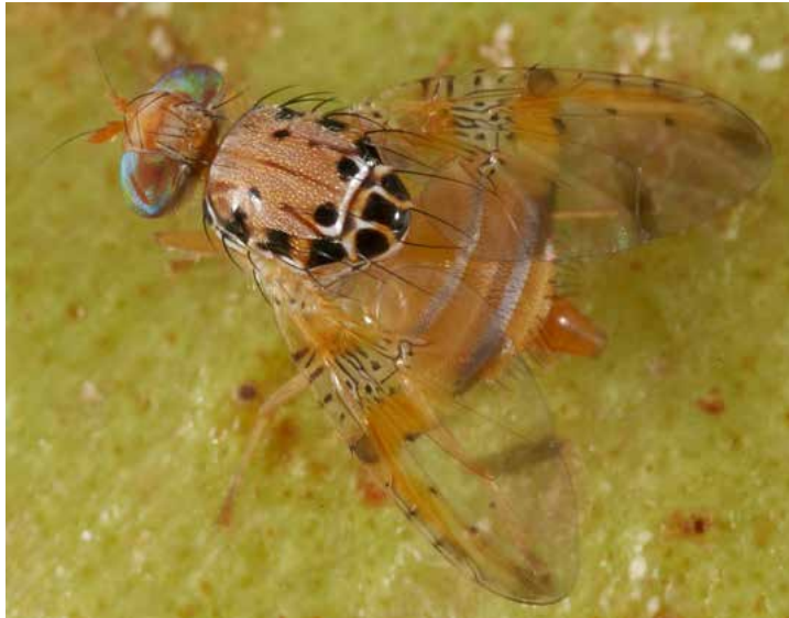
Figure 6.10.1 Ceratitis cosyra adult female, intercepted as larvae on mango from Kenya