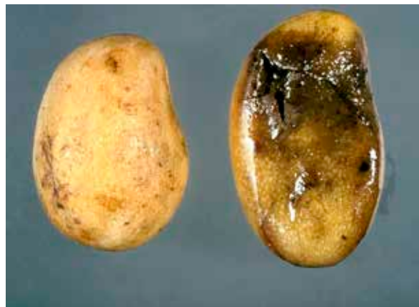
Figure 6.8.5 Rotting mango ( Mangifera indica ) fruit imported from the Philippines heavily infested with Bactrocera dorsalis larvae