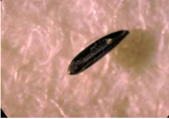
Figure 6.4.2 Aedes aegypti egg