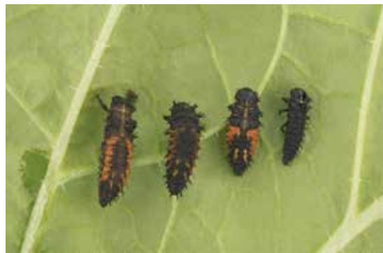
Figure 6.2.3 Harmonia axyridis larvae