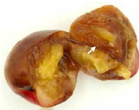
Figure 6.12.4 Drosophila suzukii larval feeding damage and eggs