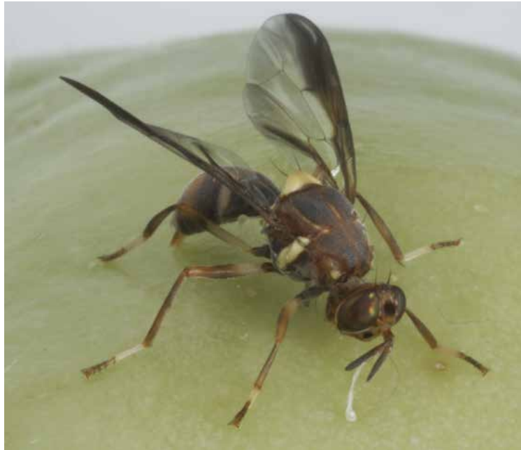
Figure 6.11.1 Dacus bivittatus adult reared from Lagenaria siceraria ex Ghana