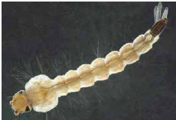
Figure 6.5.5 Aedes albopictus larva