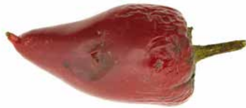
Figure 6.9.5 Ugandan pepper with oviposition and larval exit holes made by Ceratitis capitata