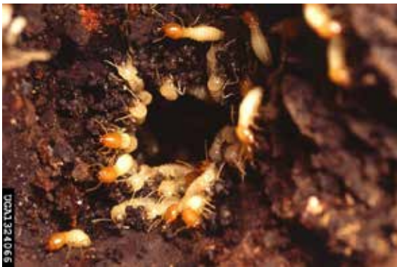
Figure 6.1.4 Damage to a nest of Formosan subterranean termites brings large numbers of workers and soldiers with dark, oval shaped heads scrambling to repair the hole