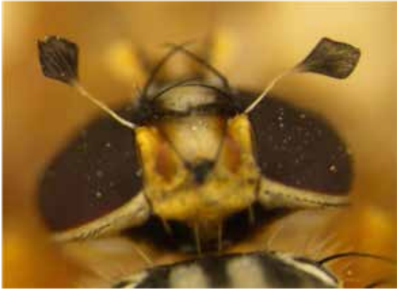
Figure 6.9.2 Ceratitis capitata male orbital setae