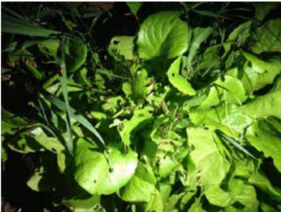
Figure 6.3.4. Forficula auricularia feeding on lettuce at night