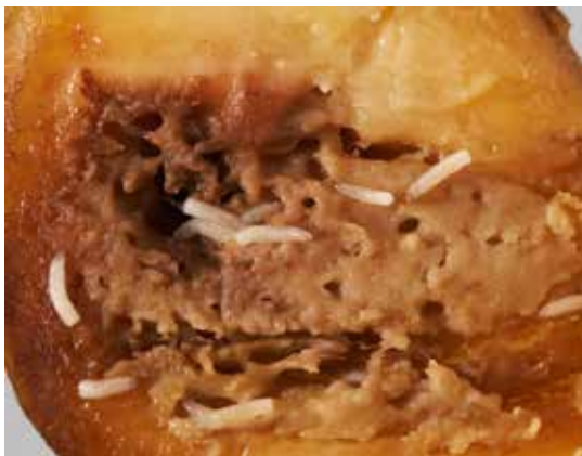
Figure 6.8.4 Oriental fruit fly, Bactrocera dorsalis , larvae tunnelling in a mango ( Mangifera indica )