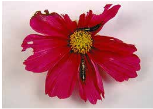
Figure 6.3.5 Forficula auricularia feeding damage on ornamental flower © RHS.org.