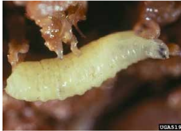
Figure 6.9.3 Ceratitis capitata larva