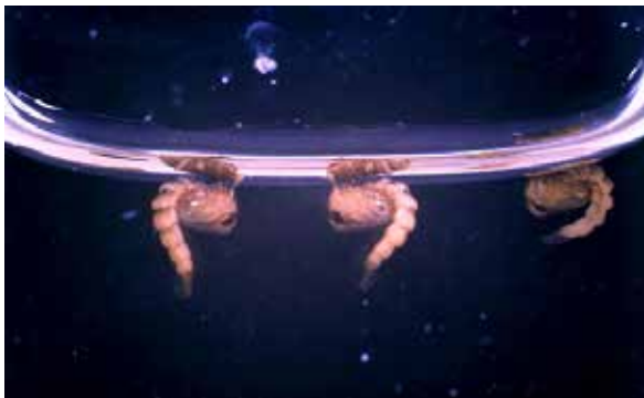
Figure 6.4.4 Aedes aegypti pupae suspended from the water surface by their respiratory trumpets