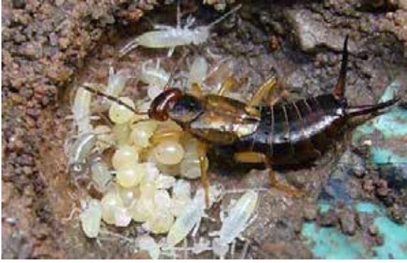
Figure 6.3.2 Adult female Forficula auricularia with eggs and young