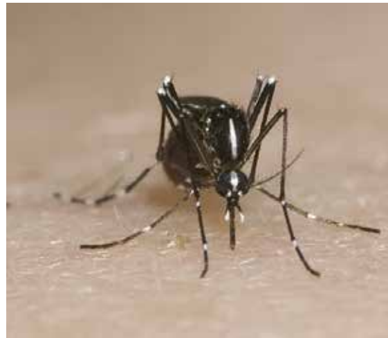
Figure 6.5.4 Aedes albopictus female feeding on Homo sapiens