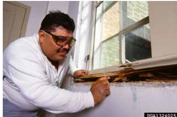
Figure 6.1.5 Termite damage to a windowsill. The nest was located two floors below in the soil. Much of the wood had been consumed before they were detected.