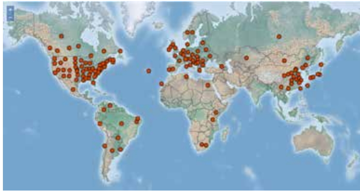
Harmonia axyridis distribution map