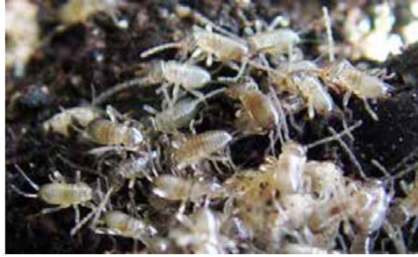
Figure 6.3.3 Immature (first instar) Forficula auricularia