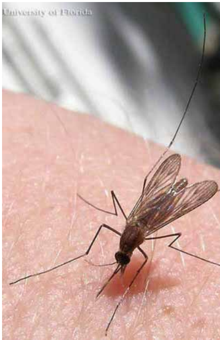
Figure 6.7.4 Adult female Anopheles quadrimaculatus feeding

Adult A. quadrimaculatus rest with their abdomens positioned at a discrete angle to the surface whereas other species keep their bodies parallel to the surface which helps in identification when sitting on skin (Rios and Connelly, 2015) (Figure 6.7.4). The abdomen and wings are dark brown in colour with the wings having dark scales and patches of scales forming four darker spots (Carpenter and LaCasse, 1955) (Figures 6.7.1 and 6.7.4). Females have a body and wing length of about 5mm. The males have a body length of about 5.5 mm and a wing length of 4.5mm (Carpenter and LaCasse, 1955). Species in the genus Anopheles have long palps approximately equal in length to the proboscis (Carpenter and LaCasse, 1955).