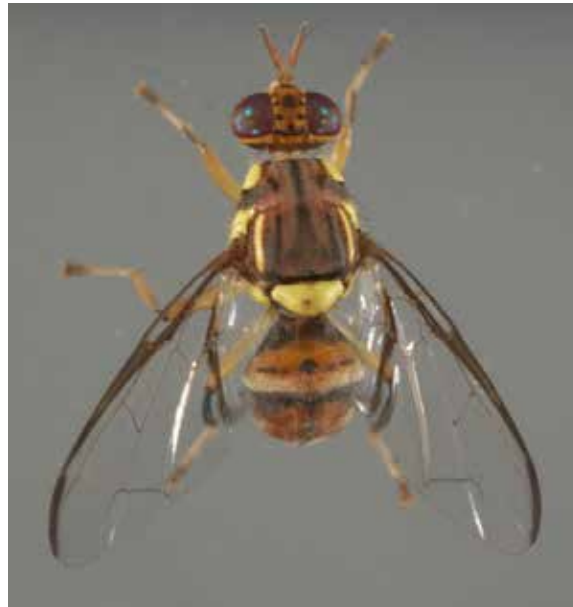
Figure 6.8.1 Adult male Bactrocera dorsalis reared from guava exported from Sri Lanka