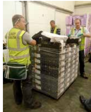
Figure 6.9.7 UK Plant Health Service inspectors examining imported fruit

Important hosts for the South Atlantic region include apple ( Malus sp.), avocado ( Persea americana ), various Citrus spp., coffee ( Coffea spp.), fig ( Ficus carica ), kiwifruit ( Actinidia deliciosa ), lychee ( Litchi spp.), longan ( Dimocarpus longan ), , mango ( Mangifera indica ), pear ( Pyrus communis ), peppers ( Capsicum spp.), peach ( Prunus persica ), guava ( Psidium guajava ), strawberry-guava ( Psidium cattleianum ) and a variety of endemic wild hosts (White & Elson-Harris, 1994; Cabi, 2019).