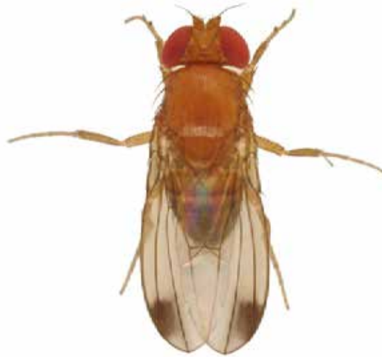
Figure 6.12.1 Drosophila suzukii adult male