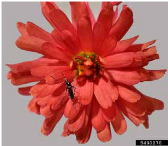
Figure 6.5.3 Aedes albopictus resting on flower (unknown species)