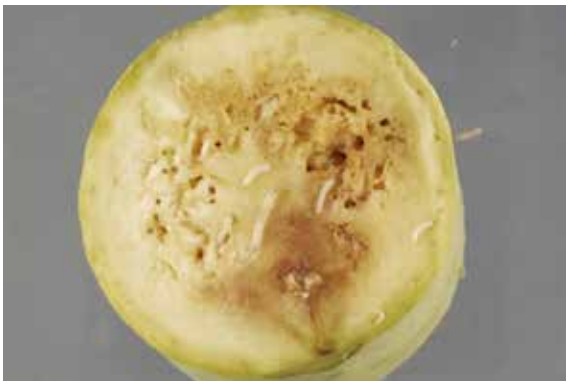
Figure 6.11.4 Dacus bivittatus larval tunnels in Lagenaria siceraria Ex Ghana