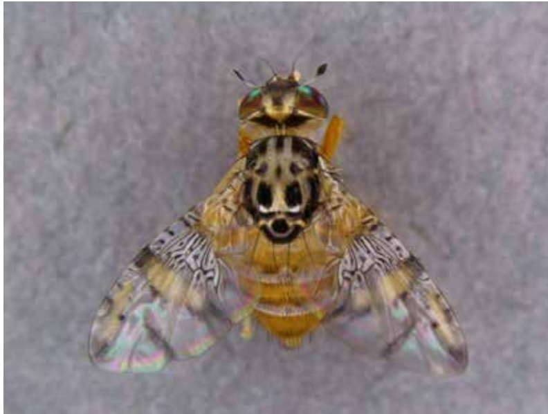
Figure 6.9.1 Ceratitis capitata adult male