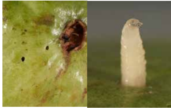
Figure 6.8.3 Bactrocera dorsalis larva and emergence hole in guava ( Psidium guajava ) fruit