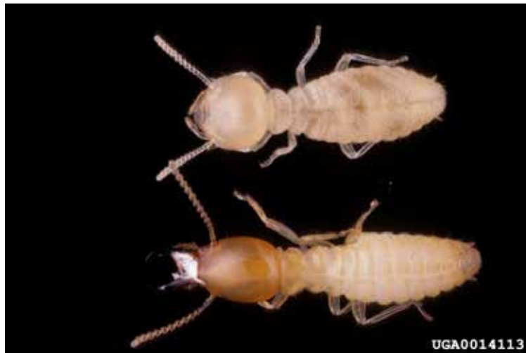
Figure 6.1.1 Formosan Subterranean Termite worker (top), soldier (bottom)