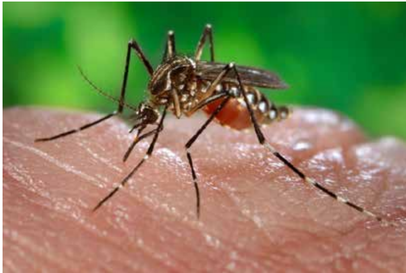
Figure 6.4.1 Adult female Aedes aegypti acquiring a blood meal from a human host