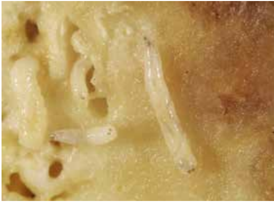
Figure 6.11.2 Dacus bivittatus larvae on Lagenaria siceraria Ex Ghana