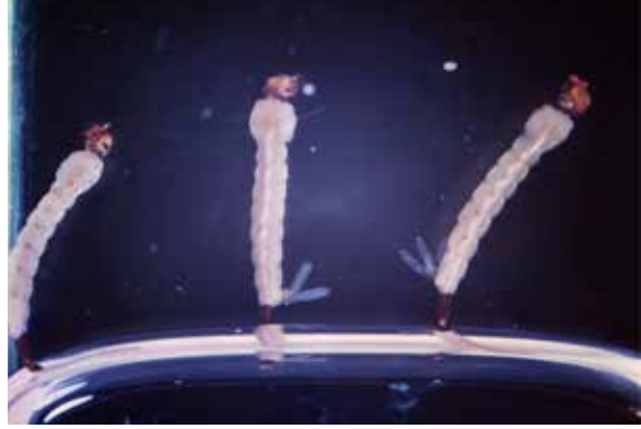
Figure 6.4.3 Fourth instar Aedes aegypti larvae