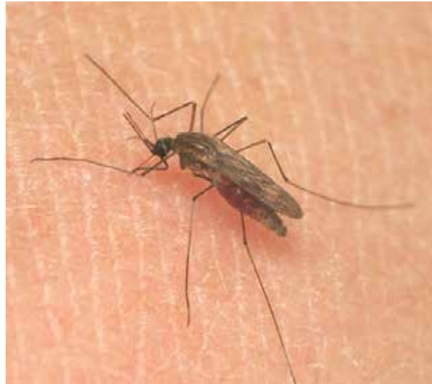
Figure 6.7.1 Female Anopheles quadrimaculatus