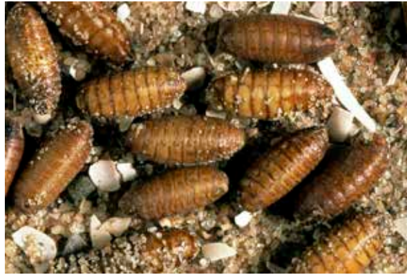
Figure 6.11.3 Dacus bivittatus pupae on Lagenaria siceraria Ex Ghana