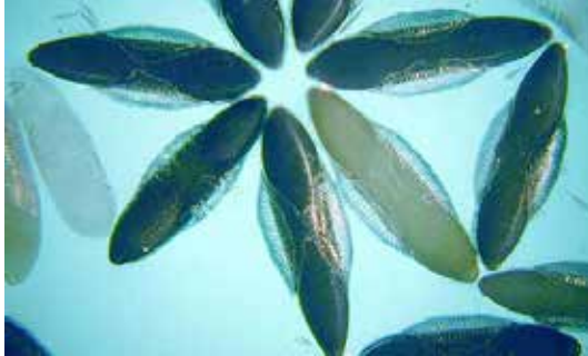
Figure 6.7.2 Anopheles quadrimaculatus eggs