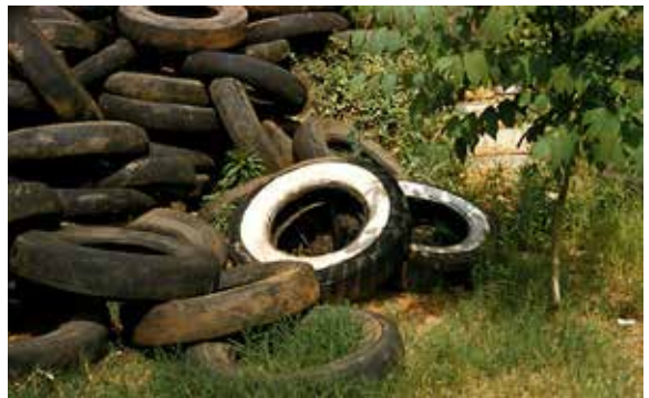
Figure 6.4.5 Discarded tyres collect rainwater and act as prime breeding sites for species of mosquitoes such as Aedes aegypti