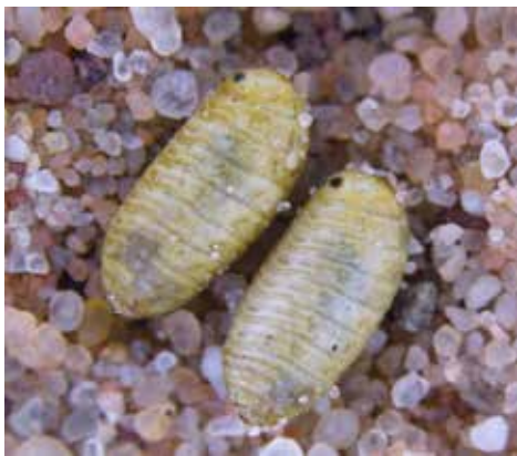
Figure 6.9.4 Ceratitis capitata pupae