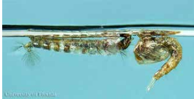
Figure 6.7.3 Anopheles quadrimaculatus larva (left) and pupa (right)