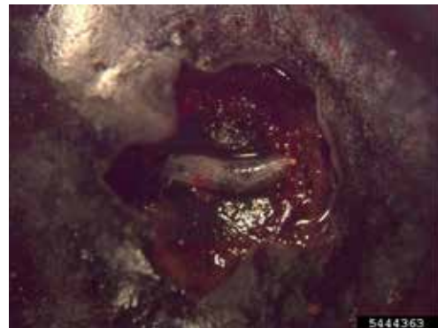
Figure 6.12.5 Drosophila suzukii larva.