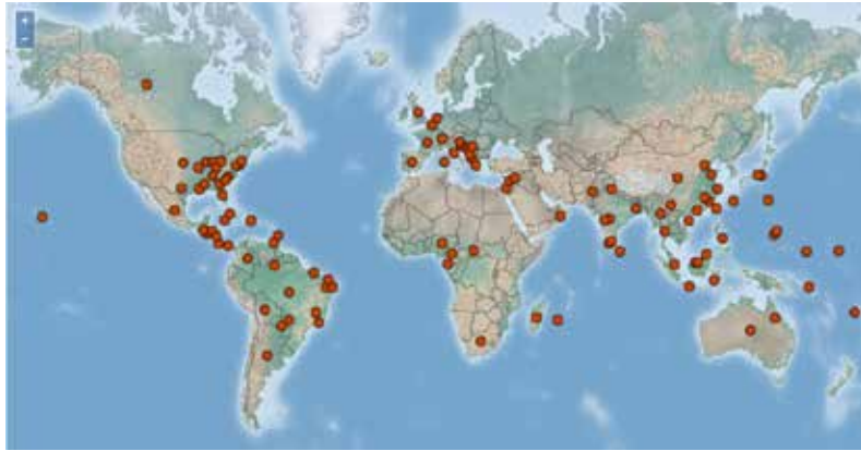
Figure 6.5.2 Aedes albopictus distribution map © CABI