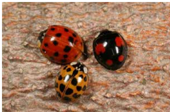
Figure 6.2.4 Examples of the many variant colour forms of adult Harmonia axyridis