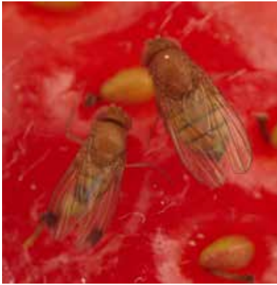
Figure 6.12.2 Drosophila suzukii adult male (left) and female (right)