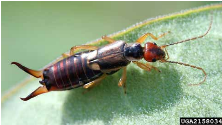
Figure 6.3.1. Forficula auricularia adult female