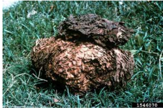
Figure 6.1.3 Coptotermes formosanus carton nest