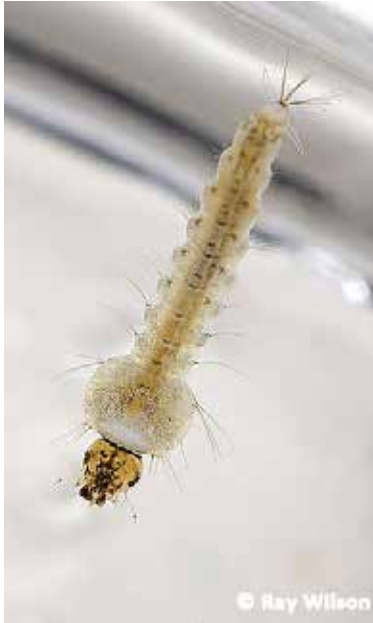
Figure 6.6.2 Anopheles gambiae larva

Adult female Anopheles can be distinguished from other mosquito genera because the palps (appendages found near the mouth) are as long as their proboscis. Adult Anopheles also have a distinctive resting position where their abdomen is raised into the air (Fig. 6.6.1) (Foster & Walker 2009). Anopheles gambiae have a variable body colour, but it typically ranges from light brown to grey with pale spots of yellow, white or cream scales, and dark areas on their wings. Adults are small to medium-sized mosquitoes with average wing length varying from 2.8-4.4 mm (Gillies & de Meillon 1968). Eggs are about 0.5 mm long, convex below and concave above, and the surface is covered with a polygonal pattern (Gillies & de Meillon 1968). Anopheles gambiae lay their eggs singly and directly on the water, with each egg having floats on either side (Foster & Walker 2009). All Anopheles larvae (Fig. 6.6.2) lack the respiratory siphons used as breathing tubes found in most other mosquito genera, and therefore the larvae lie parallel to the water surface to breathe. Anopheles mosquitoes develop through four larval instars before pupating (Foster & Walker 2009). Fourth instar larvae reach 5-6 mm (Gillies & de Meillon 1968). They feed on organic matter and algae (Garros et al. 2008). The pupae are comma-shaped and highly mobile; they use the paddle at the end of their abdomen to quickly move through the water (Foster & Walker 2009).