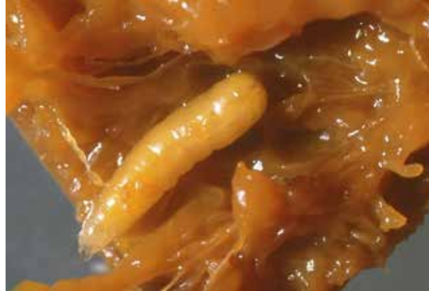
Figure 6.10.3 Fruitfly larva feeding on mango pulp

The main commercial fruit host the fly attacks is mango ( Mangifera indica ), although the invasive Bactrocera dorsalis has largely displaced it as the main fruit fly pest of this host in Africa (Ekesi et al. , 2009). Others include guava ( Psidium guajava ), sour orange ( Citrus aurantium ), avocado ( Persea americana ), maroola/marula plum ( Sclerocarya birrea ), peach ( Prunus persica ) and custard apple ( Annona spp.). It is highly polyphagous on wild hosts, including species of Apocynaceae, Canellaceae, Chrysobalanaceae, Ebenaceae, Euphorbiaceae, Fabaceae, Flacourtiaceae, Loganiaceae, Passifloraceae, Polygalaceae, Rubiaceae and Sapotaceae. (White & Elson-Harris, 1992; Virgilio et al. , 2014).