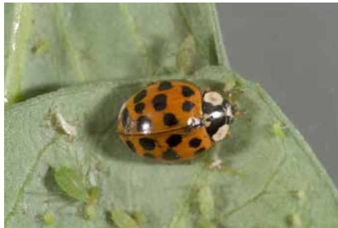
Figure 6.2.1 Harmonia axyridis adult