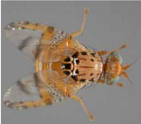
Figure 6.10.2 Ceratitis cosyra adult male, intercepted as larvae on mango from Kenya