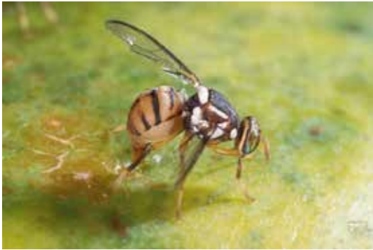
Figure 6.8.2 Bactrocera dorsalis adult female ovipositing in a papaya fruit