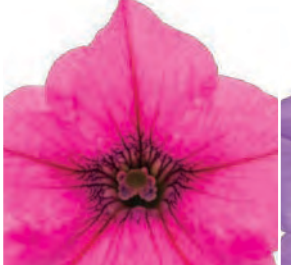
SUPERTUNIA MINI VISTA® Hot Pink Petunia 'USTUN2401M' USPP29664 Can6057

SUPERTUNIA MINI VISTA® Indigo Petunia 'BBTUN93201' USPP33278 CanPBRAF