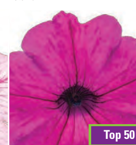
SUPERTUNIA® ROYAL MAGENTA® Petunia "INPETROYMA" USPP29811 Can6045