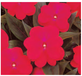
INFINITY® Cherry Red Impatiens hawkerii 'Visinfchrimp' USPP20965