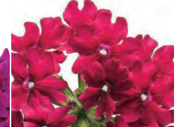
SUPERBENA ROYALE® Romance Verbena 'RIKAV38602' USPP29013 Can5787