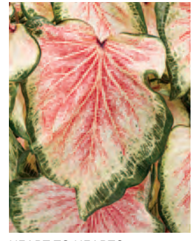
HEART TO HEART® 'Bold 'N Beautiful' Caladium hortulanum USPP30696