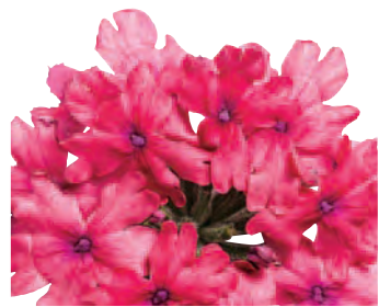
SUPERBENA® Coral Red Verbena 'AKIV98-01' USPP21639 Can4146