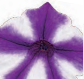
SUPERTUNIA MINI VISTA® Violet Star SUPERTUNIA MINI VISTA® White Petunia 'USTUNJ1901' USPP28051 Can5516