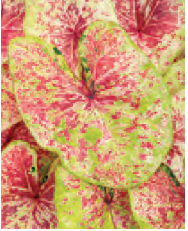
HEART TO HEART® 'Raspberry Moon' Caladium hortulanum USPP20069