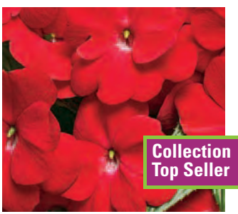
INFINITY® Red Impatiens hawkerii 'Vinfsalbis' USPP23277