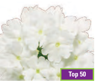
SUPERBENA® WHITEOUT™ Verbena <sup>'RIKA1832M3' USPP30897 Can6301</sup>