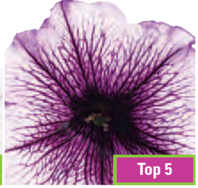
SUPERTUNIA® BORDEAUX<sup>™</sup> Petunia <sup>'Lanbor' USPP16144</sup> Can2532

SUPERTUNIA® LIMONCELLO® Petunia 'Pactoyel' USPP23282