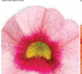
SUPERBELLS<sup>®</sup> STRAWBERRY PUNCH<sup>™</sup> SUPERBELLS<sup>®</sup> TANGERINE PUNCH<sup>™</sup> Calibrachoa 'USCAL58205' USPP22941 Can4590