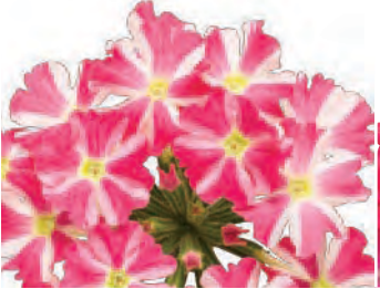
SUPERBENA ROYALE® Cherryburst Verbena <sup>'AKIV28902M1'</sup> USPP27388