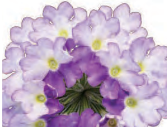
SUPERBENA SPARKLING® Amethyst Verbena 'DVERBINPR' USPPAF CanPBRAF