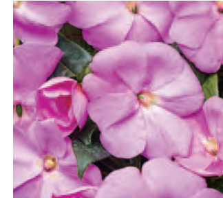
INFINITY® Lavender Impatiens hawkerii **** USPPAF CanPBRAF Sobkowich only