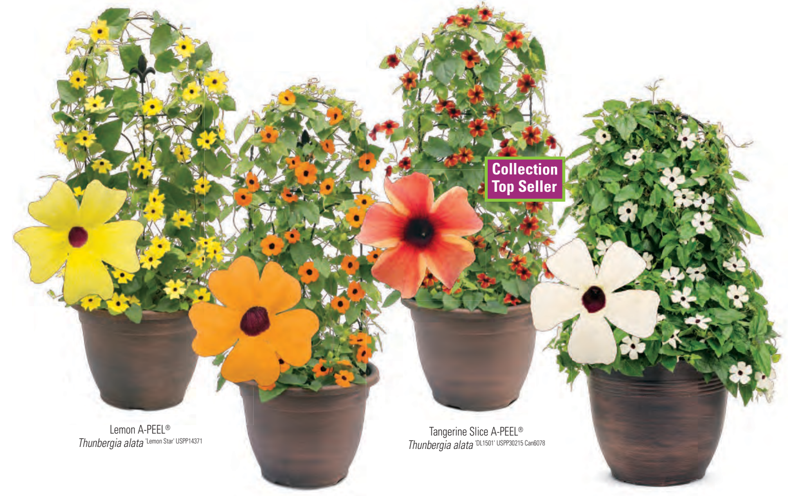
Orange A-PEEL® Thunbergia alata 'Orange Wonder' USPP14767

Coconut A-PEEL® Thunbergia alata "Volthu9327" USPPAF CanPBRAF