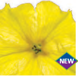
SUPERTUNIA MINI VISTA® Yellow Petunia '**' USPPAF CanPBRAF