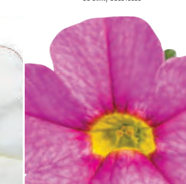
SUPERBELLS® Pink Calibrachoa 'USCALI11' USPP14968 Can1927