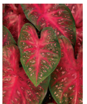
HEART TO HEART® FAST FLASH<sup>™</sup> Caladium hortulanum 'RFL 2317-114' USPP27964