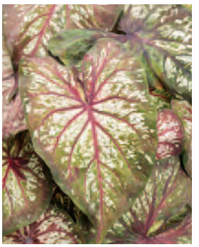
HEART TO HEART® 'Xplosion' Caladium hortulanum USPP31570