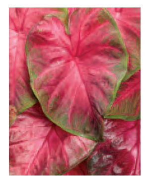
HEART TO HEART® 'Hot Flash' Caladium hortulanum USPP27944