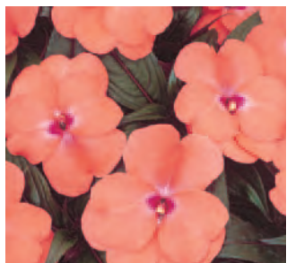
INFINITY® Salmon Impatiens hawkerii 'Visinfsalimp' USPP20971