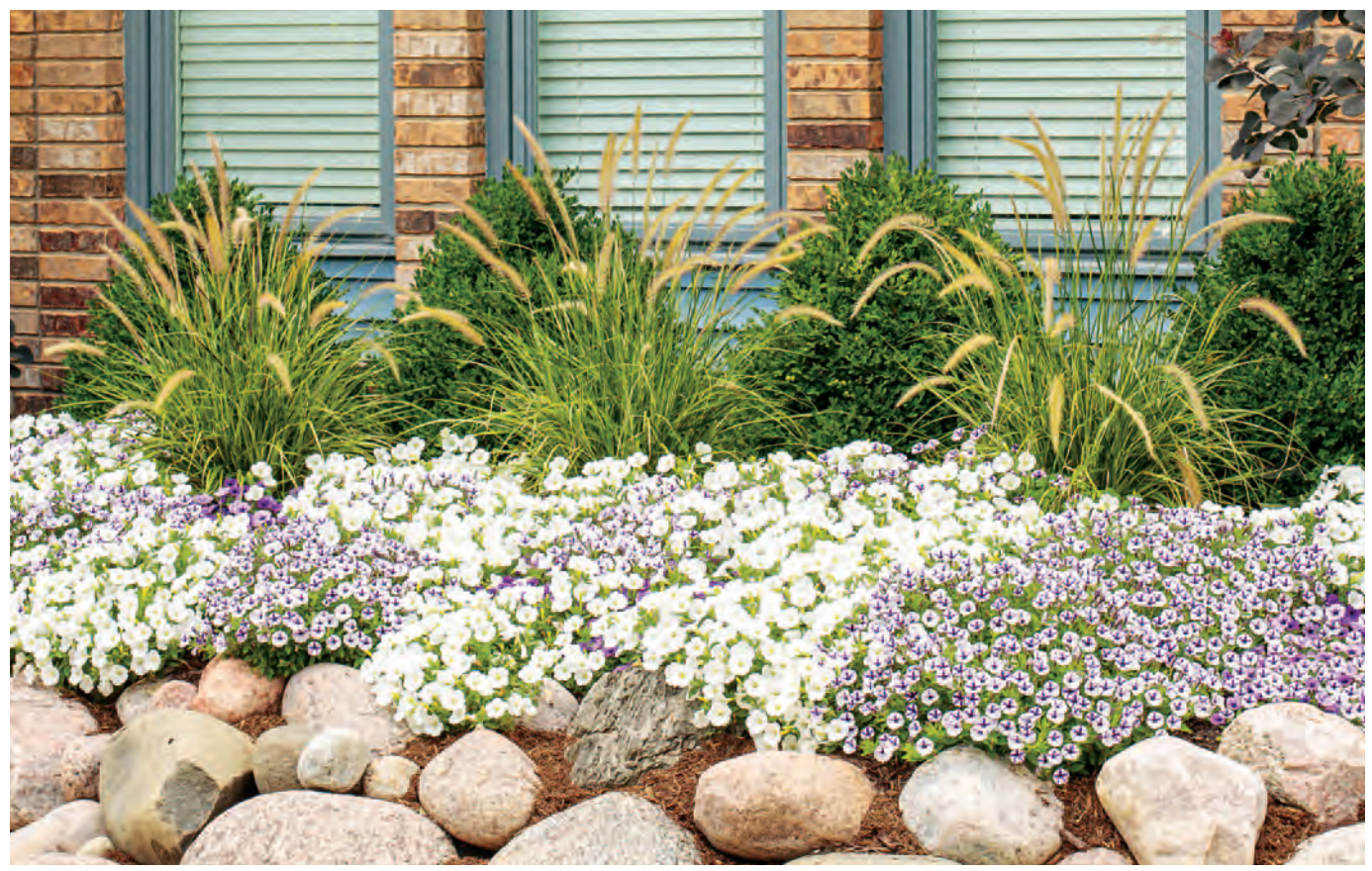
Above: SUPERTUNIA® MINI VISTA<sup>™</sup> Indigo Petunia, SUPERTUNIA® MINI VISTA<sup>™</sup> Violet Star Petunia, SUPERTUNIA MINI VISTA<sup>™</sup> White Petunia with GRACEFUL GRASSES® 'Sky Rocket' Pennisetum