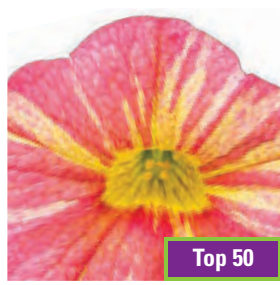
SUPERBELLS® Tropical Sunrise Calibrachoa 'INCALTRSUN' USPP29029 CanPBRAF