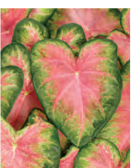
HEART TO HEART® 'Rose Glow' Caladium hortulanum USPP20070