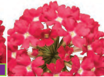
SUPERBENA® Scarlet Star Verbena 'RIKAV44501' USPP30898 Can6298