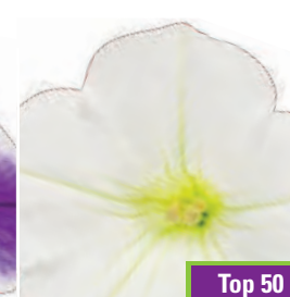
Petunia 'USTUN87002' USPP30833 Can6295