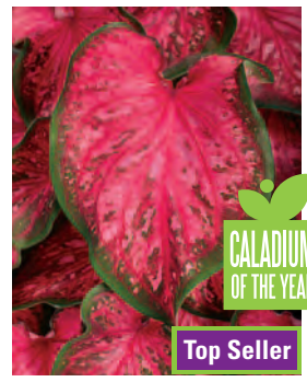
HEART TO HEART® 'Scarlet Flame' Caladium hortulanum USPP25419