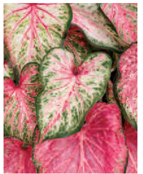
HEART TO HEART® 'Blushing Bride' Caladium hortulanum USPP22213