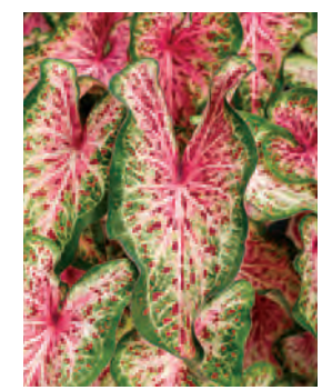
HEART TO HEART® 'Heart and Soul' Caladium hortulanum USPP31567