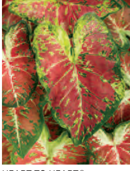
HEART TO HEART® 'Dawn to Dusk' Caladium hortulanum USPP23991