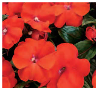
INFINITY® Orange Impatiens hawkerii "*** USPPAF CanPBRAF