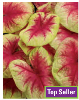
HEART TO HEART® 'Lemon Blush' Caladium hortulanum USPP25450