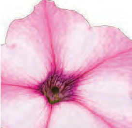
SUPERTUNIA MINI VISTA® Pink Star Petunia "USTUNJ2401" USPP28028 Can5517