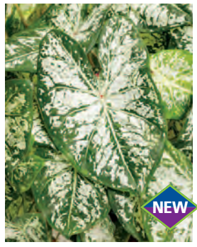
HEART TO HEART® 'Snow Flurry' Caladium hortulanum USPP31569