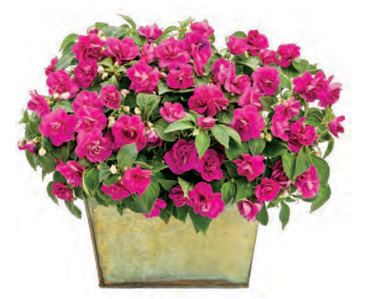
ROCKAPULCO® Purple Impatiens walleriana 'BALFIEPRIM' USPP18867 Can3361