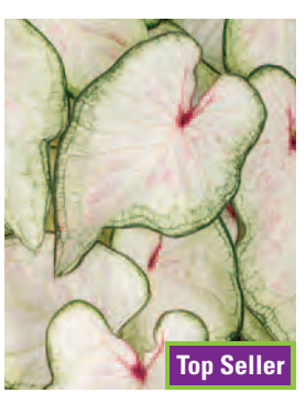
HEART TO HEART® 'White Wonder' Caladium hortulanum USPP21044