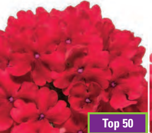
SUPERBENA® Red Verbena 'RIKAV44101' USPP30962 Can6297