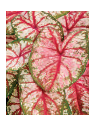
HEART TO HEART® 'Bottle Rocket' Caladium hortulanum USPP30651