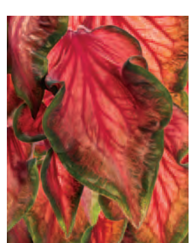
HEART TO HEART® 'Hot 2 Trot' Caladium hortulanum USPPAF