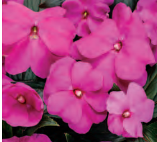
INFINITY® Light Purple Impatiens hawkerii *** USPPAF CanPBRAF Sobkowich only