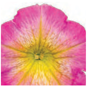
SUPERTUNIA® Daybreak Charm Petunia 'USTUN69002' USPP27727 Can5514