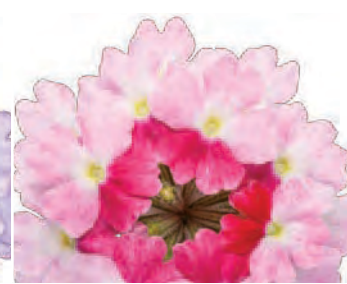
SUPERBENA SPARKLING® Rosé Verbena 'RIKAV52102' USPP32683 CanPBRAF