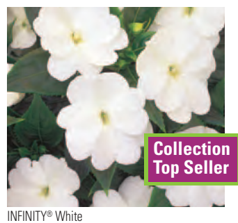
Impatiens hawkerii "Visinfwhiimp" USPP20984