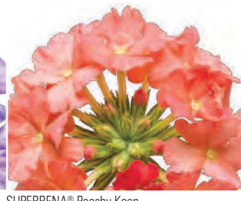
SUPERBENA® Peachy Keen Verbena 'RIKAV36504' USPP29063 Can5786