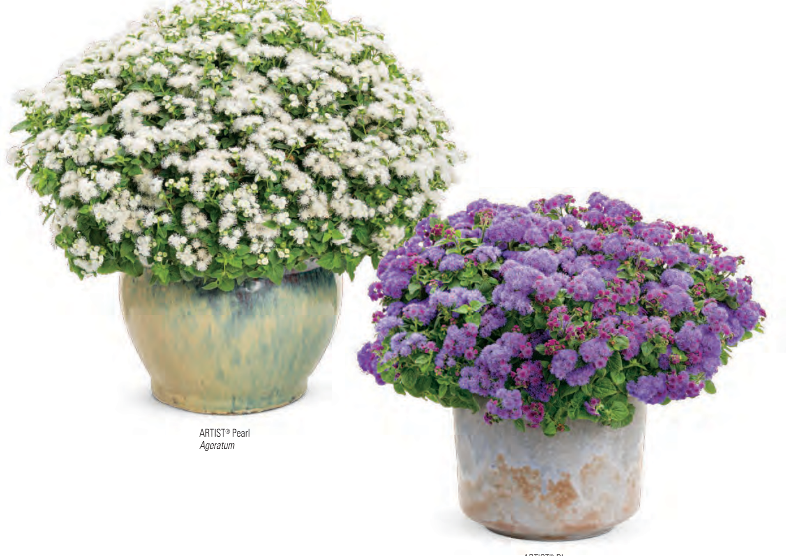
ARTIST® Blue Ageratum 'Agsantis' USPP15289 Can2050

84 Awards including: Excellent Rating, Disney; Best of the Best, University of Georgia; Best of Species, Penn State; Top Pick, Dallas Arboretum; Top Performer, Kansas State University