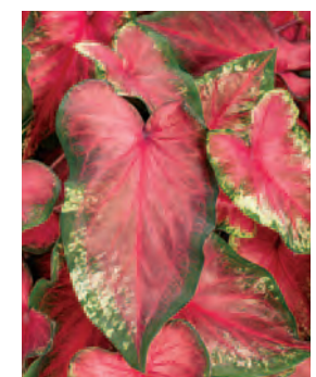
HEART TO HEART® 'Heart's Delight' Caladium hortulanum USPP23992