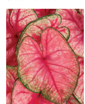
HEART TO HEART® 'Radiance' Caladium hortulanum USPP27095