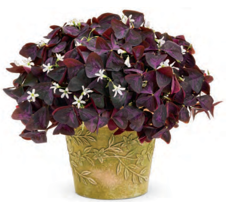
CHARMED<sup>®</sup> Wine Oxalis triangularis 'JROXBURWI' USPP17557 Can2949

2 Awards: Arboretum Approved, Dallas Arboretum; Best of Species, Penn State