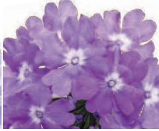
SUPERBENA® Violet Ice Verbena 'RIKAV18302' USPP25396 Can4786