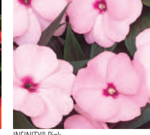
INFINITY® Pink Impatiens hawkerii 'Visinpink' USPP16419