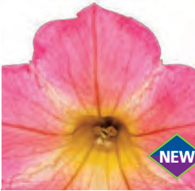
SUPERTUNIA® Persimmon Petunia '**' USPPAF CanPBRAF

SUPERTUNIA® LOVIE DOVIE™ Petunia 'BBTUN91601' USPP29663 Can6056