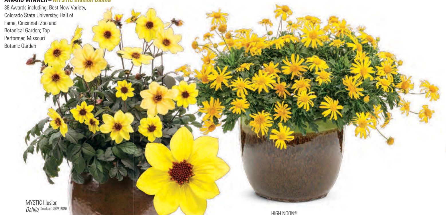
HIGH NOON® Euryops pectinatus 'EUR 16001' USPP32669 CanPBRAF

15 awards including: Top Performer, Daniel A. Seguin Garden; Top Performer, Montreal Botanic Garden; Top Performer, Domaine Joly - De Lotbiniere