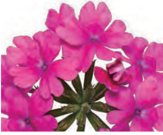
SUPERBENA® Pink Shades Verbena 'USBENAL20' USPP14876 Can1829