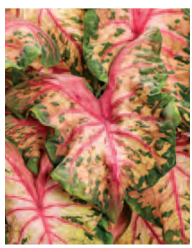
HEART TO HEART® 'Clowning Around' Caladium hortulanum USPP32252