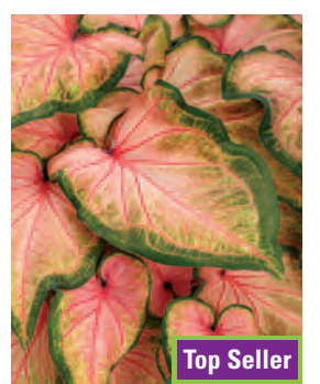
HEART TO HEART® 'Chinook' Caladium hortulanum USPP27094