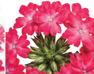
SUPERBENA ROYALE® Iced Cherry Verbena 'INVEBROICH' USPP23218 Can4587