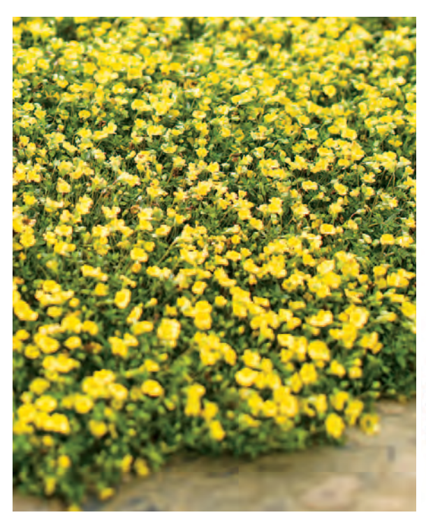
GOLDDUST® Mecardonia 'USmeca8205' USPP22871 Can4383

58 Awards including: Excellent Rating, Disney Trials; Top Performer, University of Wisconsin; Gardener's Choice, University of Florida; Top Performer, The Oregon Garden; Top Performer, Cornell University