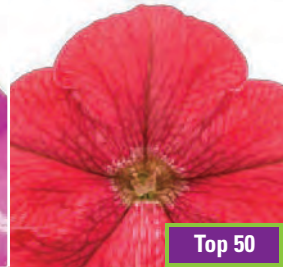
SUPERTUNIA® Really Red Petunia 'Sunremi' USPP16803 Can2838

SUPERTUNIA® RASPBERRY RUSH™ Petunia 'BBTUN91601M2' USPP32641 CanPBRAF