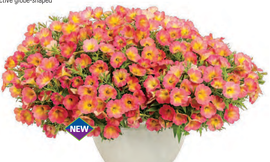
SUPERTUNIA® Persimmon Petunia *** USPPAF CamPBRAF 10-20cm (4-8")

Our very first yellow Mini Vista petunia, selected for its awesome vigor and flower power even through the Florida heat. Clear yellow flowers cover the attractive globe-shaped habit that makes a picture perfect Grande™ or Royale™ container for retail. New this year.