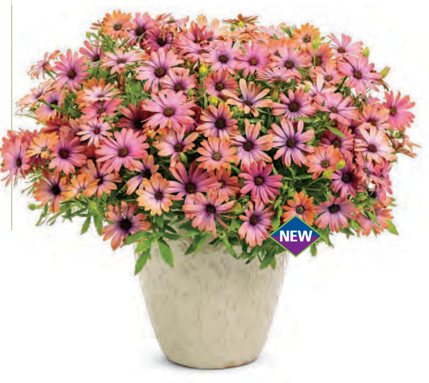
BRIGHT LIGHTS<sup>™</sup> HORIZON<sup>™</sup> Sunset Osteospermum <sup>***' USPPAF CanPBRAF</sup>

87 Awards including: Top Performer, Jardin Daniel A. Seguin; Top Performer, Penn State; Top Performer, University of Guelph; Top Performer, University Laval; Visitor's Choice, Missouri Botanic Garden