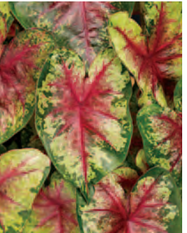
HEART TO HEART® 'Flatter Me' Caladium hortulanum USPP27946