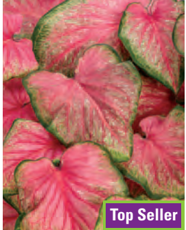
HEART TO HEART® 'Tickle Me Pink' Caladium hortulanum USPP31061