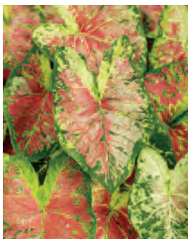
HEART TO HEART® 'Mesmerized' Caladium hortulanum USPP29545