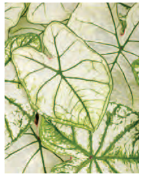
HEART TO HEART® 'Snow Drift' Caladium hortulanum USPP27072