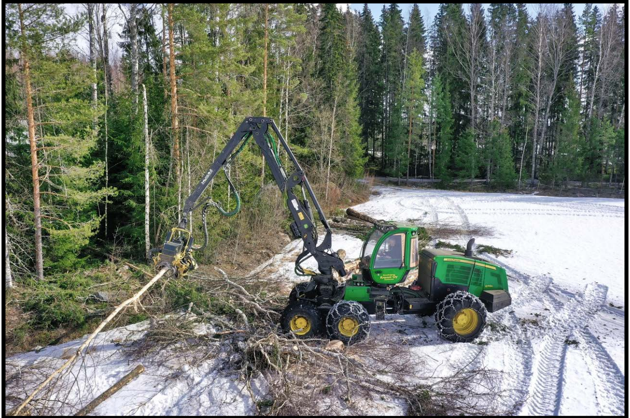
Figure 6. Image of timber harvesting.

conditions for a box turtle, in some cases affecting growth rates and thereby the ability of a population to recover (Dodd and Dreslik 2008; Heaton et al. 2022). Large-scale clearcuts (>5 ha) will result in more extreme thermal conditions (hotter in the summer and colder in the winter; Currylow et al. 2012), reducing available habitat during these times of the year, as well as increasing their vulnerability to predators while moving through these areas due to the lack of vegetative cover. The guidelines that follow are designed to outline measures that can reduce the risk of injury to turtles and increase the likelihood that a harvest will be compatible with box turtle conservation.