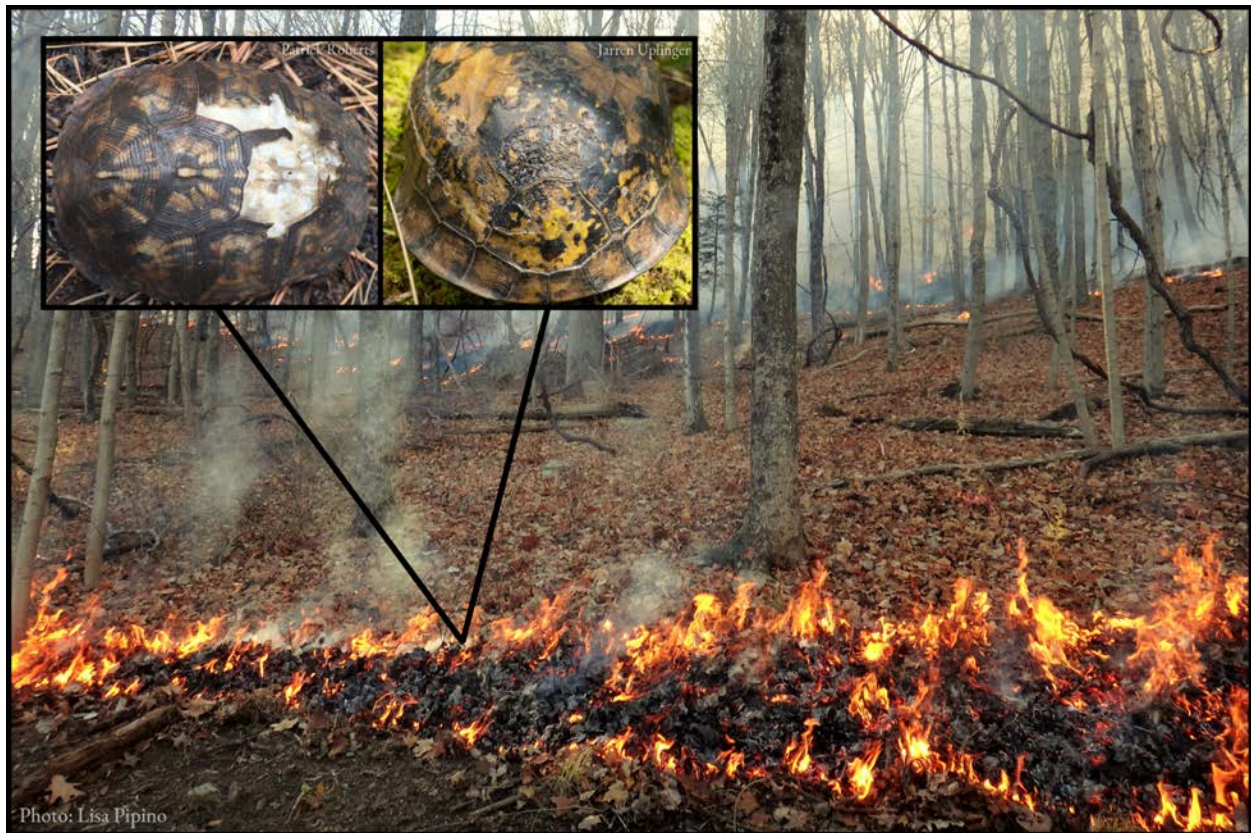
Figure 5. Active burn in overwintering forest habitat with example photos of burn scars and scute deformities on eastern box turtle carapaces from prescribed fires.

disease, cold, heat, and drought (Dodd 2001; Albery et al. 2021.) Land managers should use as many of the following practices as feasible to help reduce eastern box turtle mortality while using prescribed fire to achieve habitat management goals. These recommendations are ordered by their likelihood to reduce eastern box turtle mortality with the most effective measures listed first.