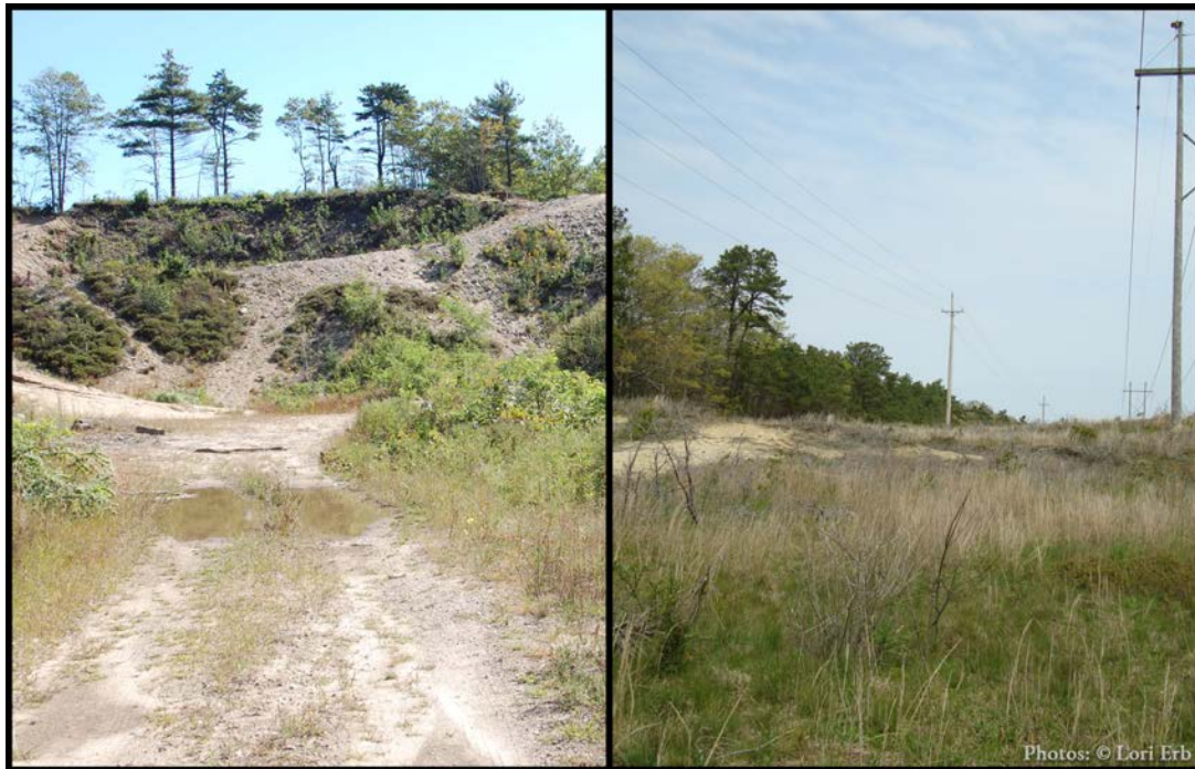
Figure 8. Sand-loam access road with mounds for nesting (left) Sand dominated powerline access with open canopy for nesting (right).