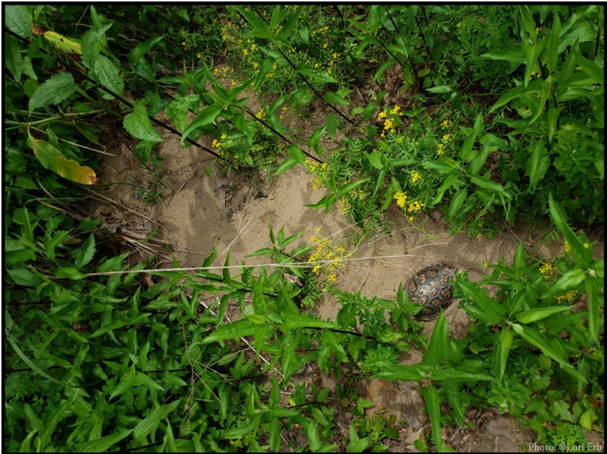
Figure 3. Eastern box turtle female actively nesting in sand.

In spring (late March through early May) they emerge from their hibernacula and move toward ecotone habitats such as forest-field edges where they can move in and out of the sun throughout the day to thermoregulate (Adams et al. 1989; Iglay et al. 2007; Fredericksen 2014). They utilize ecotones and early successional habitats through the late spring when females nest (Wilson and Ernst 2005; Willey and Sievert 2012; Nicholson et al. 2020). For nesting, female eastern box turtles in the Northeast mainly use open canopy, upland areas with well-drained, loose soils (Fig. 3 and 4, Quinn 2008; Willey 2010). Substrate materials vary and may consist of sand, loam, gravel or mulch. Nesting sites in the Northeast require sun exposure throughout the day, such as open canopy sites with a south-facing aspect, to incubate the eggs in time for hatching before winter arrives (Congello 1978; Willey 2010). Nest sites also need to be above the floodplain to avoid being periodically submerged in water, which will kill the eggs (Duchak and Burke 2022). Sparsely vegetated sites are preferred since plant roots can destroy eggs, infiltrating and absorbing the egg's nutrients (Steggman et al. 1988; Willey and Sievert 2012).