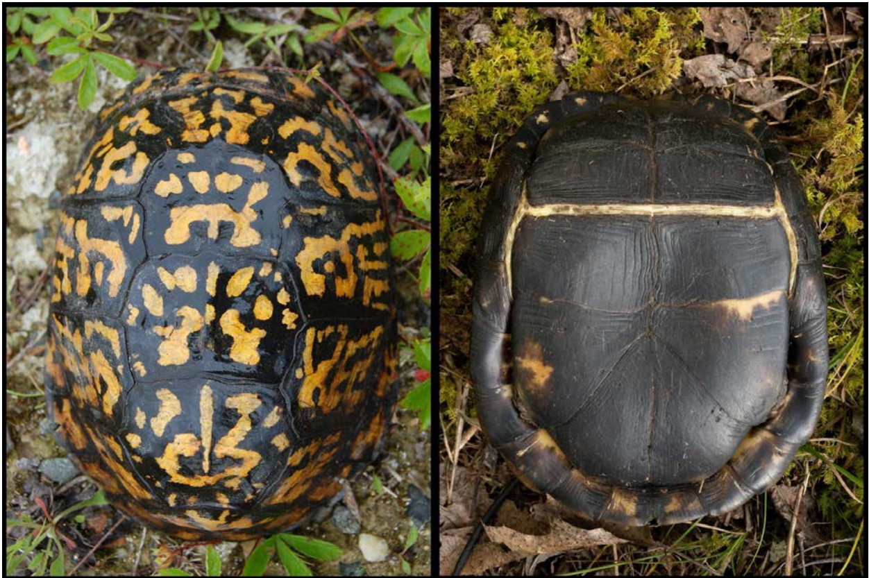
Figure 1. Eastern Box Turtle Carapace (Left). Eastern Box Turtle Plastron (Right)

The eastern box turtle ( Terrapene carolina ) in the northeast, also known as the woodland box turtle ( T. c. carolina ), is an at-risk subspecies that is experiencing population declines throughout most of its range (Fig. 1, Kiester and Willey 2015). They are a Species of Greatest Conservation Need (SGCN) in all the northeastern states and the District of Columbia, included in CITES Appendix II, and state-listed as Endangered, Threatened, or a Species of Special Concern in Connecticut, Maine, Massachusetts, New Hampshire, and New York. They face many threats, including habitat alteration and fragmentation from development, roadway traffic and ATV use in natural areas, agricultural activities, incidental and illegal collection, habitat management activities (e.g., mowing, prescribed fires), inflated level of predation, disease, climate change and natural disturbances (e.g., floods and fires). Populations are particularly vulnerable to adult mortality and very slow to recover (potentially many decades) from decline due to low reproductive output and juvenile survival. The purpose of this document is to provide guidelines aimed at sustaining and promoting healthy populations by reducing the potential for management activities to lead to mortalities or injuries.