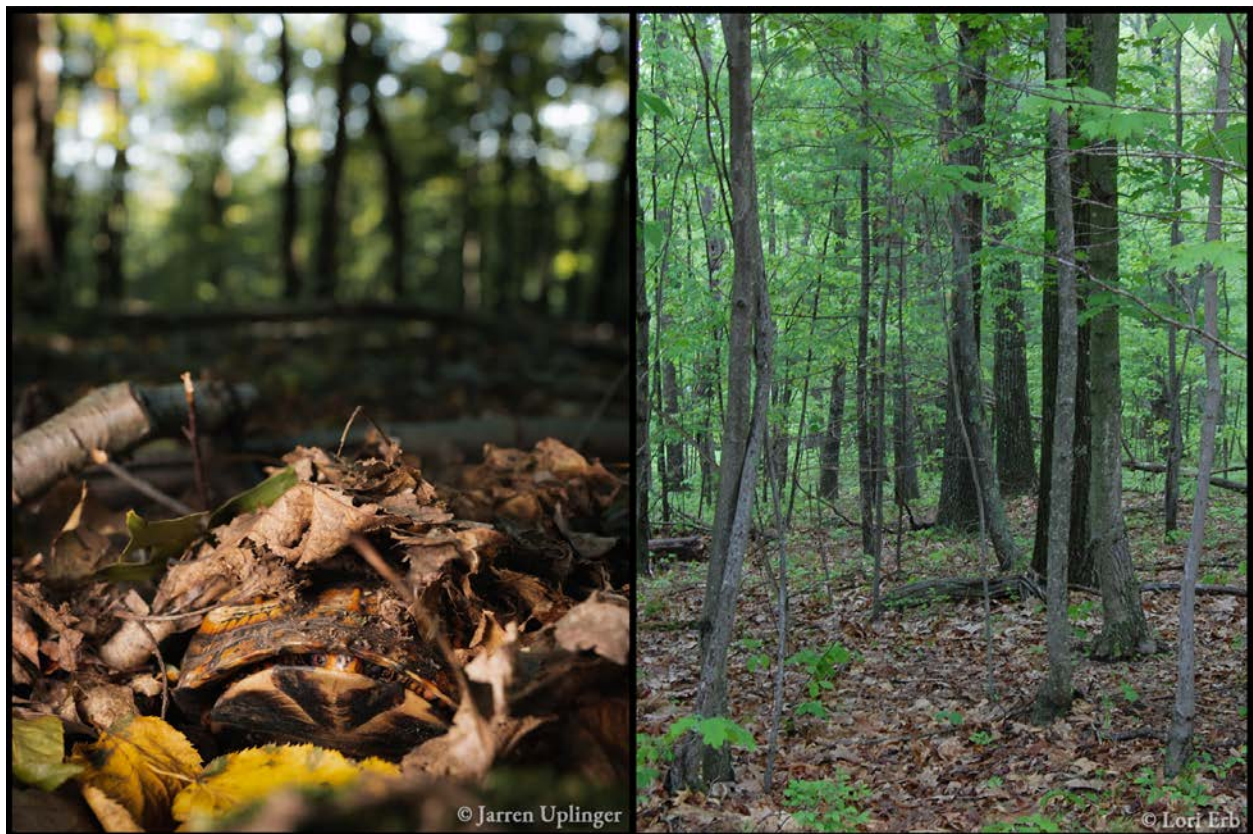
Figure 2. Eastern box turtle in partial form in preparation for brumation (left). Overwintering forest habitat example (right)

Generally, eastern box turtles in the northeast spend the winter underground in forested habitats (Table 1; Fig. 2 and 4). They typically overwinter in deciduous or mixed forests, with ample leaf litter duff, which provides insulation and supports the retention of moisture (e.g., Nazdrowicz et al. 2008; Savva et al. 2010; Willey 2010). In late fall and early winter, they have been found just below the soil surface, but may burrow deeper as temperatures drop later in the season (Savva et al. 2010; Woodley 2013; Boucher et al. 2017). Activity usually ceases by the first frost of the season (Ernst and Lovich 2009; Boucher et al. 2017), but they may resurface during warm periods, particularly in early winter and early spring.