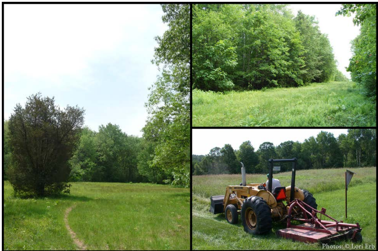
Figure 7. Examples of habitats mowed to control woody and invasive species.

The eastern box turtle depends on early-successional habitats (Fig. 7) such as fallow fields for thermoregulation, foraging, and nesting (e.g., Dodd 2001; Nazdrowicz et al. 2008). Maintenance of these habitats with use of mowing, herbicide treatment, and/or grazing can be important for long term persistence of the species. However, mower blades and tires can also cause mortality (Nazdrowicz et al. 2008; Tingley et al. 2009; Erb and Jones 2011). The following recommendations are provided to help minimize the risk to eastern box turtles while managing open canopy habitats. These measures are generally ordered with the most effective measures listed first.