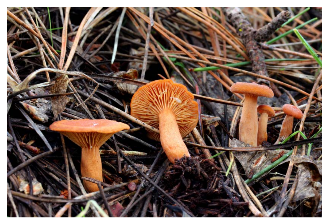
The candy cap, Lactarius rubidus, from coastal northern California. Caps are pale orange to orangebrown, dry to moist, latex thin, watery-white, scanty to absent, odor when fresh mildly pleasant, when dried or cooked strongly aromatic, like maple syrup or fenugreek.