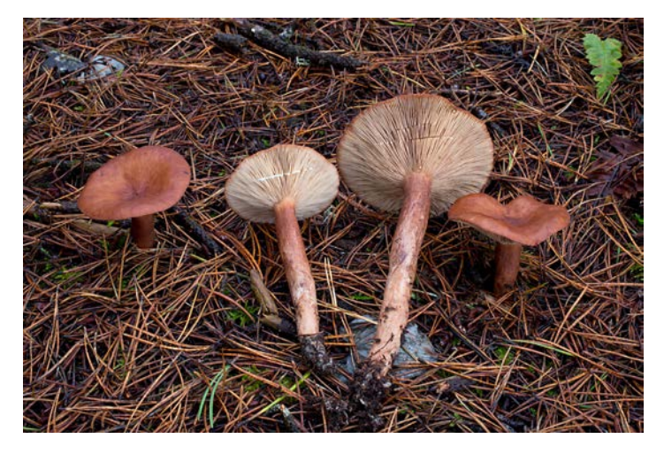
Lactarius rufus, named the Red Hot Milk Cap due to its acrid and peppery taste