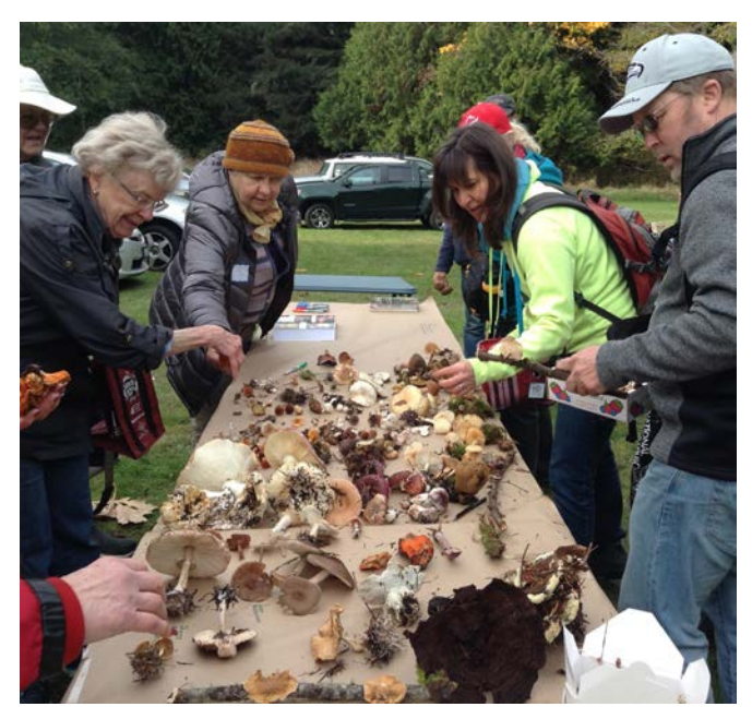
Last year's Lummi Island fall foray.