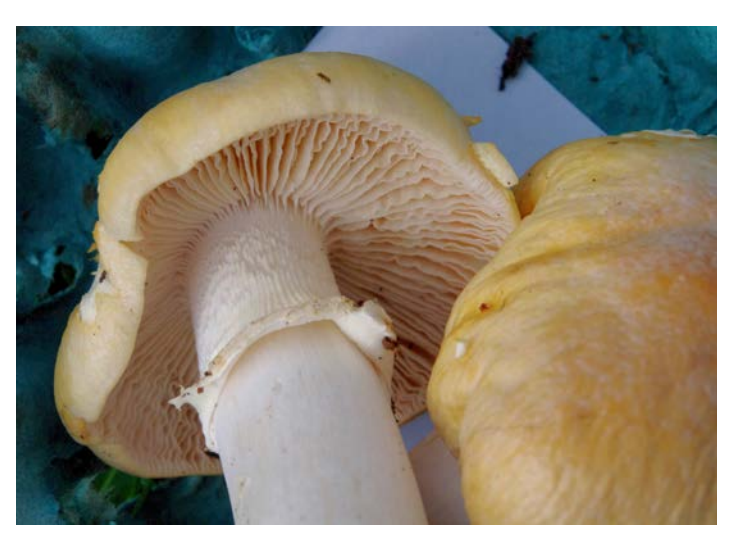
The gypsy mushroom, Cortinarius caperatus.

For membership questions, please email 360nmamembership@gmail.com