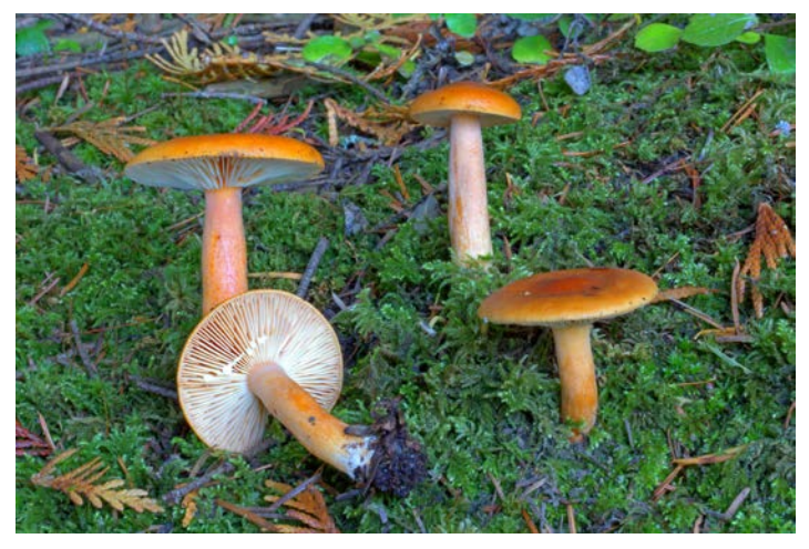
Lactarius luculentus var. laetis, the species identified in the 2008 Bellingham candy cap cold case

The common name candy cap has been generically used for a group of four pleasingly aromatic North American species of Lactarius . Two of these species, L. fragilis , and L. camphoratus , do not occur in western North America. L. fragilis is found in eastern and southeastern North America, while L. camphoratus is found in eastern North America as well as Europe and Asia.