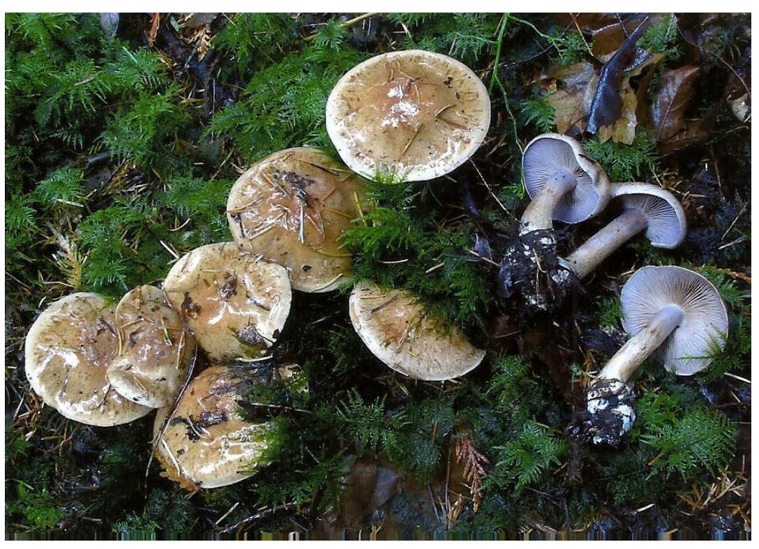
Cortinarius riederi.

It was a bit late in the afternoon of November 7, 2013, and numerous club members were about, all of us combing the Stimpson Family Nature Reserve for whatever late season treasures it might yield. It must have been a Friday following a speaking engagement for us all to be there together. There were fungi everywhere. I tried to line up what species I would photograph next, always aware I might skip over one by mistake. And then I spotted the cluster you see here, a cespitose cluster in moss and needle duff a bit to the left of the main trail as it