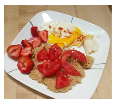
A simple breakfast, rice tempeh

[1] https://www.ncbi.nlm.nih.gov/pubmed/15740082