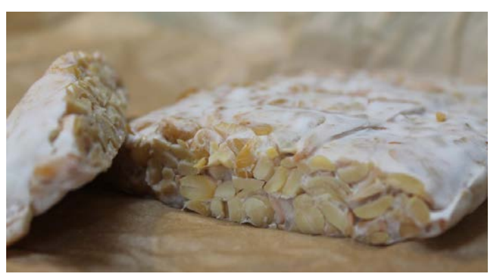
Freshly fermented tempeh.