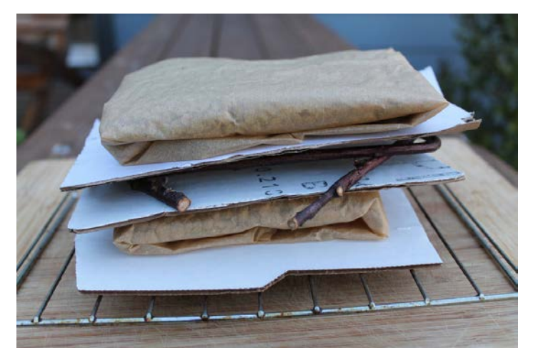
Soybeans wrapped in parchment and stacked, ready for the incubator

I have also had great success making tempeh out of other beans and grains like kidney beans, barley, and rice. These are all milder than soy tempeh and taste simply like mushroomy versions of their regular selves.