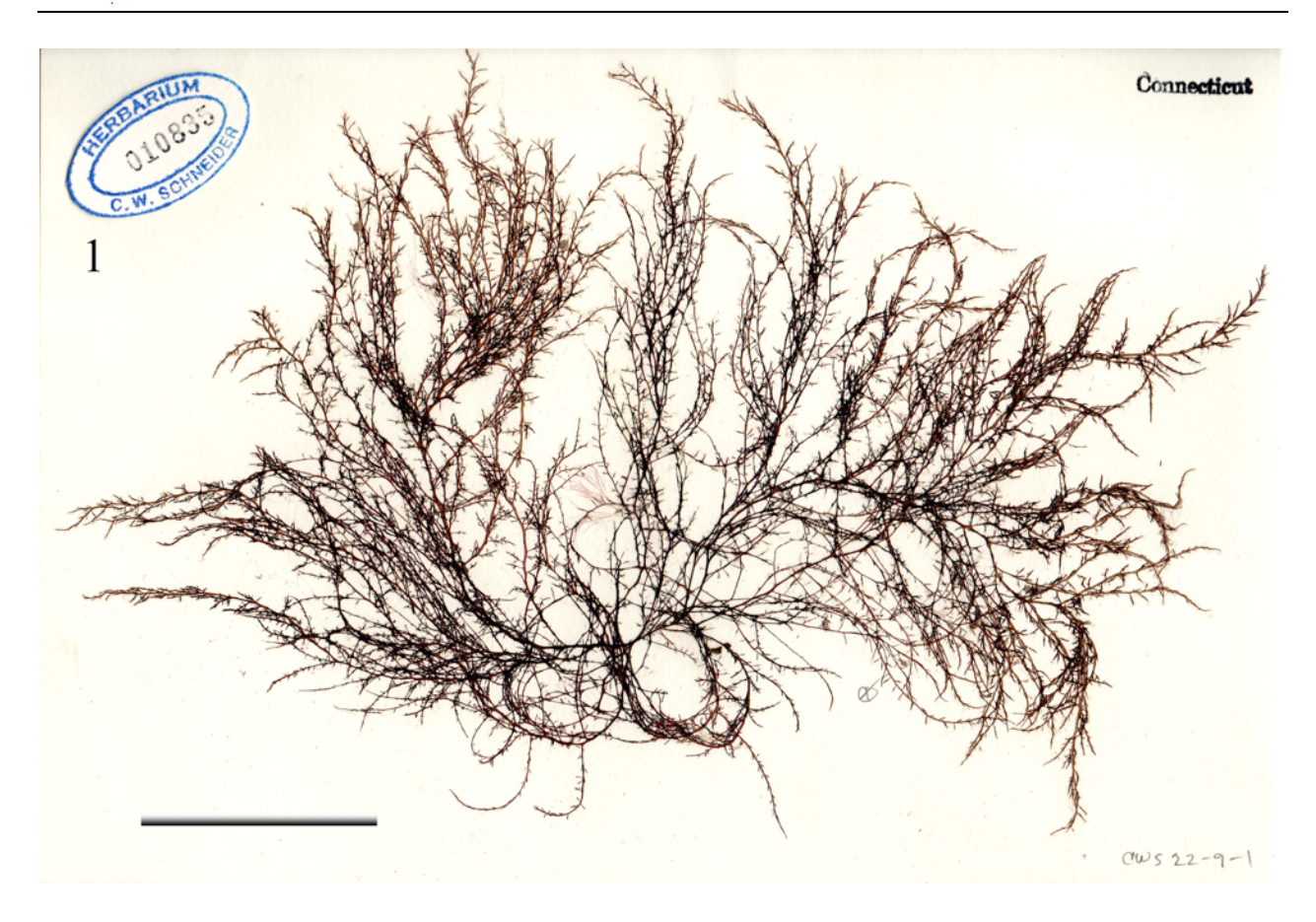
Fig. 1. Chondria atropurpurea Harvey. Tetrasporangial sample from an abundant recent Connecticut, USA, collection, coll. C.W. Schneider 22-9-1, tidal creek outflow of salt marsh wetland behind Pleasure Beach, Waterford, 2 July 2022 [Herb. C.W. Schneider 010835]. Scale bar = 5 cm.