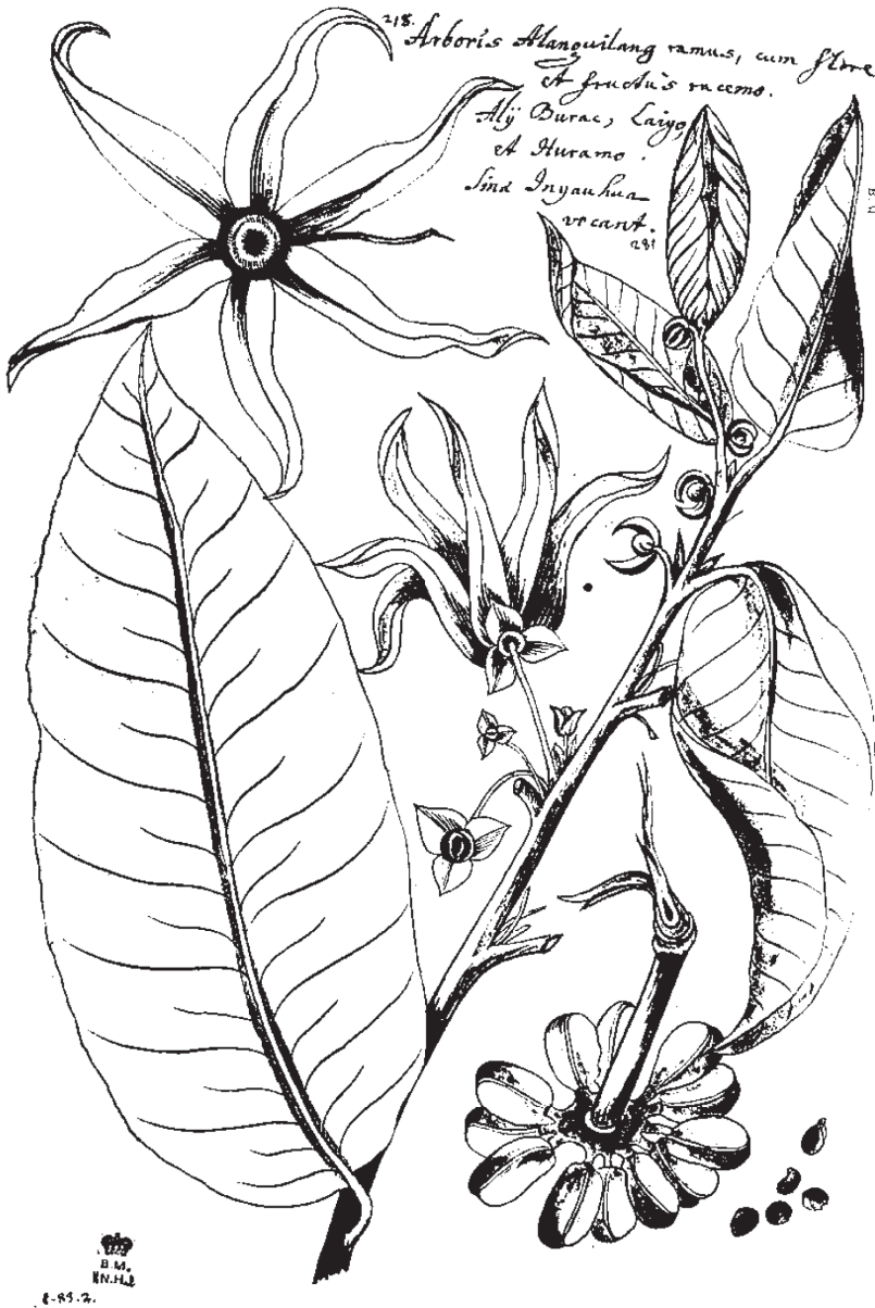
Figure 1. Drawing of alanguilan from G.J. Kamel's manuscript of Herbarium aliarumque stirpium in insulâ Luzon e Philippinarum © Natural History Museum, London.

for the name of a genus recognising Canangium odoratum (Lam.) Baill. ex King and describing a second species, Canangium scortechinii , which has subsequently been reduced to the synonymy (Corner, 1939) of Cananga odorata .