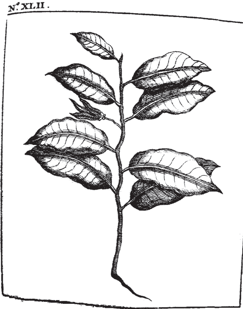
Figure 2. Drawing of a branch of the Cananga-boom from François Valentijn's Oud en Nieuw Oost-Indiën .