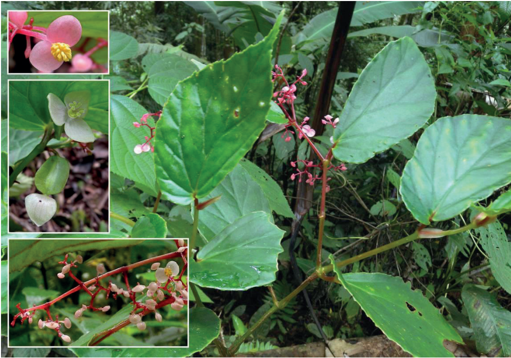
Fig. 4. Begonia racemosa Jack. Main image, habit; top left, male flower; middle left, female flower, all from DEDEN1509 , Bukit Menyan, Bengkulu. Bottom left, male portion of inflorescence, Gunung Kaba, Bengkulu.

Begonia caespitosa Jack [ § Reichenheimea ] Malayan Misc. 2(7): 8 (1822); Candolle, Prodr. 15(1): 397 (1864). Diploclinium caespitosa Miq., Fl. Ned. Ind. 1(1): 685 (1856). TYPE: Sumatra, Bengkulu, Jack (destroyed).