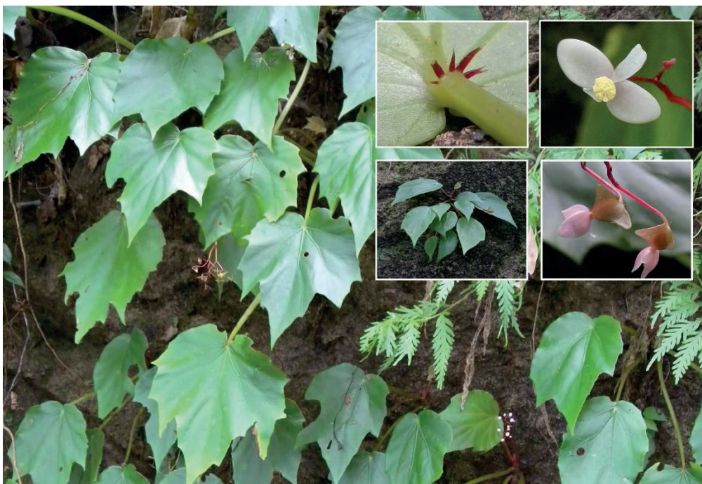
Fig. 5. Begonia sp. aff. sublobata Jack. Main image, habit; inset, top left, apex of petiole and leaf underside; top right, male flower; bottom right, female flowers and ovaries; bottom left, juvenile plant showing leaves with reduced lobing. All from DEDEN1486 , Pulau Pasumpahan, West Sumatra.

in every detail (Fig. 5). This is one of Jack's more lengthy and detailed descriptions, and every character seemed to tally perfectly; the lobed leaf shape, the cartilaginous serratures on the leaf margin, the semiverticil of scales at the petiole apex, the fleshy outer tepals on the male flower, each of which is diagnostic enough when considered singly. However, in the excitement of the moment of discovery, the authors failed to notice that the collection from Pulau Pasumpahan did not have leaves which were "finely punctate, the dots appearing elevated on the upper surface and depressed on the lower"; they were completely smooth. However by the time this was noted several days had passed and there was no time to visit Pulau Pegang to investigate further. Another species, as yet unnamed and manifestly allied to Begonia sublobata given the red scales at the petiole apex, was discovered nearby on the mainland at Batang Aia Manjuto. Hence it seems possible that the ancestor of Begonia sublobata has fragmented locally into a number of taxa, and that the islands in the bays south of Padang may harbour a number of endemic species. Consequently further work is required to resolve the true identity of Begonia sublobata .