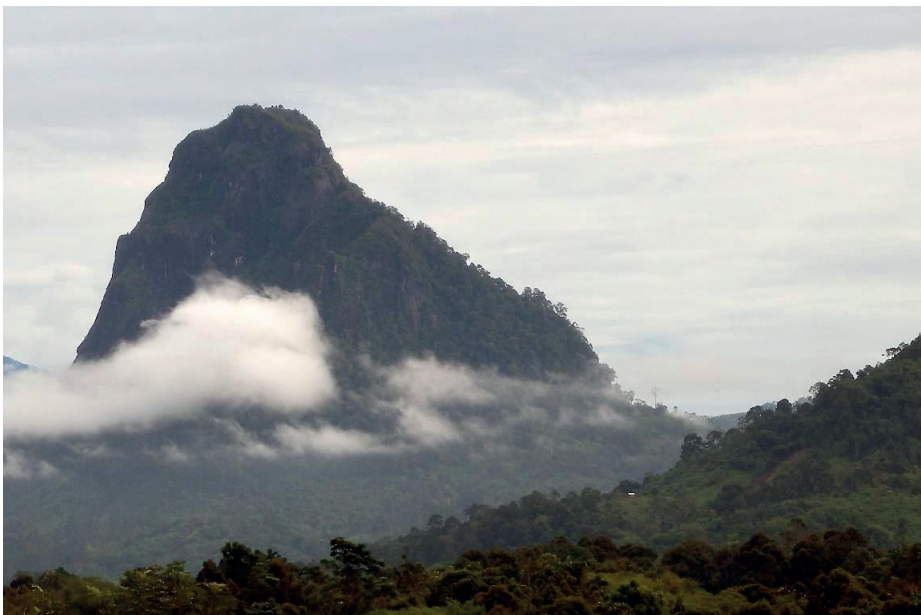
Fig. 2. The isolated peak of Gunung Bungkok, approximately 30 km northeast of Bengkulu town.