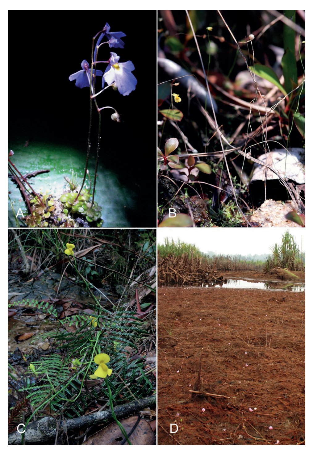
Fig. 1. Habit and habitat of four Utricularia species. A. Utricularia furcellata from the Gunung Ayam heath, Gunung Stong State Park. B. Utricularia scandens at Padang Batu, Gunung Mering, Gunung Ledang State Park. C. Utricularia involvens at Gunung Jerai Forest Reserve, Kedah. D. Utricularia punctata at the Tasik Bera RAMSAR site, Pahang.