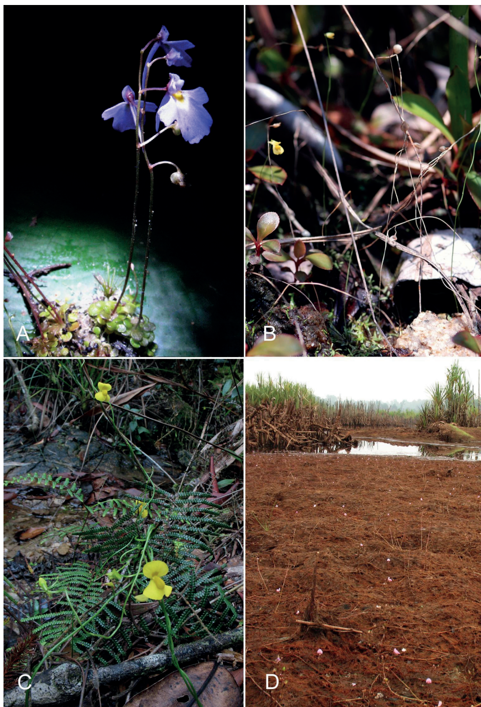
Fig. 1. Habit and habitat of four Utricularia species. A. Utricularia furcellata from the Gunung Ayam heath, Gunung Stong State Park. B. Utricularia scandens at Padang Batu, Gunung Mering, Gunung Ledang State Park. C. Utricularia involvens at Gunung Jerai Forest Reserve, Kedah. D. Utricularia punctata at the Tasik Bera RAMSAR site, Pahang.