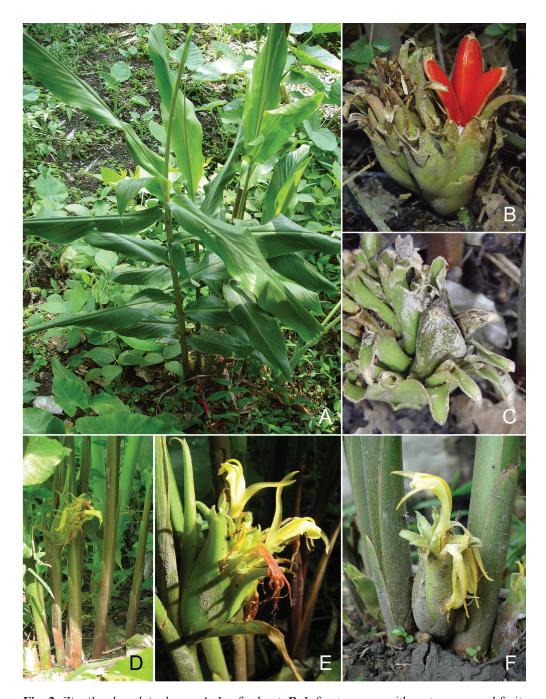
Fig. 2. Zingiber kangleipakense. A. Leafy shoot. B. Infructescence with mature, opened fruit. C. Infructescence with closed, not fully matured fruit. D–E. Inflorescence breaking through the leaf-sheaths of pseudostem. F. Inflorescence emerging from the rhizome at the ground level. Based on Kishor 9.