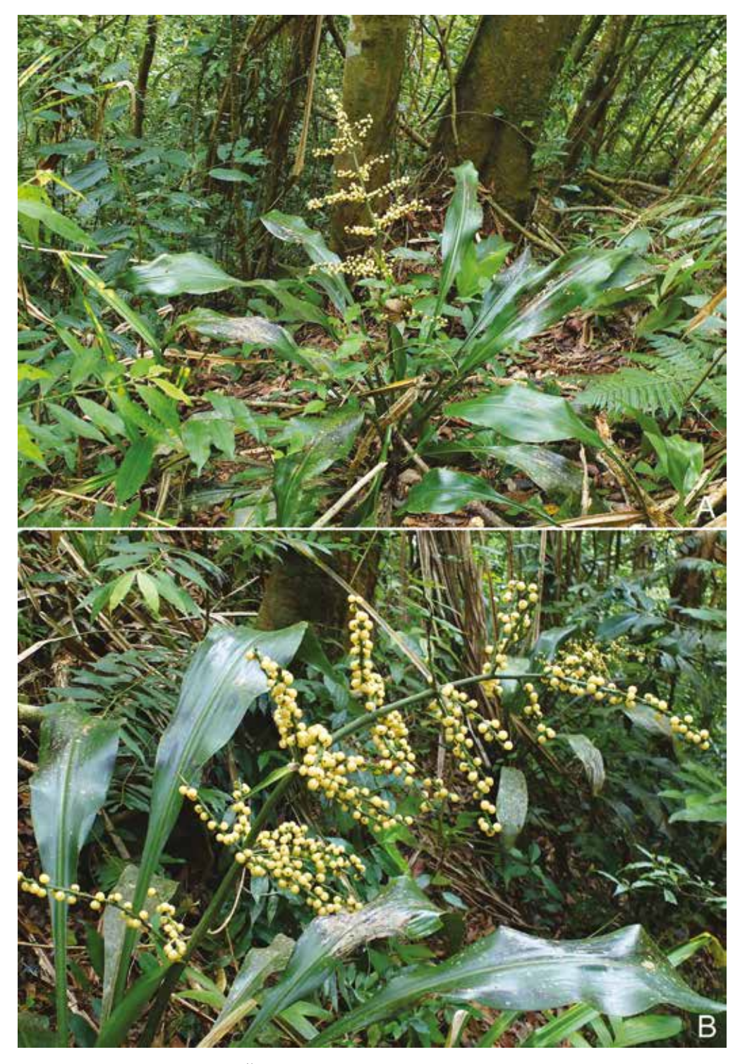
Fig. 1. Hanguana fraseriana Škorničk. & Kiew. A. Habit. B. Close-up of an infructescence. From type FRI89123 .