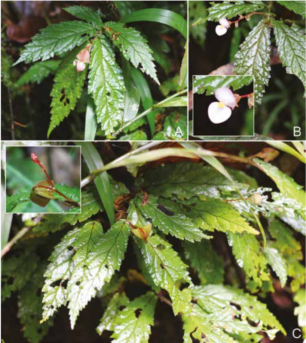
Fig. 1. Begonia aikrono H.P.Wilson & Jimbo. A. Habit and female flower. B. Male inflorescence and male flower (inset). C. Habit and ripening fruit (inset) on a recurved pedicel. A & C from LAE91288; B from LAE91289.

villose with short curled hairs c. 1 mm long, basal internodes c. 5 cm long, leafy stem internodes 1–2 cm long. Stipules deciduous, narrowly lanceolate, c. 7 × 3 mm, with a caudate tip c. 5 mm long, keeled, villose on the keel. Leaves petioles c. 5 mm long, hairs as on the stem; lamina lanceolate, (4–)6–11 × (2–)2.5–3 cm, slightly asymmetric, base oblique, basal lobe c. 7 mm long, adaxial surface mid green, veins darker and sunk into the lamina, lamina appearing glabrous at first glance but with sparse minute setae between the veins, abaxial surface puberulent on primary and secondary veins, glabrous between the veins, margin serrate-serrulate, teeth tipped with a short hair, apex