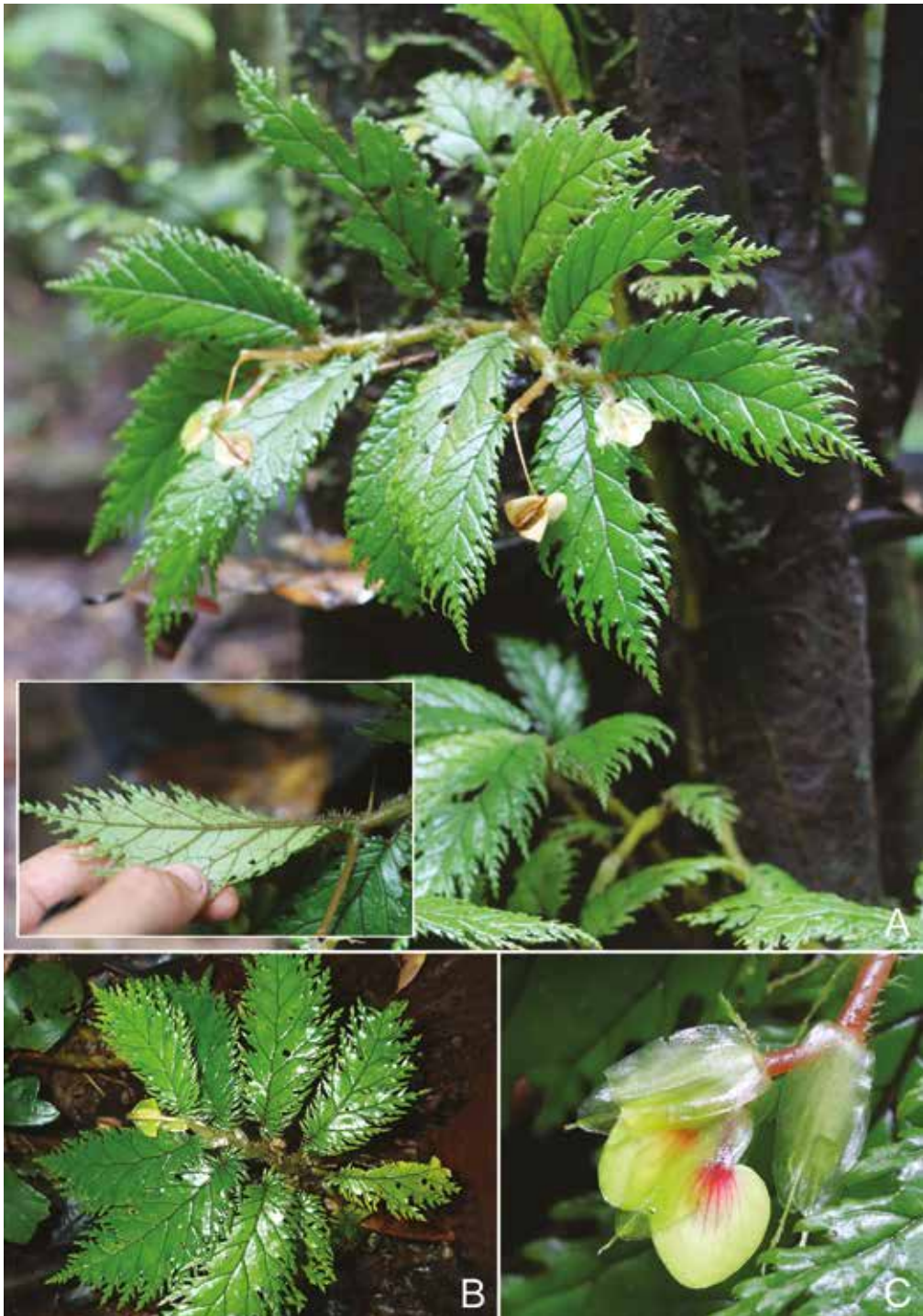
Fig. 3. Begonia fractalifolia H.P.Wilson & Jimbo. A. Epiphytic specimen, with inset showing hairs on stem and petioles. B. Terrestrial specimen, showing recurved fruit. C. Male inflorescence, showing caudate bracts. All from LAE91285.