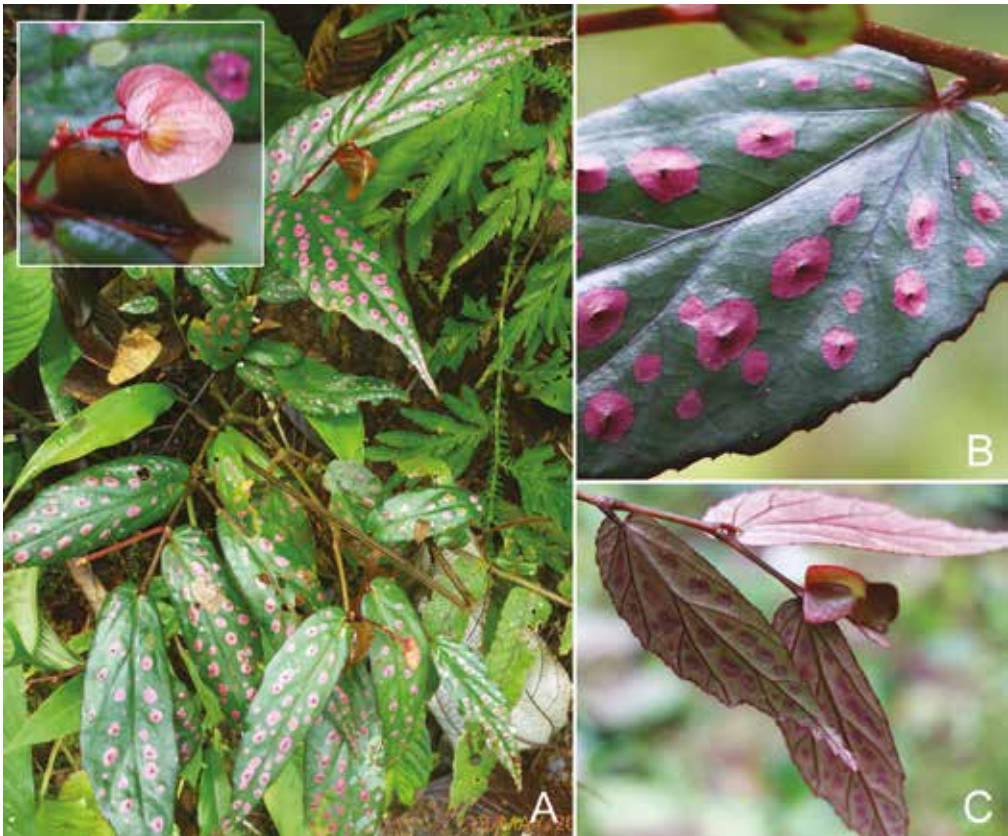
Fig. 4. Begonia sandaunensis H.P.Wilson & Jimbo. A. Habit (inset: male flower buds). B. Upper surface of leaf lamina showing dark pink bullae. C. Underside of leaf lamina and fruit on a stiff recurved pedicel. D. Male flower buds. All from LAE91157.

other than its occurrence at the type location; there is a wide variance in range size of Begonia species on New Guinea, and it is appropriate to wait for further information to better assess the level of threat.