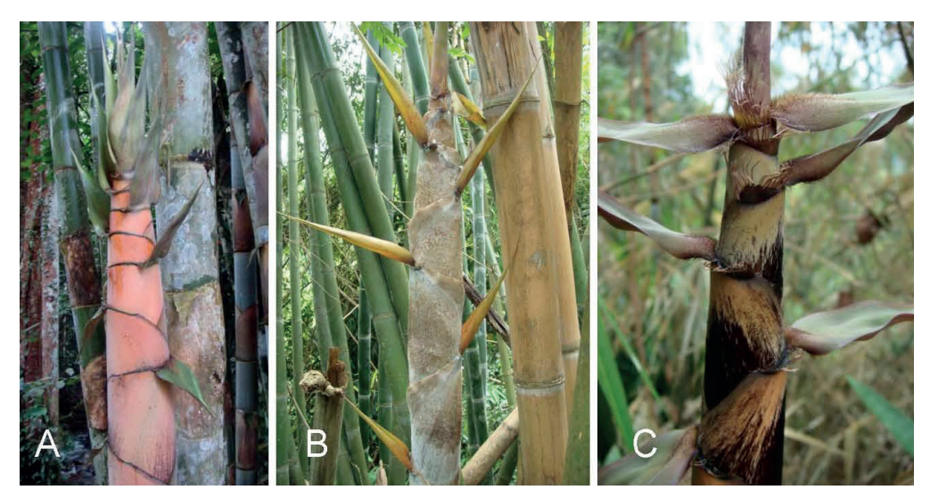
Fig 2. Culm shoots of the two parental species and their putative hybrid from clumps within the hybrid zone along the Gombak road, Selangor, Peninsular Malaysia. A. Gigantochloa scortechinii . B. Dendrocalamus pendulus . C. Putative hybrid.

The sequences of all clones were aligned. Three indel regions and a number of variable sites were observed in the DNA sequences of the clones. As some of the unique nucleotide substitutions could be possibly due to PCR or cloning errors, we designed two sets of internal primers specific for each GBSSI haplotype in order to obtain unambiguous DNA sequence for each allele. The location of haplotype-specific primers are shown in Fig. 3. Internal primers Gin336/1 (forward) and Gin336/2 (forward) were designed for the indel region, and Gin396/1 (reverse) and Gin396/2 (reverse) were designed for the region containing three variable sites. Primer sequences are shown in Table 2. PCR was performed using the following primer-pairs: (i) Gin–Gin396/1, (ii) Gin–Gin396/2, (iii) Gin336/1–GBSS, and (iv) Gin336/2–GBSS for each putative hybrid individual. Direct sequencing of purified PCR products was commercially done by FirstBase Laboratory Sdn. Bhd. (Malaysia). For each hybrid accession, sequences generated using the primer-pairs (i) and (ii) were merged as a haplotype, and those generated using the primer-pairs (ii) and (iv) were merged as another haplotype. All the sequences obtained were deposited in GenBank (Table 1).