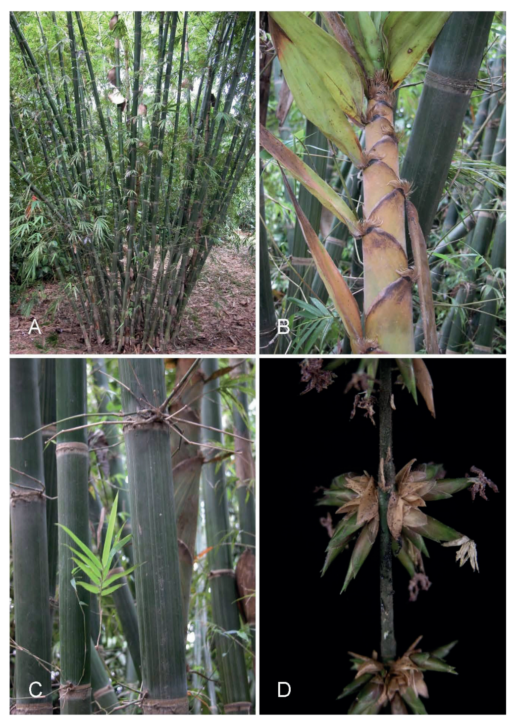
Fig 1. The putative hybrid Dendrocalamus pendulus \times Gigantochloa scortechinii . A. Clump habit. B. Culm shoot. C. Culm internode characteristics. D. Pseudospikelet cluster.