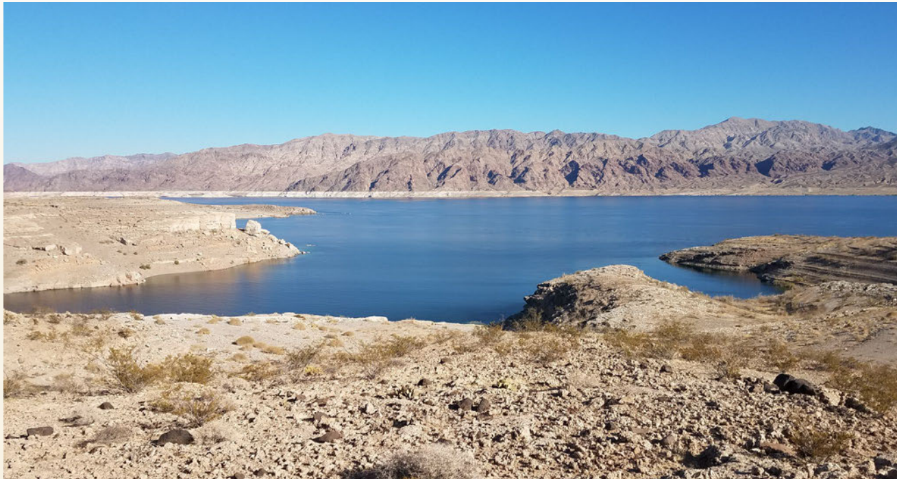
Lake Mead – Callville Bay Area