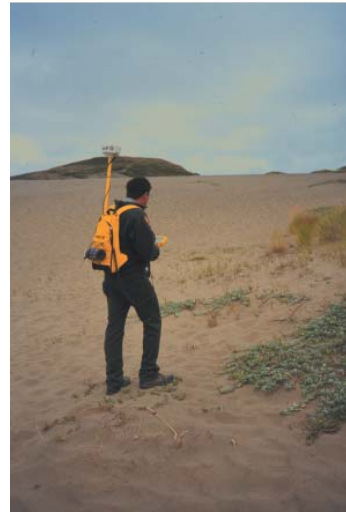
Park biologist using GPS (global positioning system) technology to map dune vegetation.

Point Reyes National Seashore is home to many endangered plants and animals, but few people realize that we have ecosystems that are also endangered. One of these disappearing ecosystems, coastal sand dunes, is represented here at Abbotts Lagoon. The large sand dunes near the lagoon are one of the last remaining places to see the plants and animals that once thrived in the shifting sand dunes of