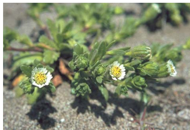
© Breiter Alfred Brousseau, St. Mary's College

The dunes around Abbotts Lagoon are home to many rare plants and animals. Tidestrom's lupine ( Lupinus tidestromii ) above and beach layia ( Layia carnosa ) right, are two endangered plants that live only in open dunes on the California coast. These and other native plants de-cline as European beachgrass and iceplant invade open areas.