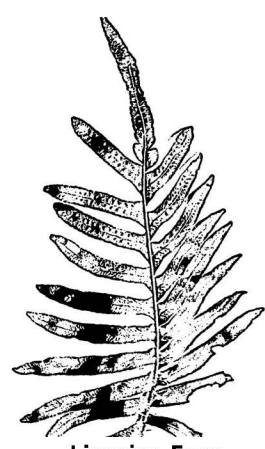
Licorice Fern Polypodium glycyrrhiza Often grows on big-leaf maples within park. Chewed rhizome has licorice taste.