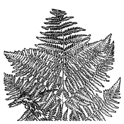
Bracken Fern Pteridium aquilinum var. pubescens Grows in large colonies in meadows. Triangular in outline. Most widely spread fern in world.