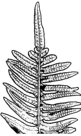
Leather Fern Polypodium scouleri Often grows as epiphyte on tree bark or in canopies. Fronds have thick, leathery texture.