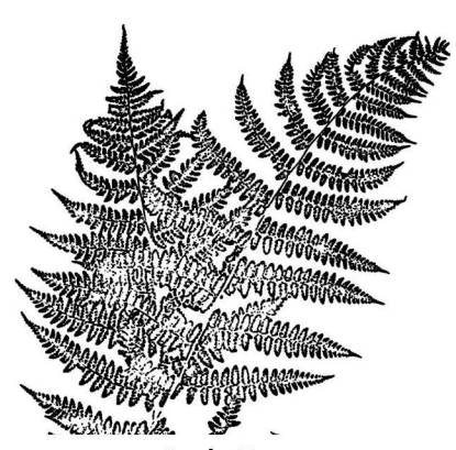
Lady Fern Athyrium filix-femina var. cyclosorum Very common fern in moist redwood forests. Often found near creeks. Delicate fronds taper at base to form a diamond outline.