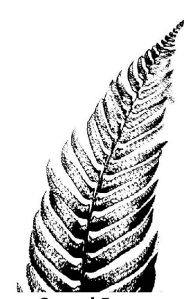
Sword Fern Polystichum munitum Dark green, tall, dry fern with pinnae that taper toward base to resemble hilt of sword.