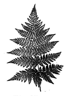
Wood Fern Dryopteris arguta Often found growing from stumps, or woody debris. Forms triangle at base unlike Lady Fern.