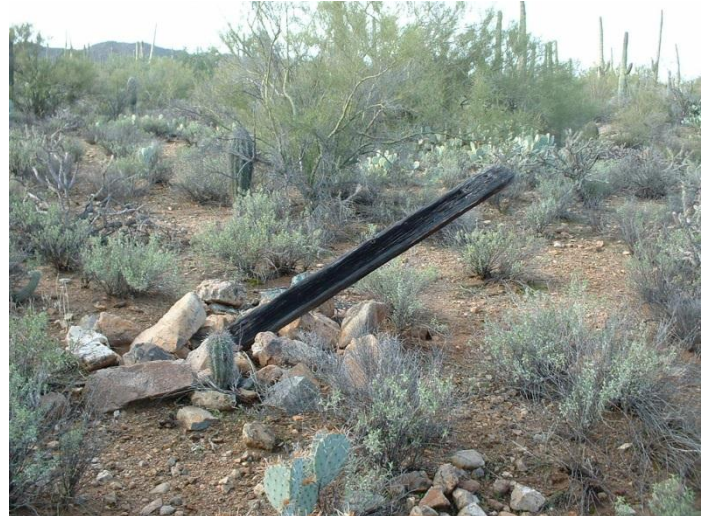
Mining claim monument: rock cairn with post.

Lode Claim. Deposits subject to lode claims include classic veins or lodes having well-defined boundaries. They also include other rock in-place bearing valuable minerals and may be broad zones of mineralized rock. Examples include quartz or other veins bearing gold or other metallic minerals and large volume but low-grade disseminated metallic deposits. Lode claims are usually described as parallelograms with the longer side lines parallel to the vein or lode. Descriptions are by metes and bounds surveys (giving length and direction of each boundary line). Federal statute limits their size to a maximum of 1,500 feet in length along the vein or lode. Their width is a maximum of 600 feet, 300 feet on either side of the centerline of the vein or lode. Wood posts or stone monuments are established along the boundary of