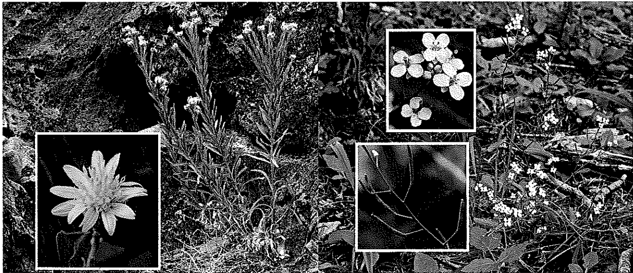
Solidago wrightii var. guadelupensis