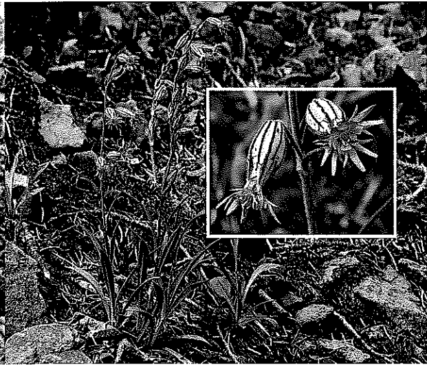
Silene scouleri var. grisea