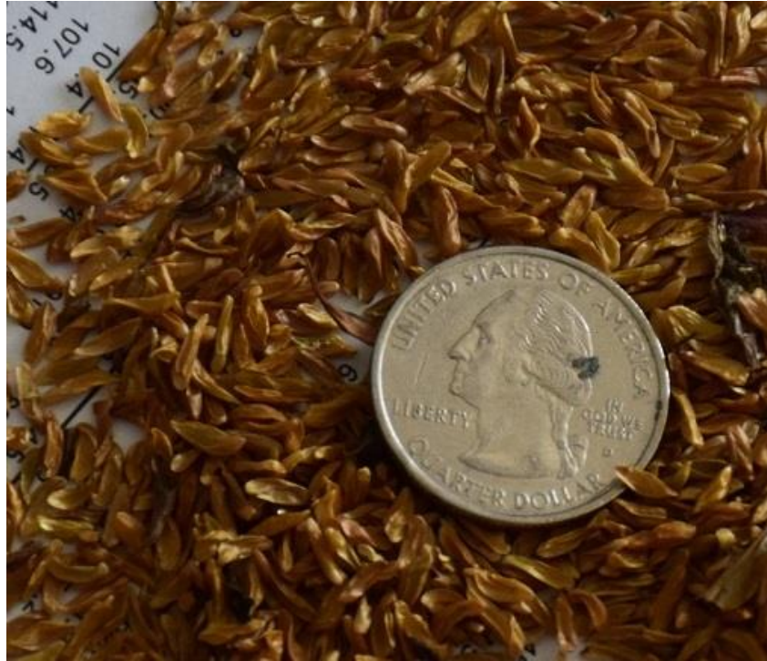
Figure 5. Seeds of Anticlea mogollonensis .

Ex-situ seed storage is an important conservation tool for rare plants with a narrow distribution like A. mogollonensis . Should additional natural disasters befall populations of this plant, or if new plants are unable to establish in highly altered habitats, it may be difficult if not impossible to reestablish the plant without direct seeding or transplant of container grown specimens. Additionally, given the showy appearance of the plant, it may find success in the nursery trade which would also support the continued survival of this species.