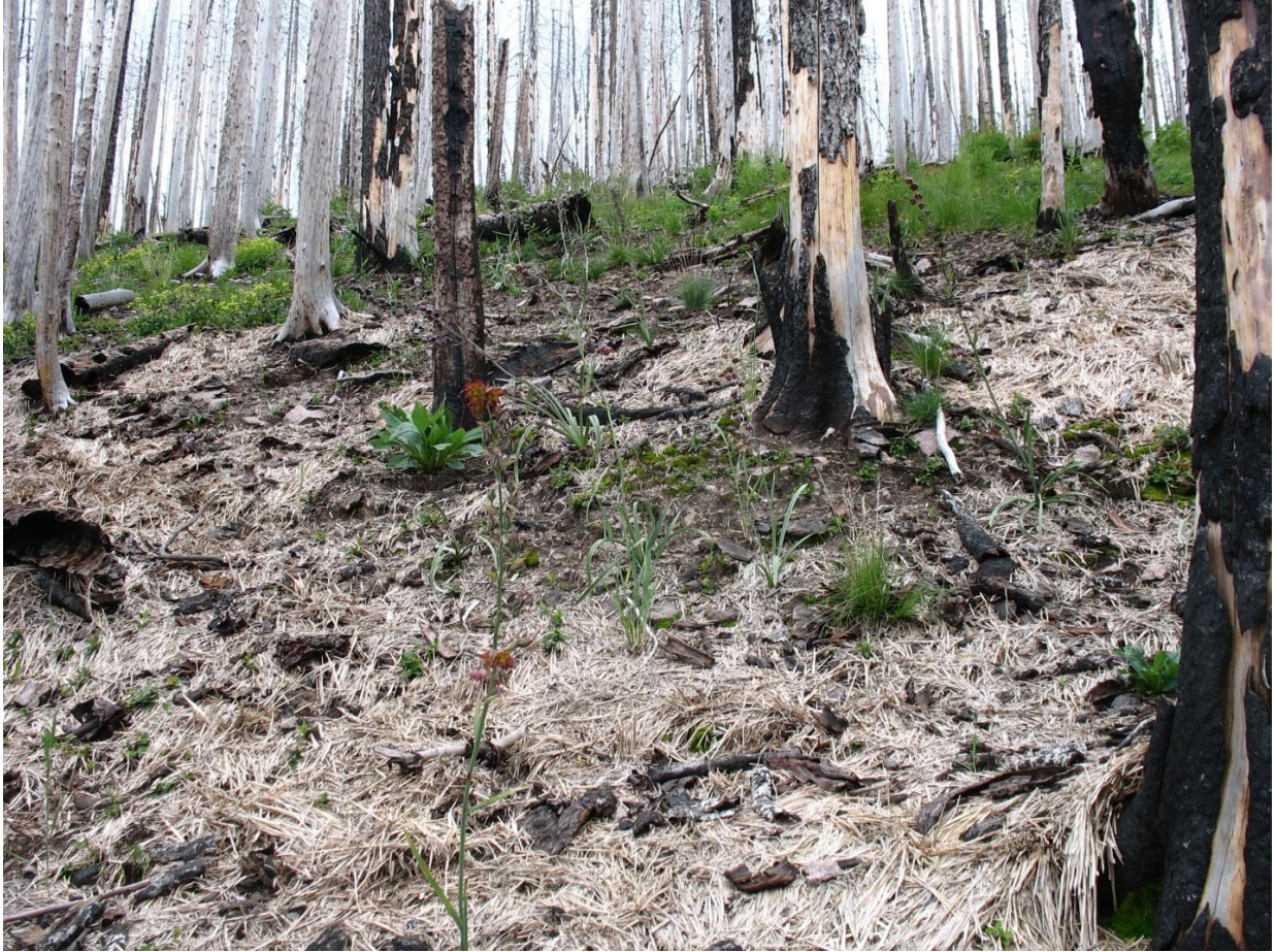
Figure 4. Thick mulch layer from post-fire treatments with A. mogollonensis .

While there is reason to be cautiously optimistic about how well A. mogollonensis has fared since the fire, it is important to remember that this is a species that has never been collected or observed in open habitats prior to the Whitewater-Baldy fire. While it appears to have been able to survive the direct effects of the fire and post-fire management, additional monitoring should be planned to make sure that plants in exposed, open habitats are able to maintain and expand their numbers as the years progress.