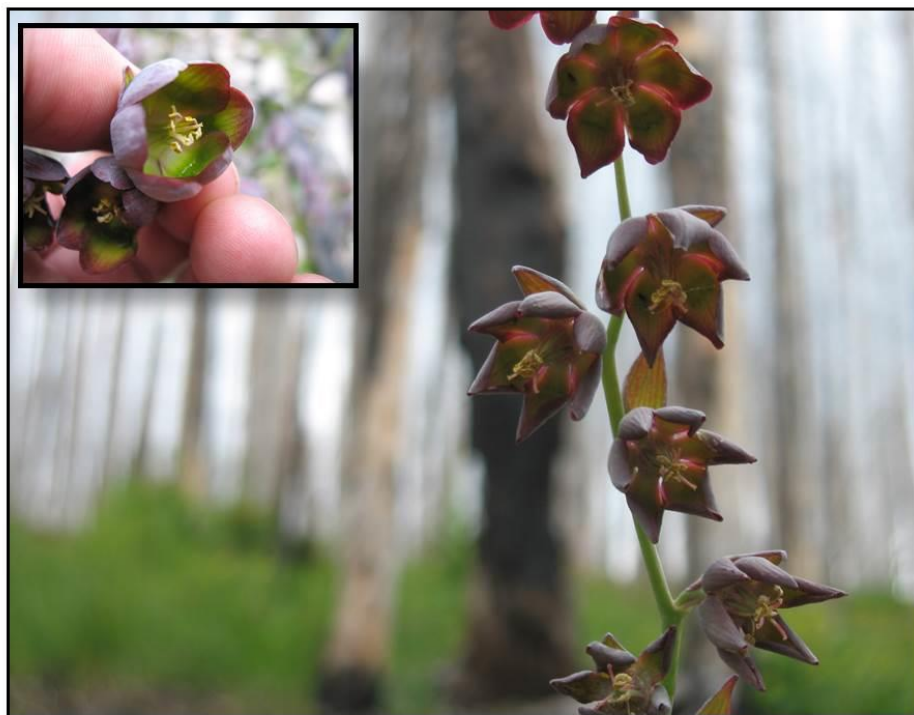
Figure 1. Close-up of Anticlea mogollonensis flowers and inflorescence.

Anticlea mogollonensis is a narrowly distributed species endemic to high elevations in the Mogollon mountain range in southwest New Mexico. It is a relatively newly discovered species, being first described in literature in 1995 (Hess and Sivinski 1995). The plant itself is stunning—up to 1 meter tall with nodding, campanulate flowers crowding the raceme. Flower color can be highly variable, from mostly green and tinged with red or purple, to almost entirely dark purple. Individual plants have between 10- 50 flowers and are gregarious amongst each other with specimens numbering in the hundreds on favorable sites. During the summer blooming period, the plant is unmistakable and very showy in its high elevation habitat.