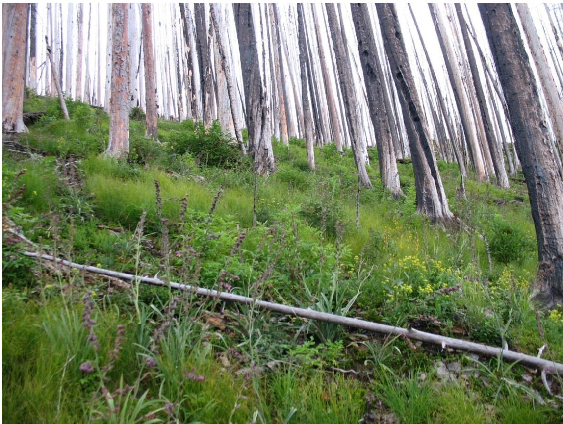
Figure 3. A. mogollonensis growing in severely burned area.

Anticlea mogollonensis exists in a narrow band of elevation from 9,500 ft. to 10,500 ft. Considering that the high point of the entire area is the summit of Whitewater Baldy at 10,895 ft., the plant is at the upper end of available habitat. Even within the Mogollon mountain range, the suitable habitat appears to be limited. The north slopes of Sacaton Mountain (10,658 ft.) and Grouse Mountain (10,135 ft.) may harbor some plants but were inaccessible for me this summer. Outside the Mogollon mountain range, only a few high elevation areas appear to have the potential for A. mogollonensis . Both Bear Wallow Mountain (9,953 ft.) and Eagle Peak (9,786 ft.) are high elevation summits north of the Mogollon range, but A. mogollonensis has not been collected at either location despite relatively easy access to both peaks. The core distribution of this species appears to radiate around Center Baldy (10,535 ft.) and the high ridges and slopes within a mile or two of this peak. It is here that one encounters not only the greatest number of sites, but also the greatest abundance of plants per sites as well. This area was severely burned during the Whitewater-Baldy fire of 2012.