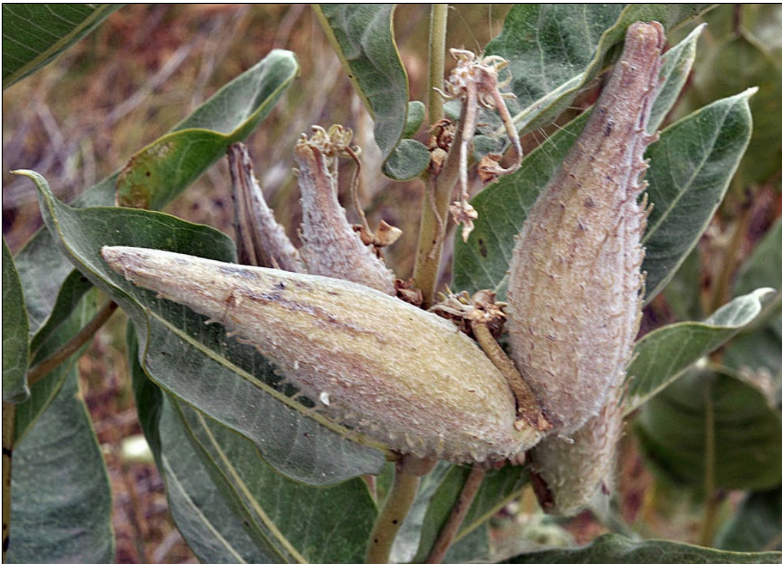
Showy milkweed ( Asclepias speciosa ) seed pods. Grant County, Washington. September 17, 2011.