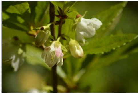
R. albiflorum.