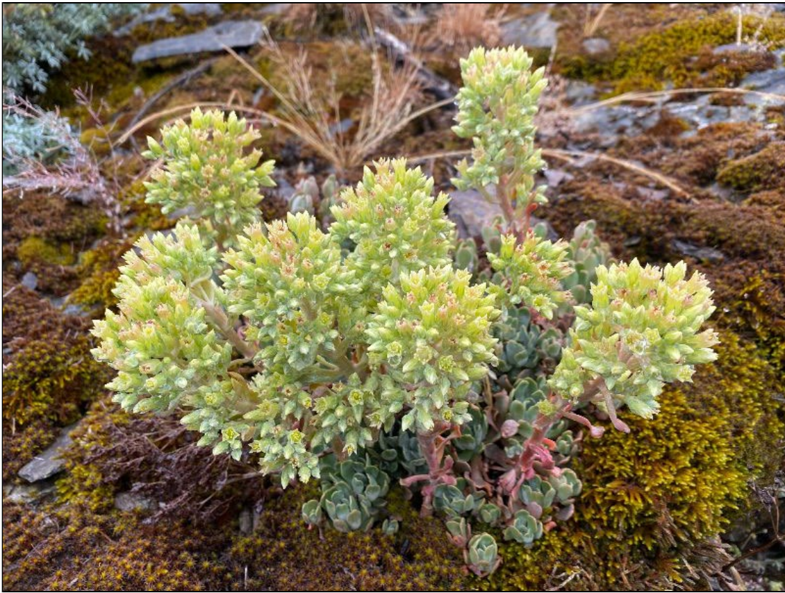
Oblong (Applegate) stonecrop ( Sedum oblancoelatum). Elliott Ridge. June 2022.

Although the biodiversity of the Siskiyou Crest region is globally significant, it is poorly documented in the academic literature. Located at the convergence of many spectacular ecosystems, this region contains many range extensions, disjunct populations, and endemic species found nowhere else on the face of the earth. Yet, the obscurity of the region, the rugged, often inaccessible terrain, and the general distance from both population centers and large academic institutions, have left portions of the region's biodiversity either undocumented, poorly documented, or underappreciated.