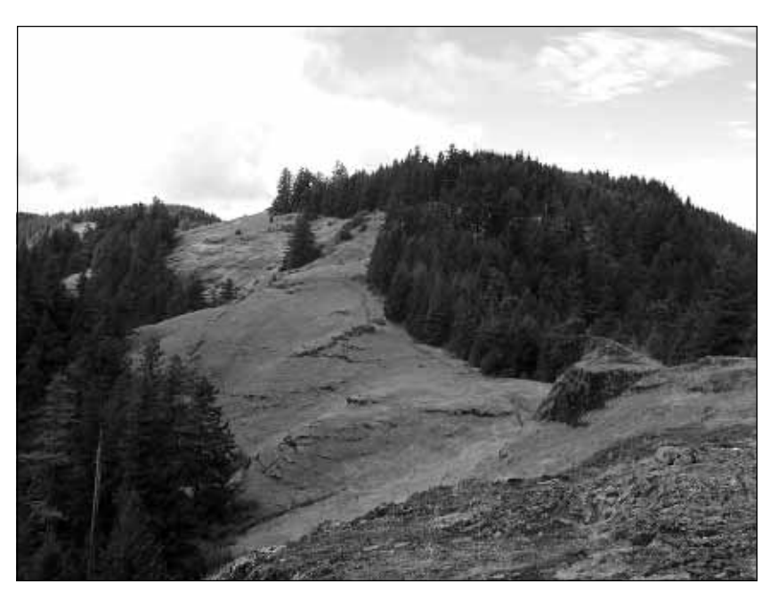
Meadows, rock outcrops, and forests form a mosaic in Horse Rock Ridge RNA.

The crustose lichen Lecidea dolodes that grows on the trunks of open grown Douglas fir is currently a BLM Tracking species, and on the Oregon Natural Heritage Program list 3.