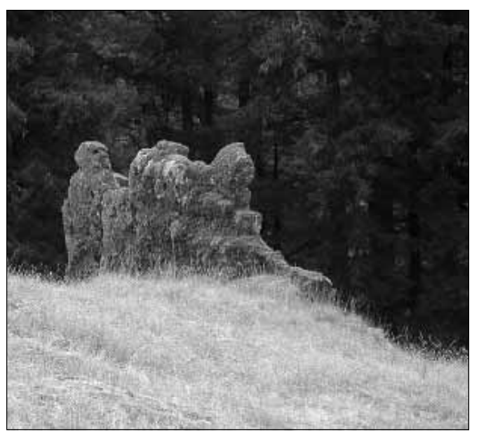
Abrupt changes in soil depth create a sharp edge between old growth forest and grass bald.

of wildflowers begins in late April and runs through mid-July. Notable wildflowers include deltoid balsamroot, eyelash flower, hyacinth brodiaea ( Triteleia hyacinthina ), Clarkia, Collinsia , Menzies' larkspur ( Delphinium menziesii ), dwarf mountain fleabane ( Erigeron compositus var. glabratus ), barestem buckwheat ( Eriogonum nudum ), Oregon sunshine ( Eriophyllum lanatum ), common blue cup ( Githopsis specularioides ), spring gold ( Lomatium utriculatum ), and dwarf lupine ( Lupinus lepidus ).