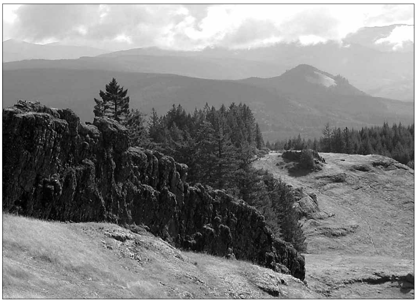
Fine-grained basaltic dikes resistant to weathering protrude from the surrounding terrain in Horse Rock Ridge RNA.