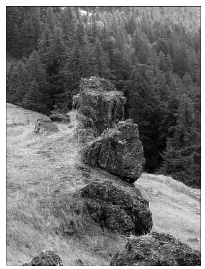
Erosion-resistant basalt dikes provide habitat for a variety of lichens, bryophytes, ferns, and native grasses. Photo by Cheshire Mayrsohn.

In the open areas, soils consist of rock outcrop and entisols, which are relatively young, poorly developed soils (i.e., lack well-defined diagnostic horizons). These entisols are shallow, generally 7 to 14 inches deep (up to 3 feet in partially forested areas), and contain a high proportion of gravel and cobble. In the forested area, most of the soils are in the Kinney Series (Curtis 2003). These soils derive from tuffaceous colluvium and consist of a 15-inch surface layer of cobbly loam over a subsoil of about 20 inches of cobbly clay loam. Depth to bedrock averages 4.5 feet.