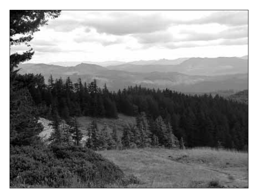
In the foreground, bristly manzanita ( Arctostaphylos columbiana ) softens the ecotone between forest and grassland; in the background, a view to the east of the Coburg Hills.

Four species located at the RNA are considered locally or regionally rare. Eyelash flower and common blue cup grow as widely scattered individuals in the meadows and rocky areas. These species are on the Lane County list C, meaning that they are of interest in Lane County for tracking or review purposes. (Although the RNA is in Linn County, it borders Lane County; hence the Lane County list was used to assess locally rare species). These two species are more common in eastern Oregon. The Lane County List of Rare and Endangered Vascular Plants, prepared by the Emerald Chapter of the Native Plant Society, indicates that these species are of limited occurrence in the county, and could be threatened by off road vehicle use. Eyelash flower is a small annual (to 16 inches) in the Asteraceae, with white flowers to ¾ inch