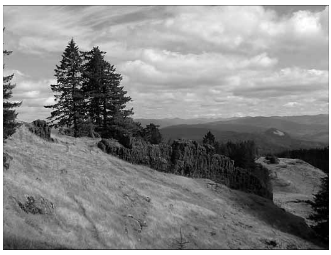
A hiking trail follows the prominent ridge that runs northwest-southeast across the RNA.

As mentioned previously, evidence of harvest activities are visible in portions of the RNA that were clearcut and replanted between 1960 and 1982. A trail created by hikers along the ridge receives occasional use. The RNA has been the destination for botany field