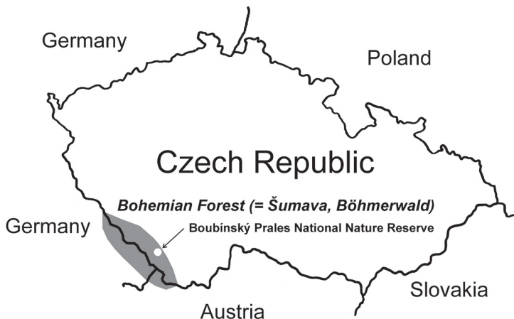
Fig. 1. Geographic position of the Boubínský Prales National Nature Reserve within the Bohemian Forest.