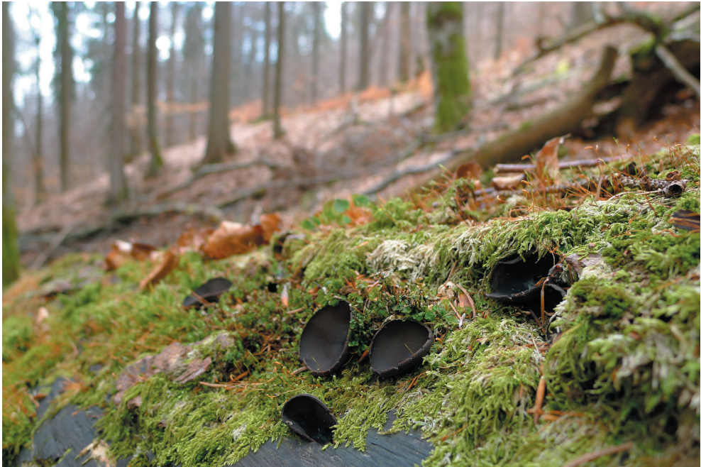
Fig. 4. Fruitbodies of Pseudopeziza melaena on upper side of fallen trunk of Abies alba (microlocality 6). More than 30 fruitbodies were observed on this trunk.

In the years 1996–2006 the first author himself or his collaborators (Z. Pouzar, M. Tomšovský, M. Beran, F. Kotlaba, M. Svrček) visited 185 localities in the Czech part of the Bohemian Forest, rarely also in the its foothills (HOLEC 2007). Some of them were very promising as for the occurrence of P. melaena (natural forests with high number of fallen trunks of Abies , e.g. in the following localities: mounts of Zátoňská Hora, Spáleníště, Stožec – see VRŠKA et al. 2012, site called Debrník near Železná Ruda, etc.). However, the fungus was not found there. The localities differ from the Boubínský Prales National Nature Reserve by their area (small fragments of natural habitats surrounded by man-made forests or clearings), degree of naturalness (they mostly represent naturally regenerated forests replacing partially or completely cut down virgin forests) and smaller number of fallen trunks of conifers, especially Abies alba , but also Picea abies . The occurrence of P. melaena is not excluded in such habitats (BALDA 1998: Mt. Černý Les, one microlocality only) but is less probable. The rich occurrence of P. melaena in the Boubínský Prales virgin forest confirms the importance of