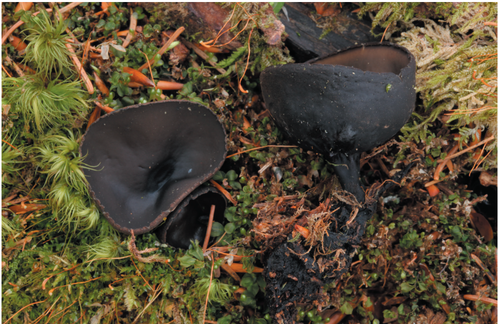
Fig. 3. Fruitbodies of Pseudoplectania melaena (microlocality 3). The side view (right fruitbody) shows that the apothecia are distinctly stalked.

During our visit (April 24–25), P. melaena was the most frequent fungal species (of fungi with soft fruitbodies). Generally speaking, it was the dominating fungus of the April fructification aspect in the Boubínský Prales virgin forest. These facts show that P. melaena , a very rare species in the Czech Republic (KOTLABA et al. 1995, HOLEC & BERAN 2006, HOLEC 2008a), is well established at this locality. Other potential sites within the Boubínský Prales National Nature Reserve (not visited by us in April 2013) are the eastern slopes of Mt. Pažeň south of the core (fenced) area of the reserve (1000–1100 m a.s.l.) and south-western slopes east of the core area (930–1100 m a.s.l.). They are grown by natural mixed forest with presence of fallen Abies trunks. Pseudoplectania melaena was not found in northern part of the core area which was caused by minor presence of Abies in local forest stands.