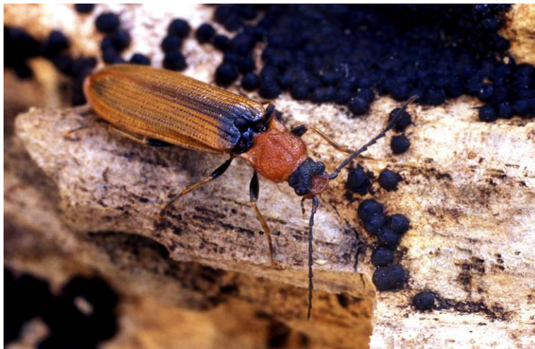
Figure 14: Denticollis linearis

Larvae develop under bark on dead wood and in decaying heartwood; broad-leaved trees and pine; omnivorous, feeding on live larvae as well as dead phloem tissues, etc. Also develops on moorlands, where larvae are active in the upper peat and moss layers. 'Very local' in Ireland (Johnson & Halbert, 1902) although more widespread than then appreciated once the larvae are recognised. H1, H2, H3, H9, H20, H25, H33, H34, H36, H38, H39, H40.