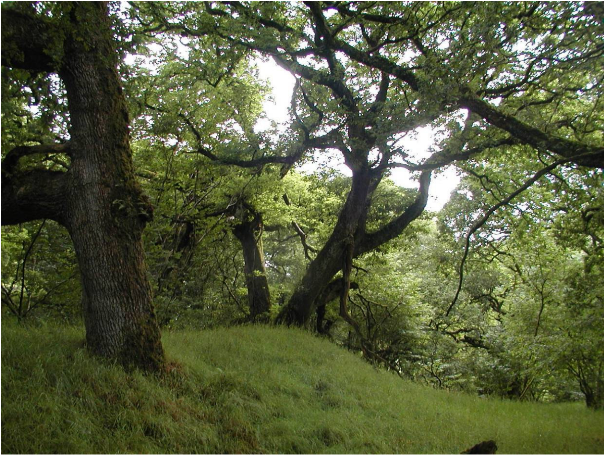
Figure 9: The Great Deer Park, Glenarm, Co. Antrim

The Great Deer Park, Glenarm, Co. Antrim – one of only two known sites for the fungus beetle Agathidium confusum . This site has a notably large extent of semi-natural ancient wood pasture and is an outstanding site in the context of Northern Ireland (Alexander et al. , 2007).