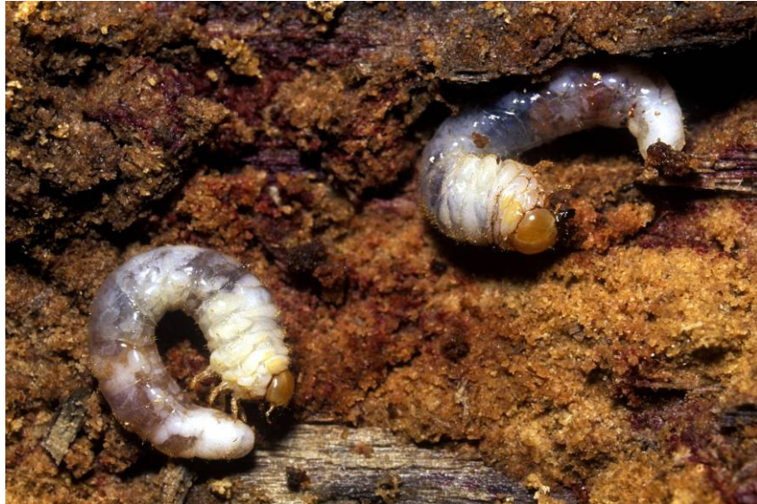
Figure 2: Larvae of Sinodendron cylindricum bore in decaying heartwood of broad-leaved trees