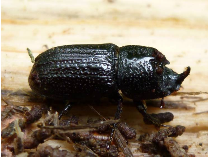
Figure 12: Sinodendron cylindricum © Keith Alexander

H39 Antrim: Portmore Lough, 8.x.2009, RA; Shane's Castle, 1.vii.2010, RA.