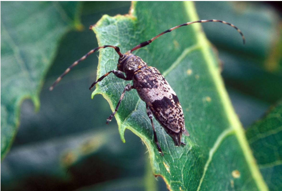
Figure 31: Leiopus nebulosus