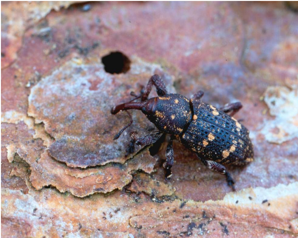
Figure 34: Pissodes pini

H33 Fermanagh: Ely Lodge Forest (H172522), larvae and adults at base of Scots pine, 22.iv.1997, SC (Clawson & Anderson, 2006).