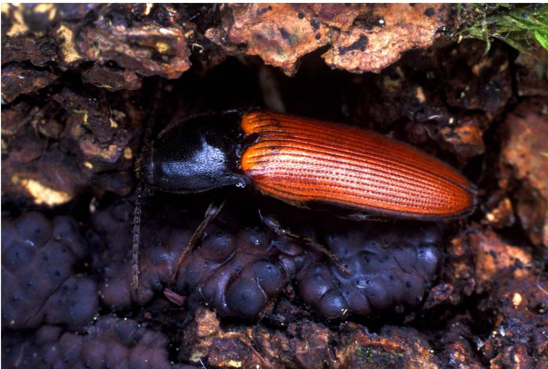
Figure 15: Ampedus pomorum

H40 Londonderry: Iniscarn Forest, Moyola Park, 17.v.1985, RA; Kennedy’s Quarry, Macosquin, 6.vi.1992, RA; Ballynahone More Bog, 28.v.2007, RA.