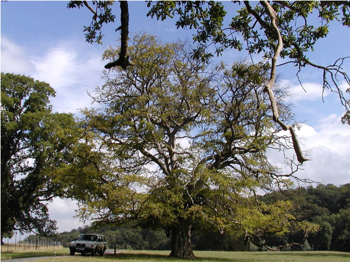
Figure 4: Caledon Deer Park, Co. Tyrone

About 50 species appear to have an association with ancient woodland and ancient wood pasture conditions (old growth species) – nearly 25% of the natives. This emphasises the great importance of these habitats for saproxylic beetles, and also provides an opportunity for developing conservation quality statistics for site evaluation and comparison.