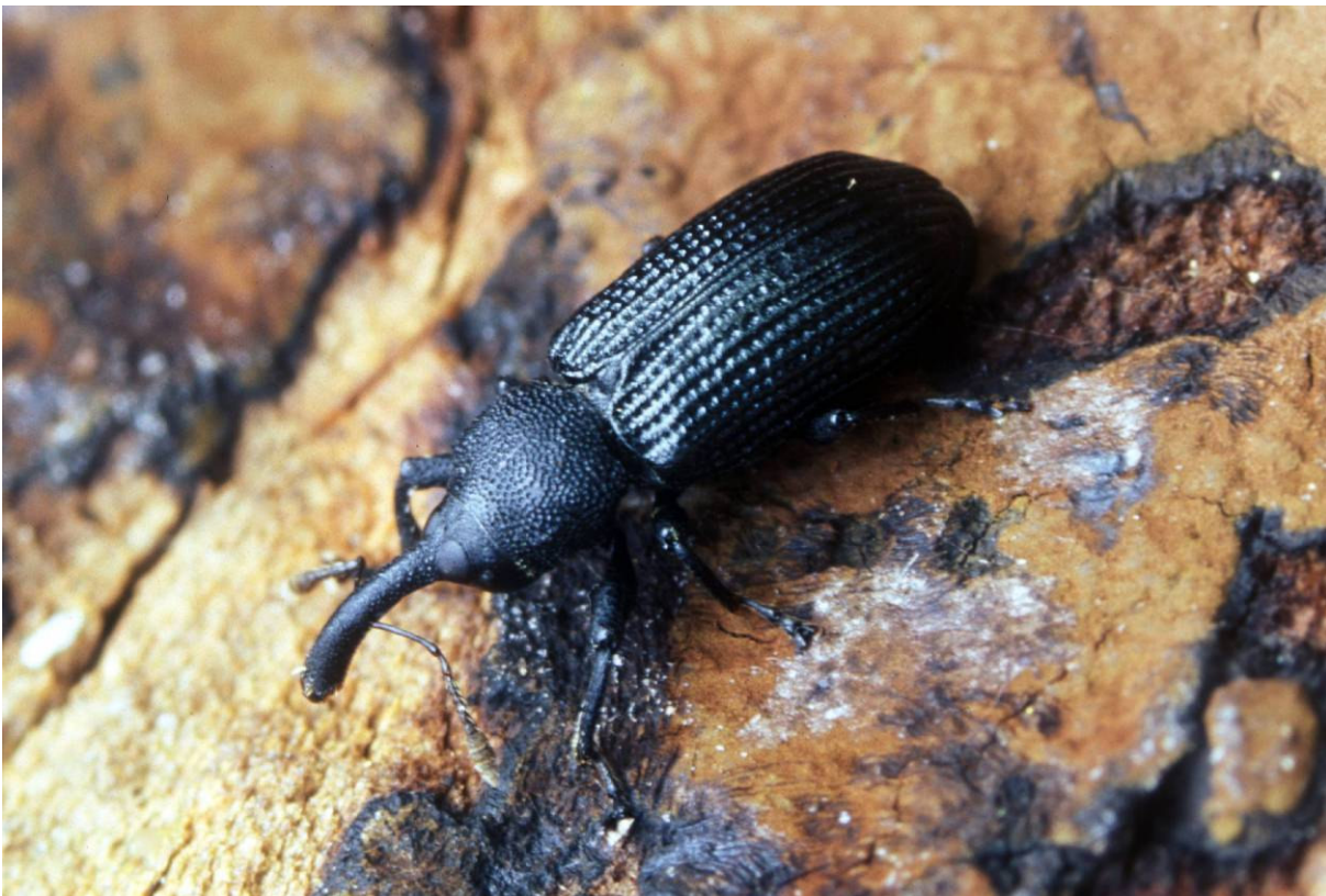
Figure 33: Magdalis carbonaria

H40 Londonderry: Banagher Glen (C672045), 8.vii.2007, KNAA.