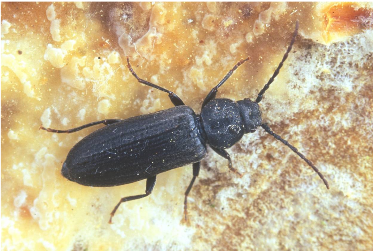
Figure 29: Asemum striatum

H40 Londonderry: Umbra NR (C724357), several emerging from Pinus contorta roots, 1.vi.2011, RA/MDB.