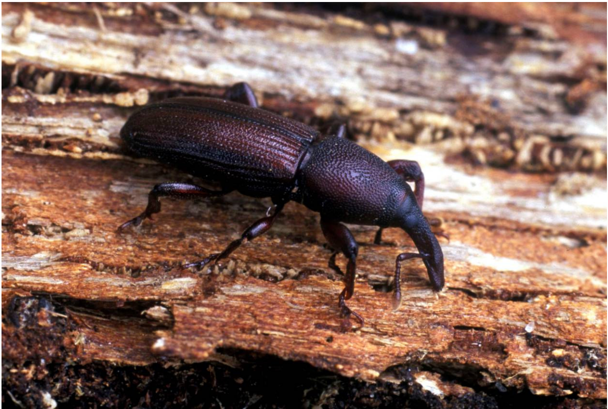
Figure 32: Rhopalomesites tardyi