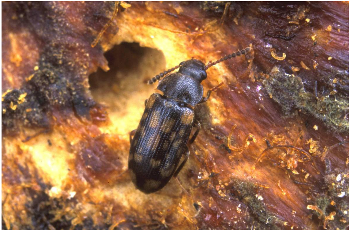
Figure 23: Mycetophagus multipunctatus