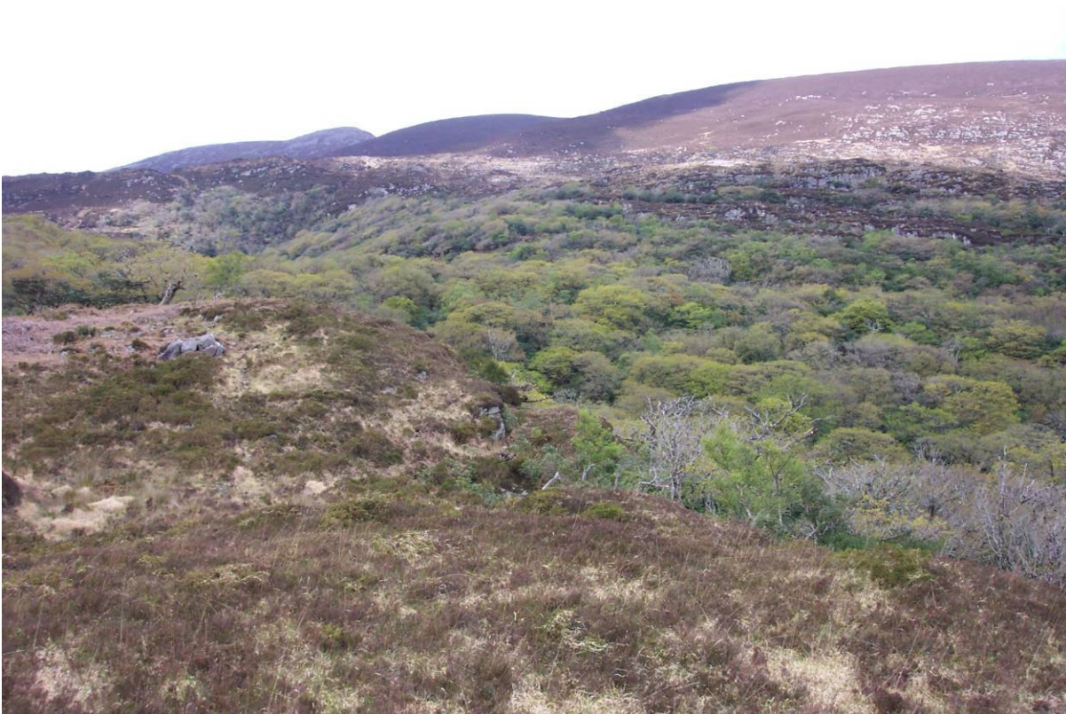
Figure 5: Glena Wood, Killarney National Park, Co.. Kerry

spotted Longhorn Beetle Anoplodera sexguttata (1859 & 1879); one of only two known sites for the Fire-winged Beetle Pyropterus nigroruber (discovered in 1866 & still there in 1989). The majority of the records stand merely as 'Killarney' making it impossible to allocate particular records to particular locations within the area. Derrycunihy and Tomies Woods are well-known to be good examples of the habitat, but equally the open parkland areas are also notably important for saproxylic beetles, especially Muckcross Park. The whole area forms a mosaic of ancient woodland, ancient wood pasture and historic parkland, which in turn forms the largest extent of veteran tree habitat anywhere in Ireland. Greater attention to its saproxylic beetle importance is needed as this will greatly inform site management for conservation objectives.