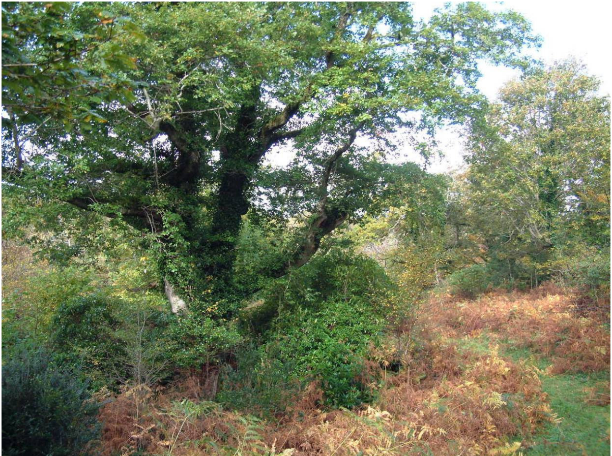
Figure 6: Glengarriff, Co. Cork

Only known Irish site for Mordellistena neuwaldeggiana (1924); one of only two known sites for the false click beetle Melasis buprestoides (1985); best Irish site for Hornet Longhorn Beetle Leptura aurulenta ; one of very few known sites for the ambrosia beetle Hylecoetus dermestoides . Glengarriff Castle Demesne is of especial note for its veteran oaks; it was here that the ambrosia beetle was found and this is also a good area for the longhorn beetle.