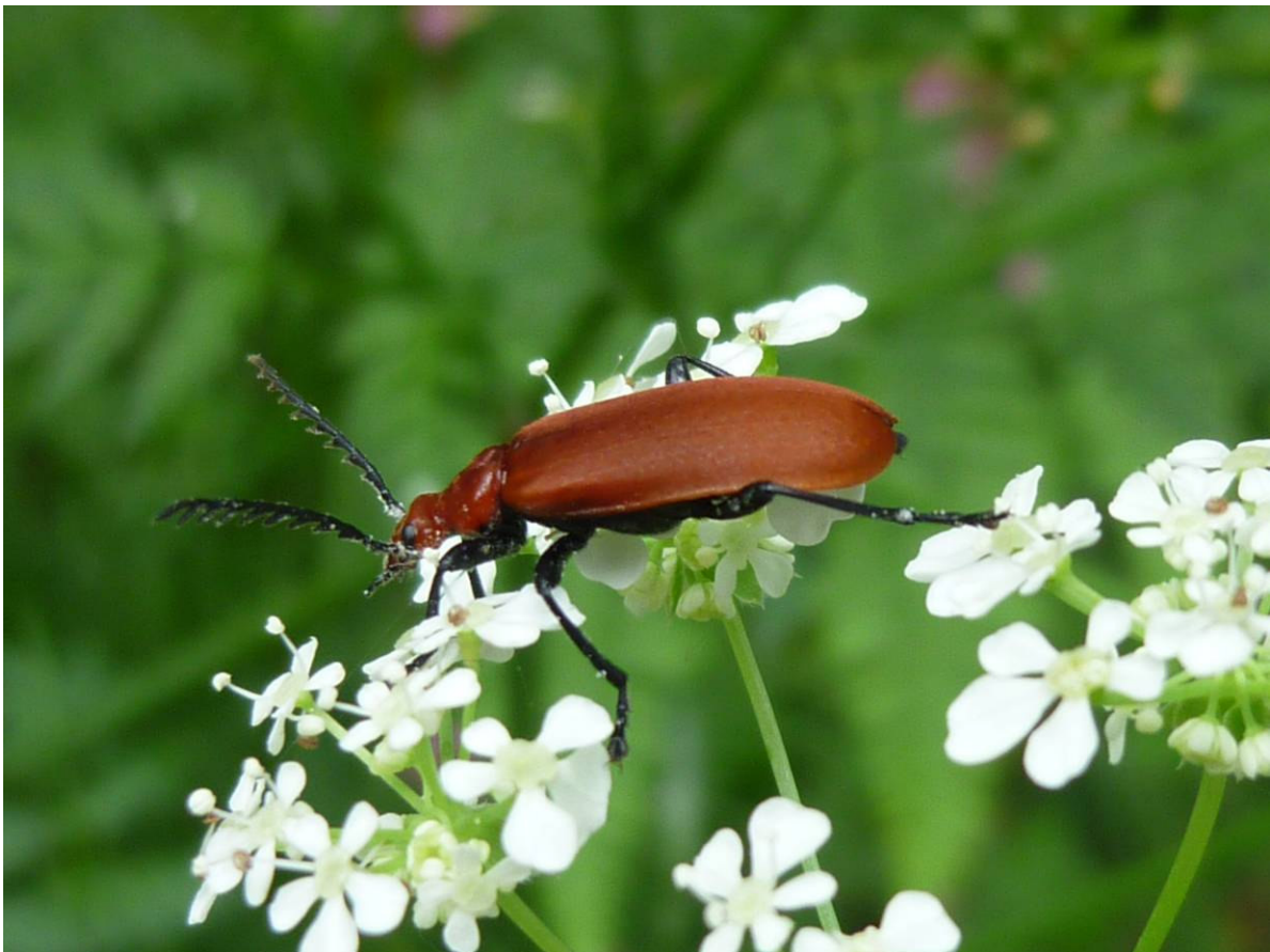
Figure 27: Red-headed Cardinal Beetle Pyrochroa serraticornis

H14 Laois: Donaghmore (S264797), 4.v.2010, TG.