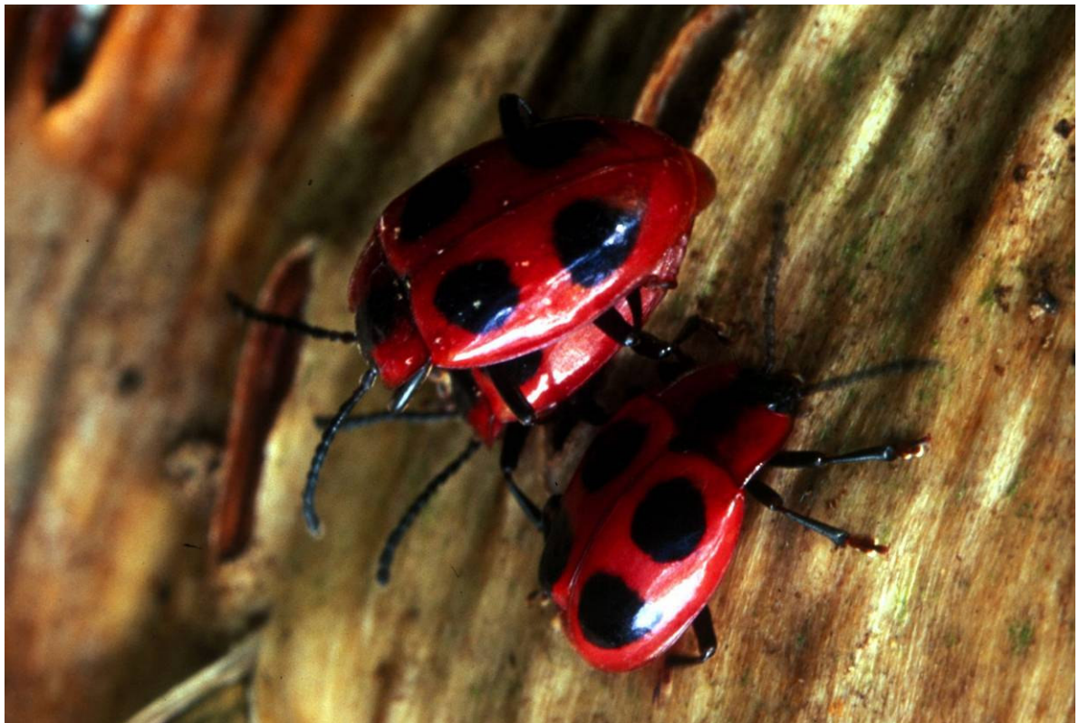
Figure 22: Endomychus coccineus

H40 Londonderry: Springhill House, 26.iv.2003, RA; The Umbra, 2.i.2004, RA.