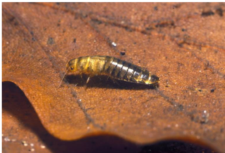
Figure 13: Prionocyphon serricornis larva © Roy Anderson

H20 Wicklow: Powerscourt Deerpark, a male, viii.1927, AWS (O'Mahony, 1927, 1928a); two larvae & some exuvial fragments in tree holes of mature beeches beside the new club-house of the golf course, 5.xii.2007, GNF & JD Reynolds (Foster & Reynolds, 2008).