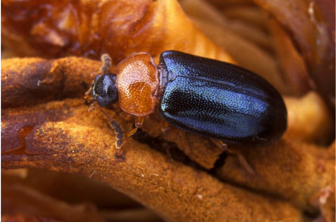
Figure 24: Tetratoma fungorum

H39 Antrim: Murlough Bay (D189425), off birch polypore in birch woodland, 16.vi.1992, KNAA (Alexander & Foster, 1995); Belfast Castle (J326794), adults & larvae in Flammulina velutipes on wych elm, 13.iii.2005, RA (Anderson, 2006); Belfast Castle, 8 larvae in Pleurotus cornucopiae on dead wych elm, 9.iii.2008, RA.