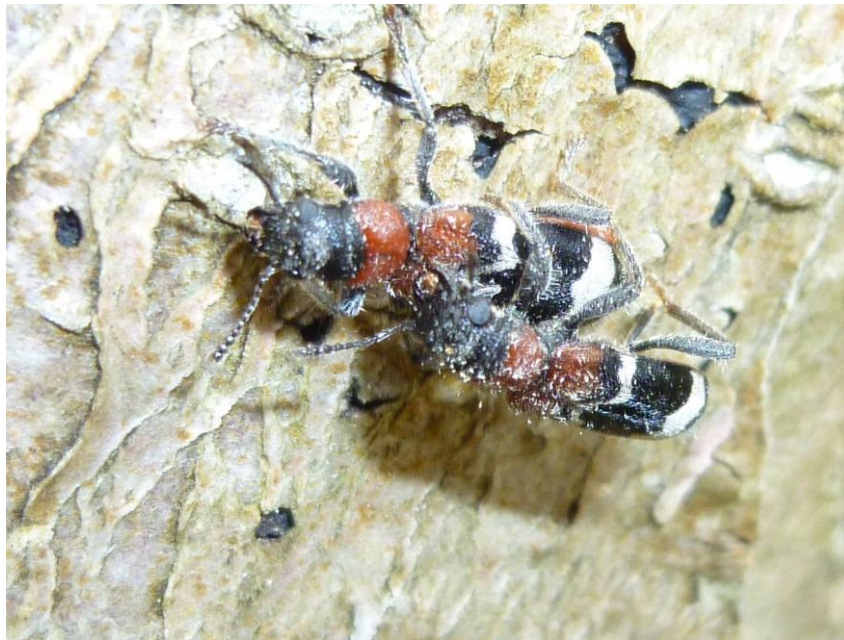
Figure 20: Thanasimus formicarius