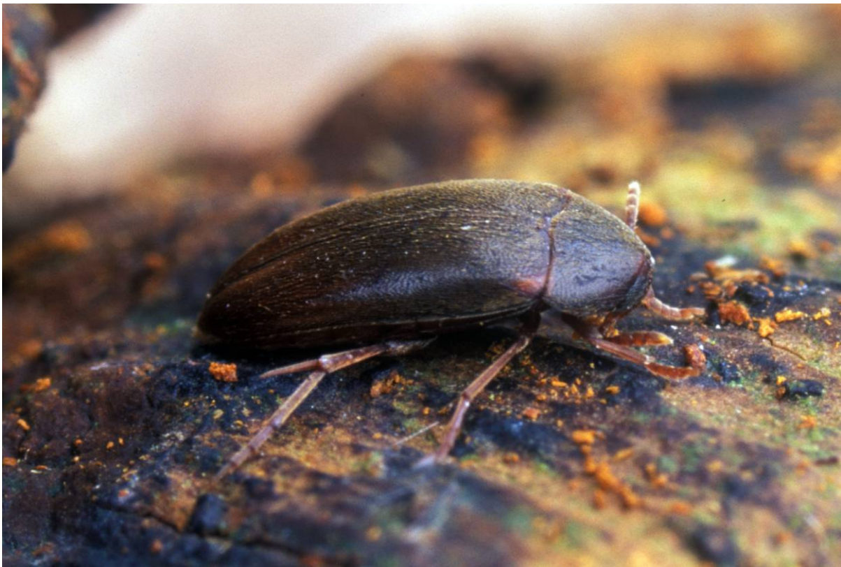
Figure 25: Orchesia micans

H39 Antrim: Great Deer Park, Glenarm (D2911), adult and larvae with old I. radiatus brackets on alder, 20.v.2006; Glenarm Woods ASSI (D3010), reared from larvae collected 22.v.2007, parasitic wasps hatched as well, KNAA.