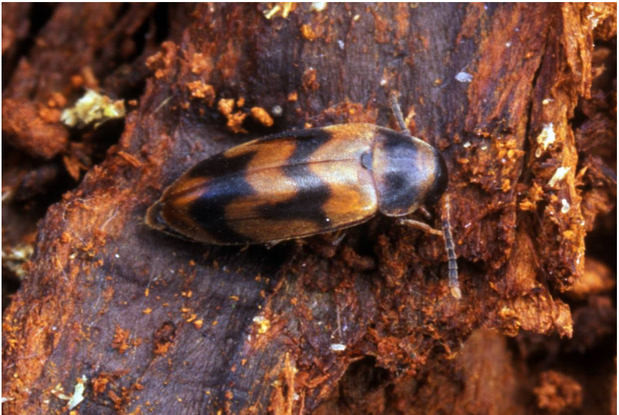
Figure 26: Abdera flexuosa

H29 Leitrim: Acres Lake (G966100), one emerged 27.v.2011 from a small amount of dead Pinus , collected 23.iv.2011, MC; Lough Allen (G964110), in a small amount of dead Pinus sylvestris , 28.v.2011, MC.