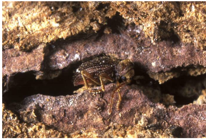
Figure 17: Ptinus subpilosus © Roy Anderson