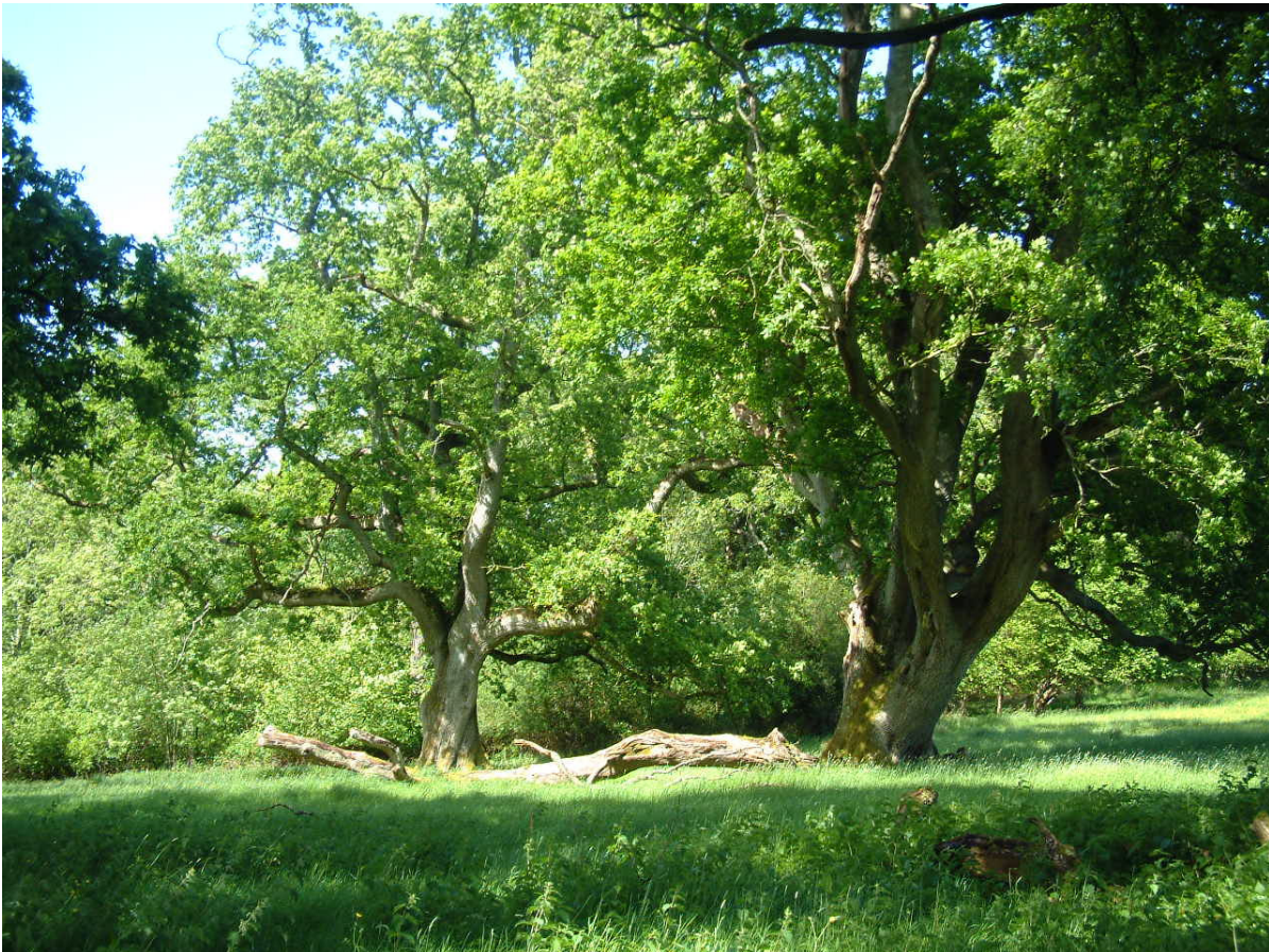
Figure 7: Veteran trees on Inisherck, Crom Castle Estate, Co. Fermanagh

Accessible for recording only since 1987 and with a steady increase in notable finds: first Irish site for the false darkling beetle Abdera flexuosa , the fungus beetle Agathidium confusum and the bracket fungus beetle Dorcatoma dresdensis ; one of few modern localities for the fungus beetle Anisotoma orbicularis and the short-winged mould beetle Bibloporus bicolor . An important and unusually large concentration of old parkland, as well as having areas of more typical ancient wood pasture and ancient woodland.