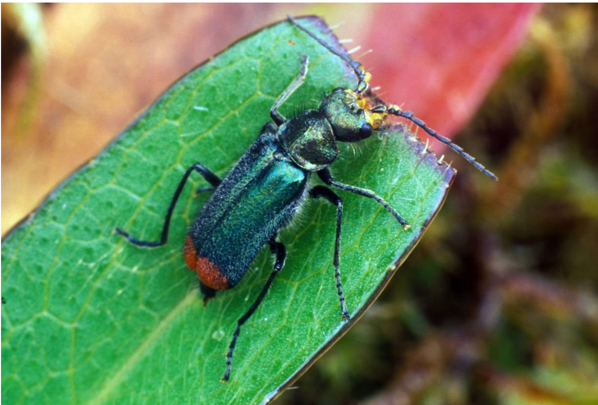
Figure 21: Malachius bipustulatus