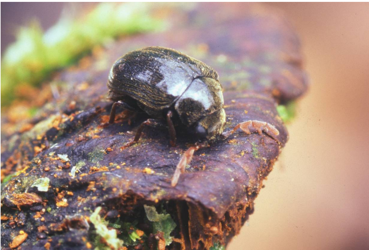
Figure 19: Dorcatoma dresdensis

H33 Fermanagh: Inisherik, Crom Castle Estate (H357248), occupied I. dryadeus bracket on old parkland oak, 6.vii.2007, confirmed by rearing, KNAA (Alexander, 2009), also 6.vii.2010, MDB.