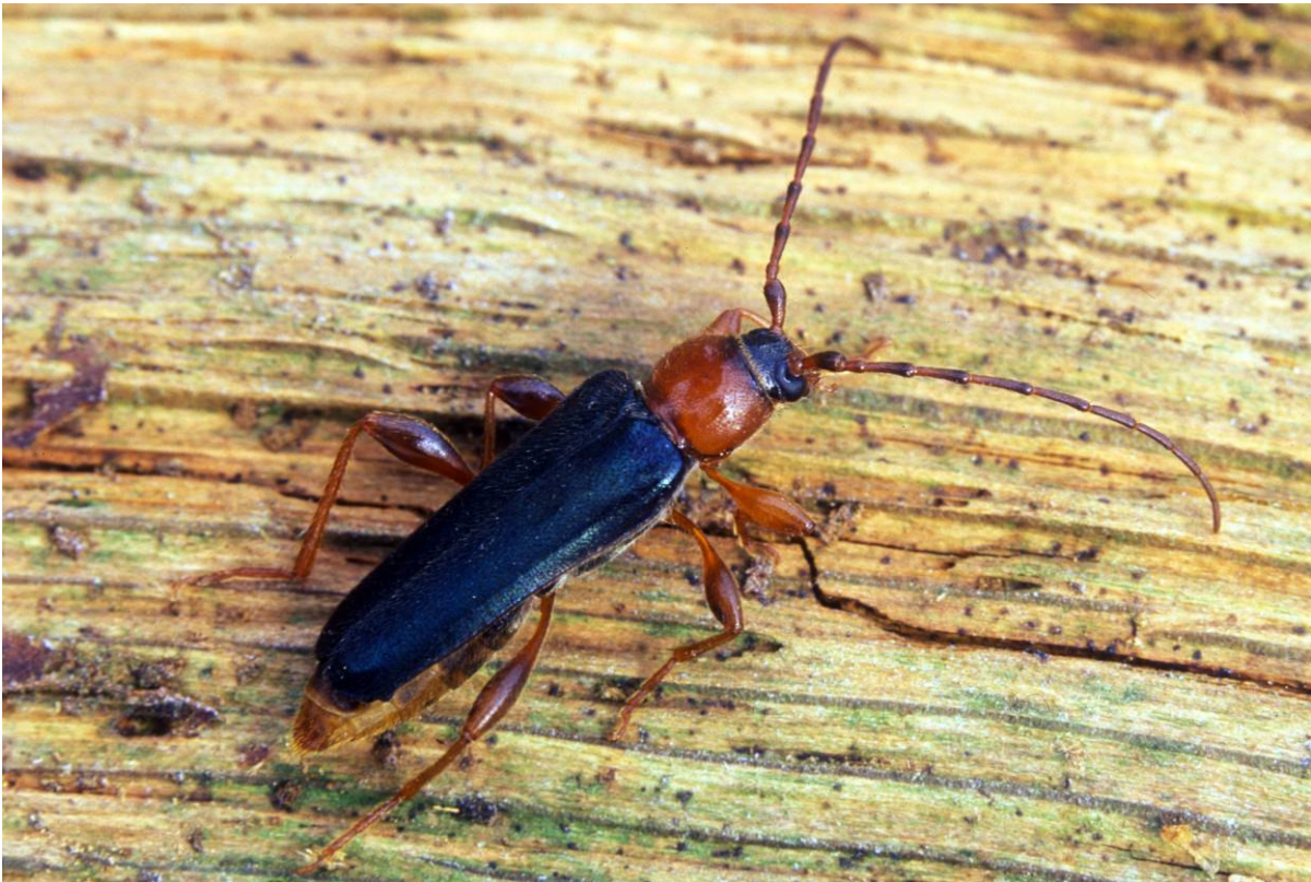
Figure 30: Phymatodes testaceus

H37 Armagh: Tynan Abbey Estate (H760425), 3 specimens & numerous exit holes, under tight bark on the underside of a sundered oak branch, about 2 m above the ground, veteran parkland oak, 1.vii.2011, MDB/RA (Bryan & Anderson, 2011); 1 specimen in a similar situation plus numerous exit holes at H761415, 26.vii.2011, MDB/RA.