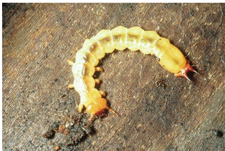
Figure 1: The distinctive larva of the Red-headed Cardinal Beetle Pyrochroa serraticornis

The species presumed to be extinct in Ireland are: Nossidium pilosellum (Marsham), Amphicyllis globus (F.), Agathidium rotundatum Gyllenhal, Euplectus punctatus Mulsant, Cypha seminulum (Erichson), Calambus bipustulatus (L.), Malthodes dispar (Germar), Anthocomus fasciatus (L.) and Conopalpus testaceus (Olivier). These represent a wide variety of saproxyllic habitat types.