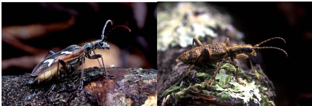
Figure 28: Rhagium bifasciatum (left) and Rhagium mordax (right)

Develops in the cut stumps of conifers; it probably occurs wherever there are conifer plantations in Ireland. It is also frequent in rotten stumps of various broadleaved trees, including oak and alder; also found living in 2000 year old pine stumps exposed from beneath bogs (Speight, 1988). Common & widespread in Ireland. “Common in fir plantations” (Johnson & Halbert, 1902). H1, H2, H3, H4, H5, H6, H12, H14, H16, H17, H18, H20, H25, H27, H28, H29, H30, H33, H34, H36, H37, H38, H39, H40.