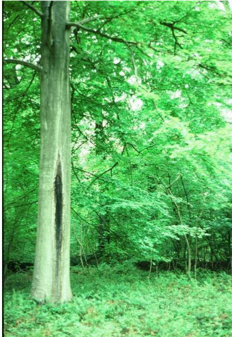
Figure 10: A sap run, an important microhabitat for woodland insects

It is very obvious that historic parklands and ancient wood pastures feature very strongly in this short list, while conventional ancient woodland is relatively poorly represented. However, the detailed survey of St John's Wood (Alexander, 2011) has demonstrated that ancient woodlands may also be rich in saproxylic invertebrates. The overwhelming majority of ancient woodland sites listed by Perrin and Daly (2010) have not yet been assessed for their saproxylic beetle interest.