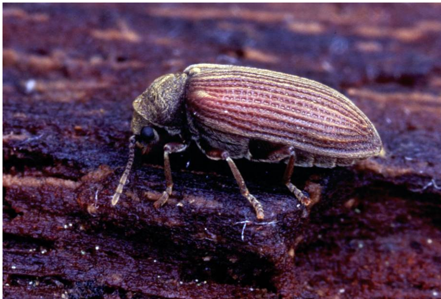
Figure 18: Grynobius planus

Develops in dead heartwood of various broad-leaved trees. Locally common in old trees: H1, H2, H3, H6, H9, H20, H21, H25, H26, H27, H28, H33, H35, H36, H37, H38, H39, H40.