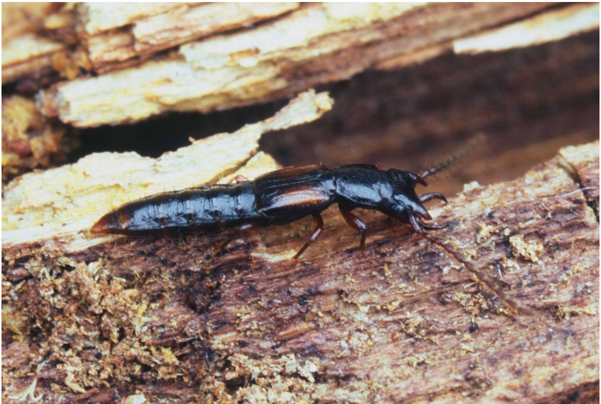
Figure 11: Siagonium quadricorne