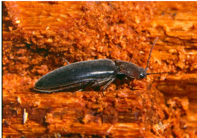
Figure 16: Melanotus castanipes

Ireland while M. villosus predominates in SE England. H1, H2, H13, H15, H16, H18, H20, H25, H30, H31, H33, H34, H36, H37, H38, H38, H39, H40.