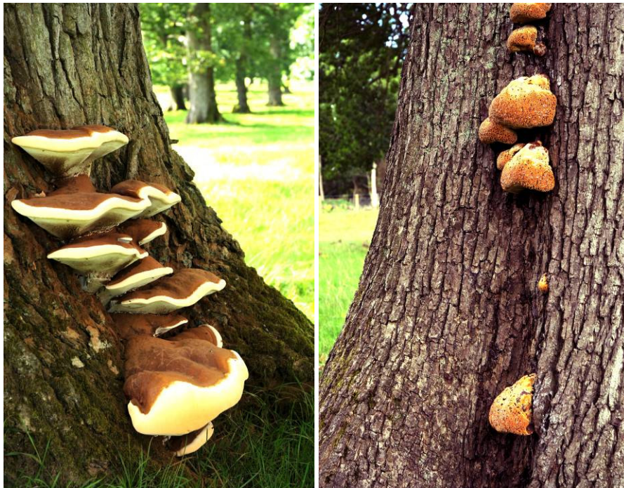
Figure 3: Two wood-decay fungi Ganoderma resinaceum (left) and Inonotus dryadeus (right)