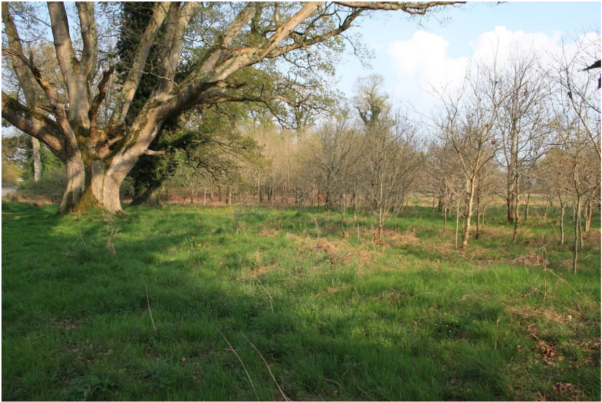
Figure 8: A mature tree and regeneration at Charleville, Co. Offaly