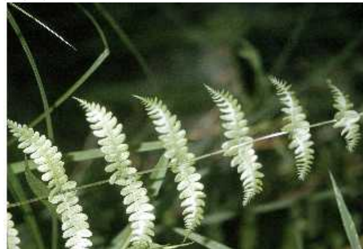
Robert H. Mohlenbrock. USDA NRCS. 1995. Northeast wetland flora: Field office guide to plant species . Northeast National Technical Center, Chester. Usage Requirements .

Click on the image below to enlarge it and download a high-resolution JPEG file.