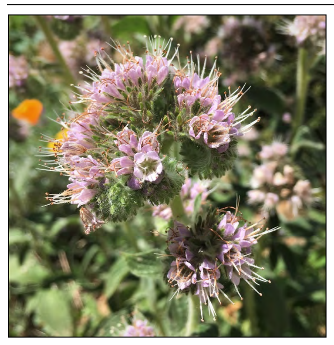
California phacelia flower cluster.