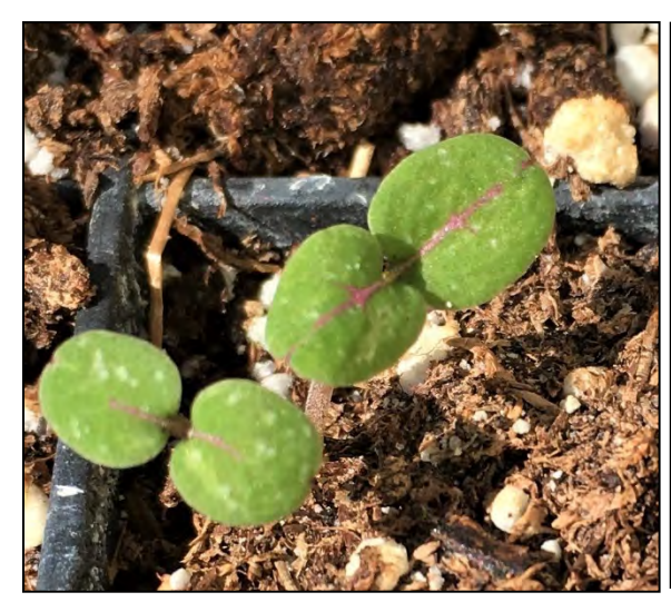
Chinese houses seedlings.

Flower color can range from mostly purple to completely white. The upper flower lobe of the flower is usually a lighter color than lower lobe.