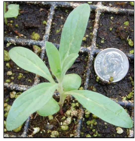
Young vinegarweed plant. Dime is pictured for scale.