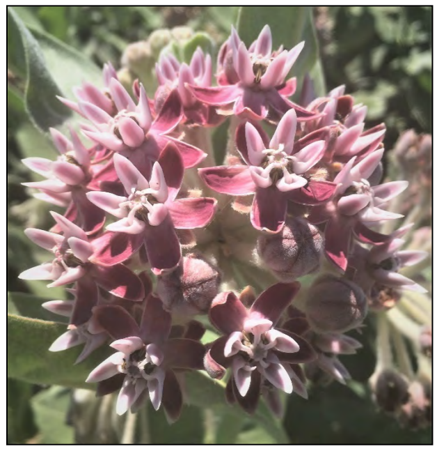
Showy milkweed flower cluster.