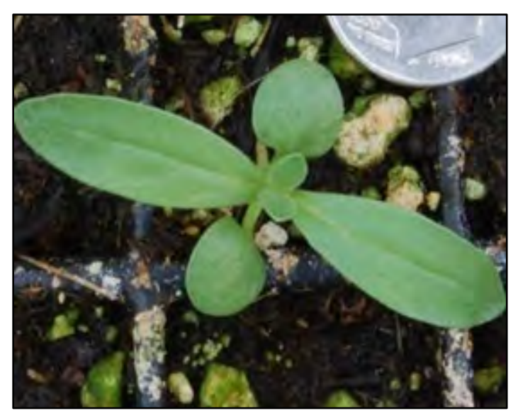
Vinegarweed seedling. Dime is pictured for scale.

Vinegarweed gives off a strong vinegar-like aroma, especially when its leaves are crushed. Vinegarweed is one of the latest blooming wildflowers, making it very valuable as a late-season nectar source.