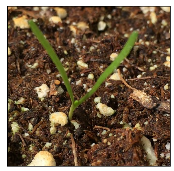
Yellowray goldfields seedling.

In the wild, yellowray goldfields often grows as a monoculture that resembles a field of golden yellow when viewed from a distance.