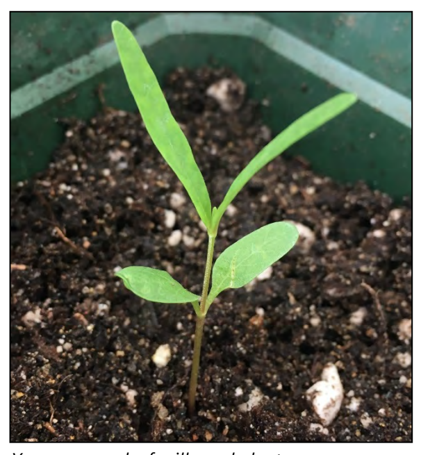
Young narrowleaf milkweed plant.