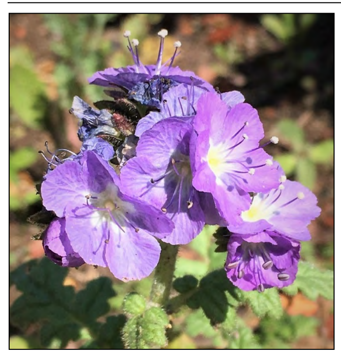
Great Valley phacelia flowers.