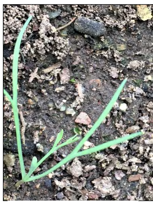
California poppy seedling.

Flowers open in the sun and close at night. California poppy is the state flower of California.