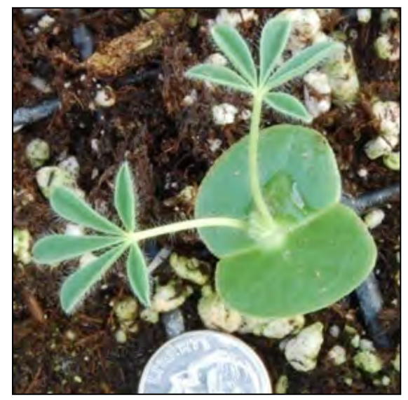
Golden lupine seedling. Dime is pictured for scale.

Golden lupine seedlings can be identified by their fused cotyledons, as pictured below.