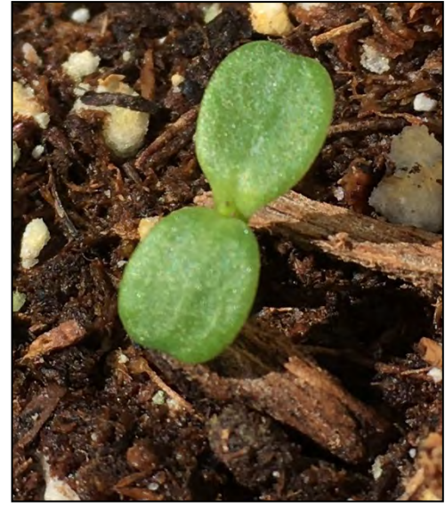
Bolander's sunflower seedling.

Sunflower species also have pithy stems, which native bees can use for nesting. Bolander's sunflower is shorter than the common sunflower.