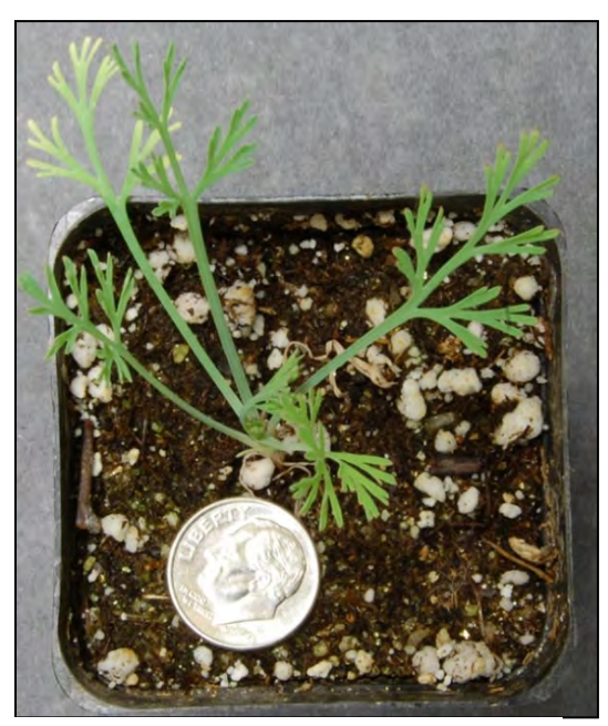
Young California poppy. A dime is pictured for scale.