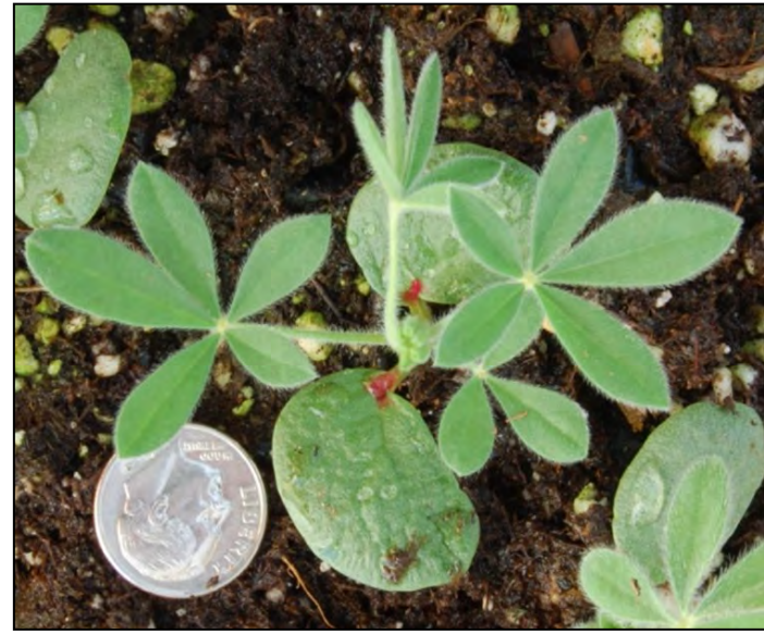
Young summer lupine plant. Dime is pictured for scale.