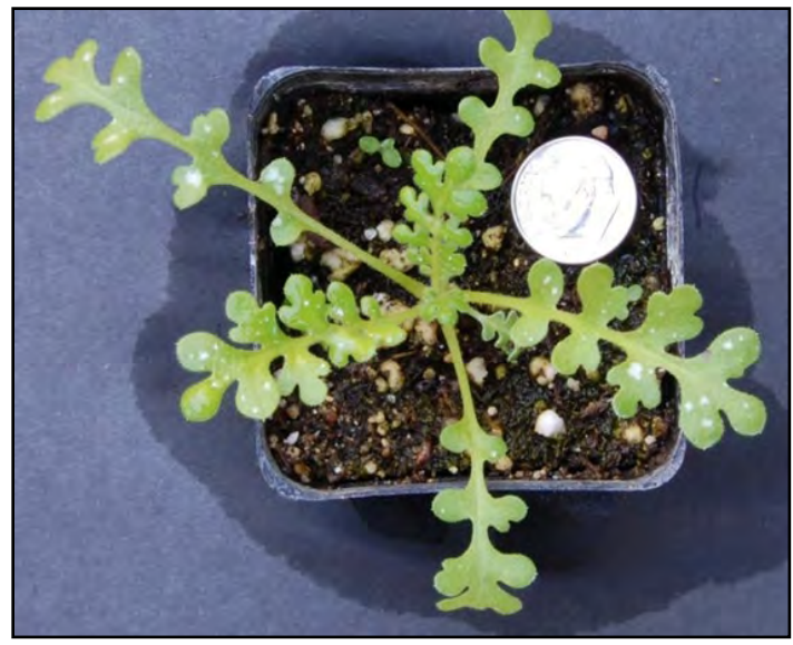
Young baby blue eyes plant. Dime is pictured for scale.