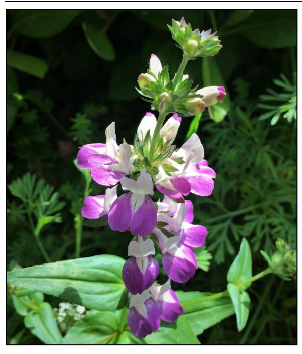
Chinese houses flowers.