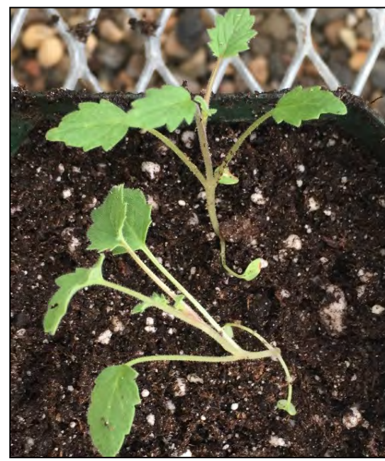
Young desertbells plants.