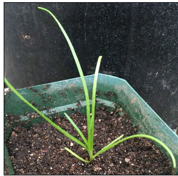
Young yellowray goldfields plant