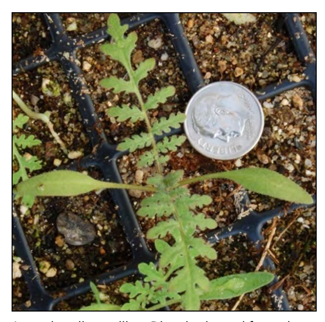
Lacy phacelia seedling. Dime is pictured for scale.