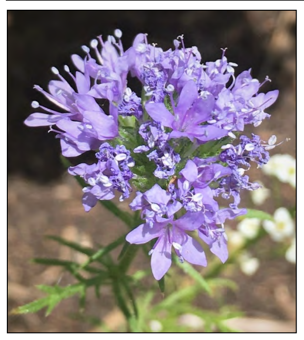
Bluehead gilia flower cluster.