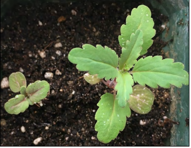
Young Chinese houses plants. Both plants are the same age, but the smaller plant was grown in cooler conditions.