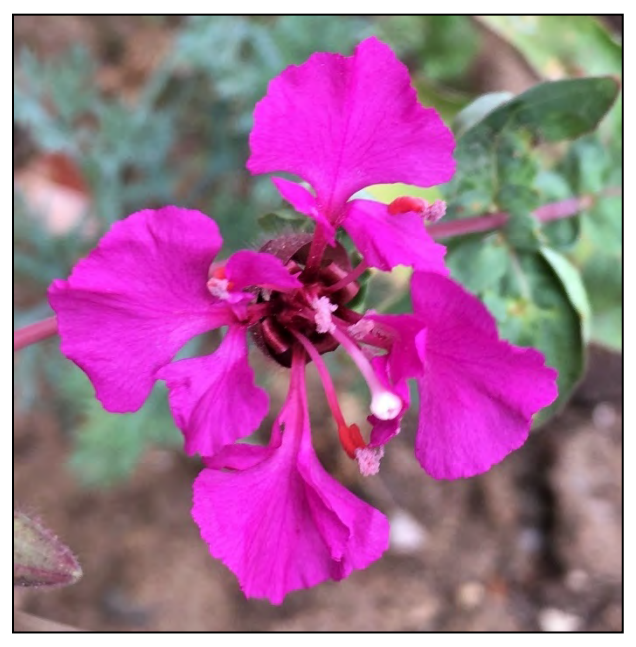
Elegant clarkia flower.