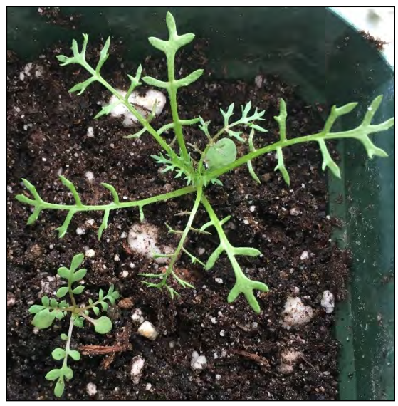
Young bluehead gilia plants. Both plants are the same age, but the smaller plant was grown in cooler conditions.