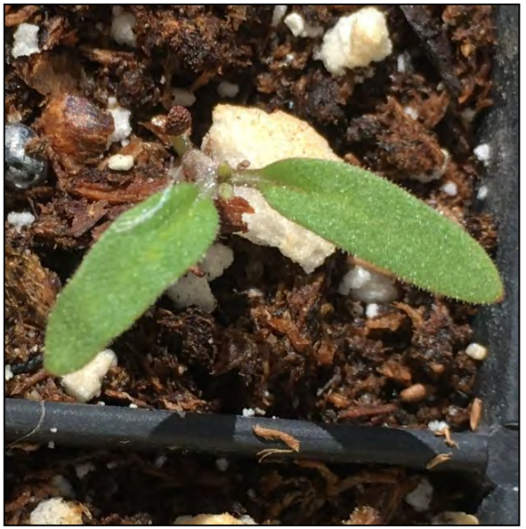
Great Valley phacelia seedling.