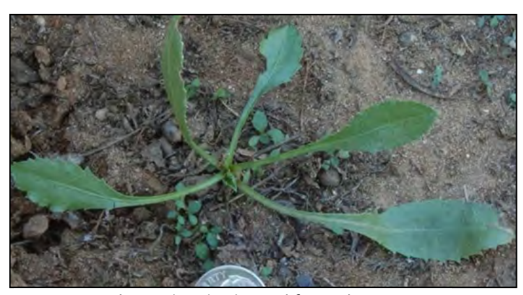
Young gumplant. Dime is pictured for scale.