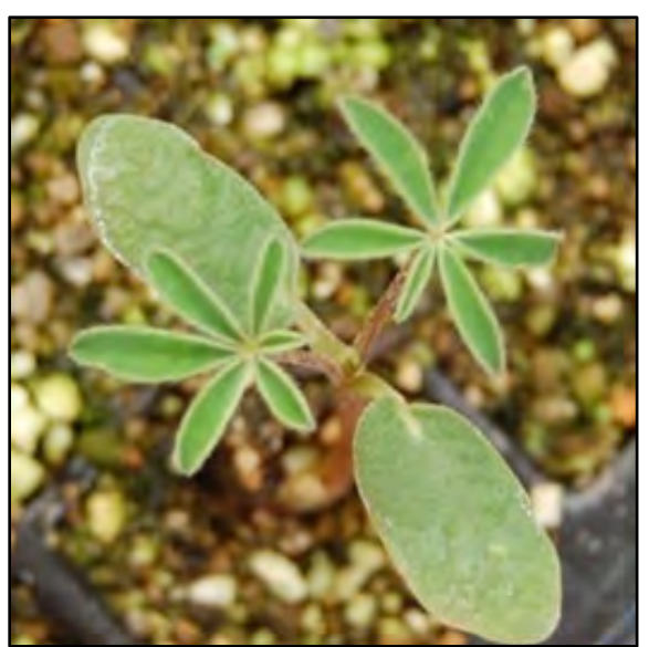
Arroyo lupine seedling.

Arroyo lupine is the most water-tolerant of California's lupines.