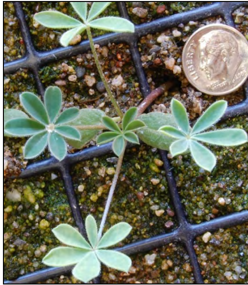
Young arroyo lupine plant. Dime is pictured for scale.