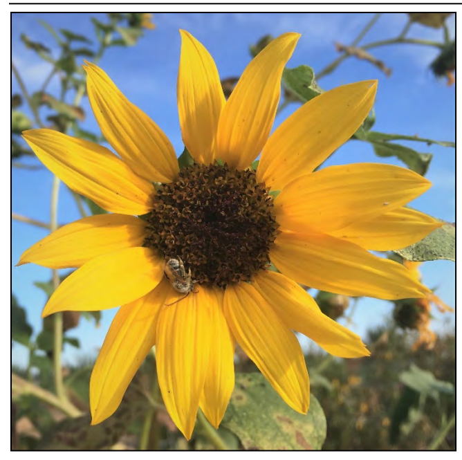
Sunflower with a visiting bee.