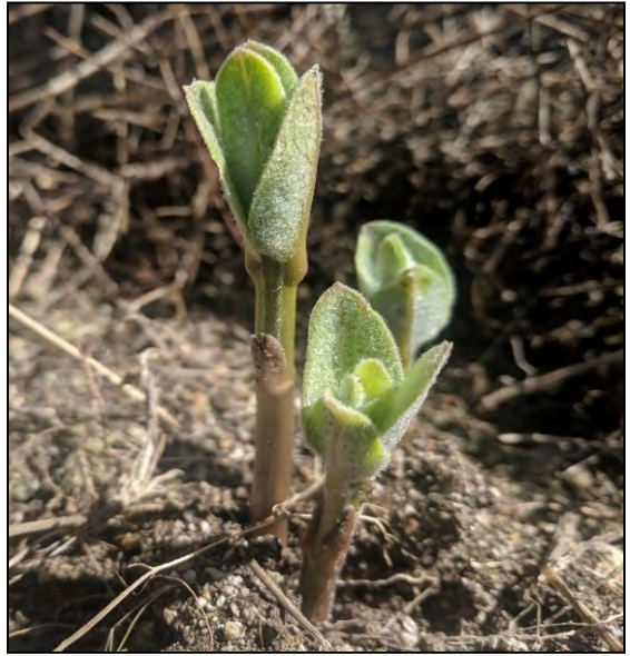
Emerging showy milkweed plants (grown from rhizomes)

Milkweeds are important host plants for the larvae of the monarch butterfly ( Danaus plexippus ). Showy milkweed seeds do not grow well when planted with other species in a mix, and are better propagated as plugs or root rhizomes. Milkweeds are perennials that die back in winter and re-grow from the same roots in spring. Leaves produce a milky white sap when damaged.