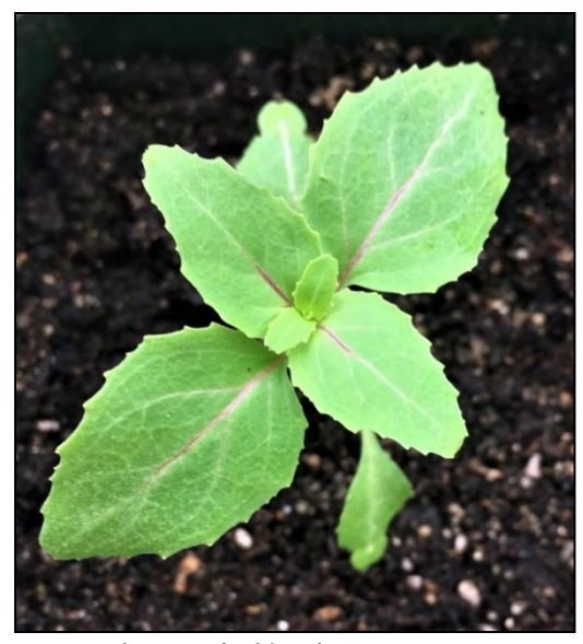
Young elegant clarkia plant.