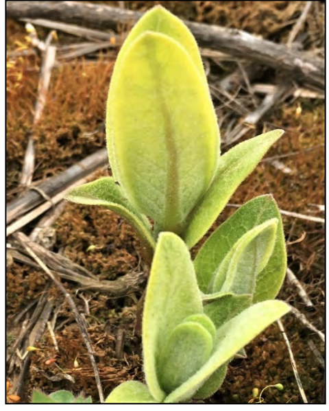
Young showy milkweed plants (grown from rhizomes).