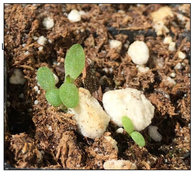
Common yarrow seedlings.

Especially attractive to beneficial insects such as flower flies and parasitic wasps. Bees occasionally visit.