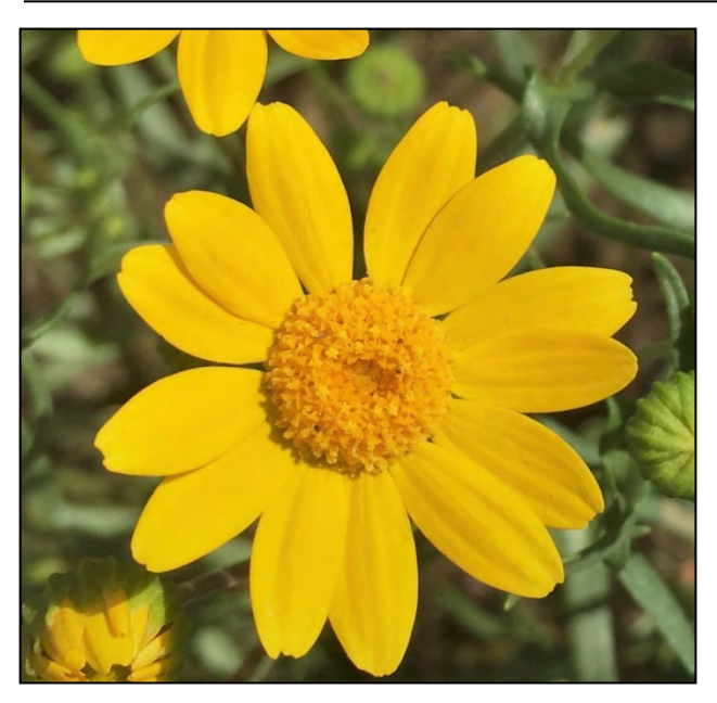
Yellowray goldfields flower.