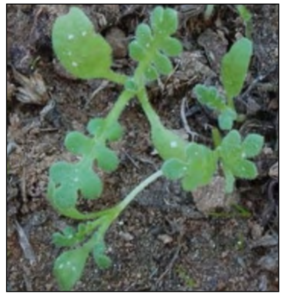
Baby blue eyes seedlings.

Baby blue eyes is one of the earliest blooming wildflowers.