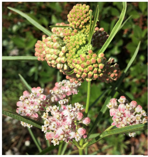
Narrowleaf milkweed flower clusters.