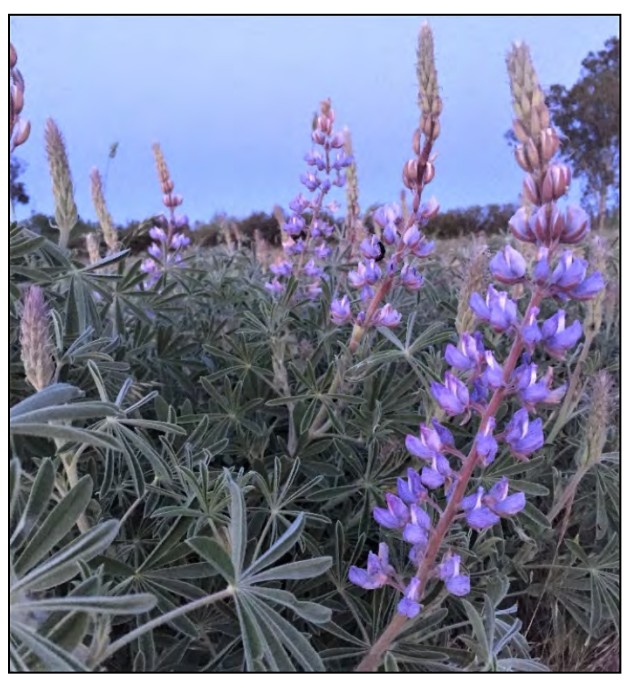
Summer lupine flower clusters.