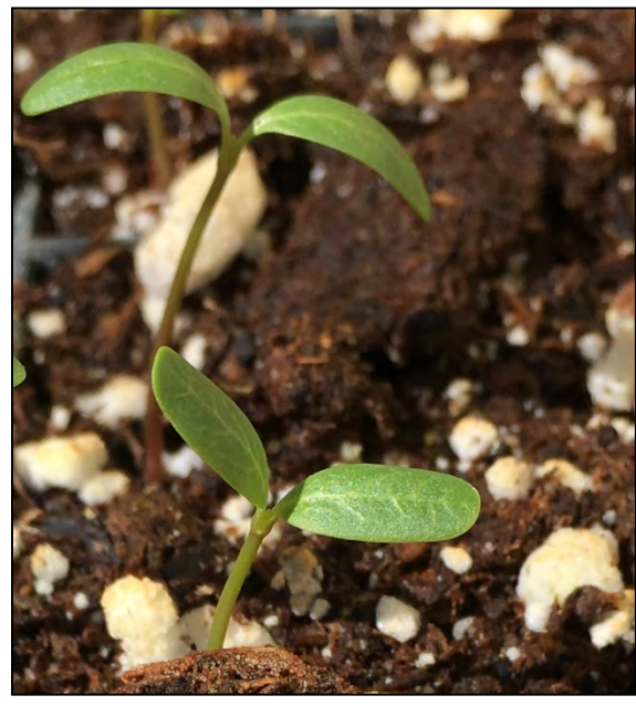
Narrowleaf milkweed seedlings.

Milkweeds are important host plants for the larvae of the monarch butterfly ( Danaus plexippus ). Narrowleaf milkweed seeds do not grow well when planted with other species in a mix, and are better propagated as plugs. Milkweeds are perennials that die back in winter and re-grow from the same roots in spring. Leaves produce a milky white sap when damaged.