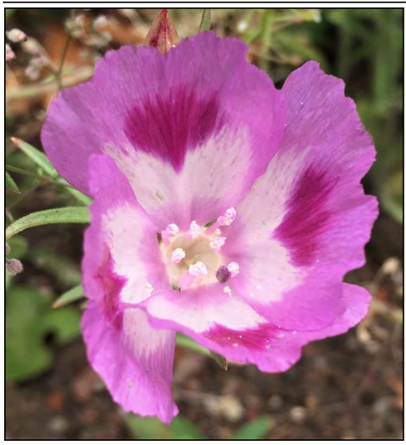
Fort Miller clarkia flower.