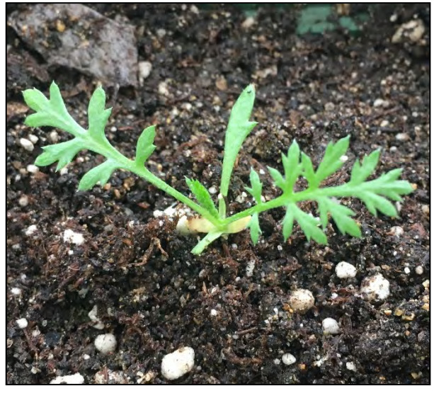
Young common yarrow plant.