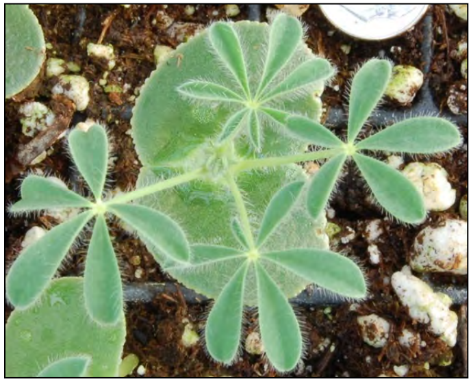
Young golden lupine plant. Dime is pictured or scale.