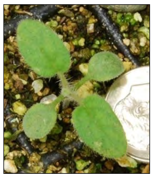
California phacelia seedling. Dime is pictured for scale.