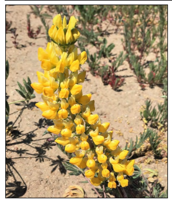
Golden lupine flower cluster.