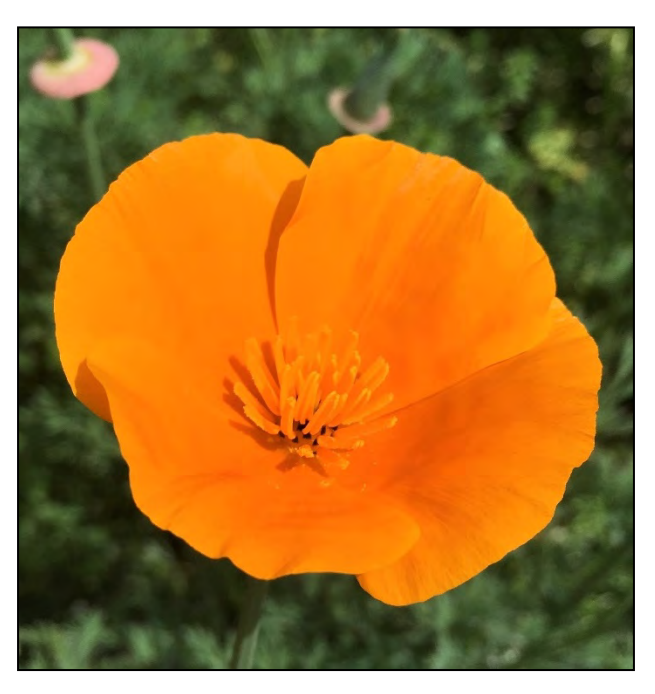
California poppy flower.