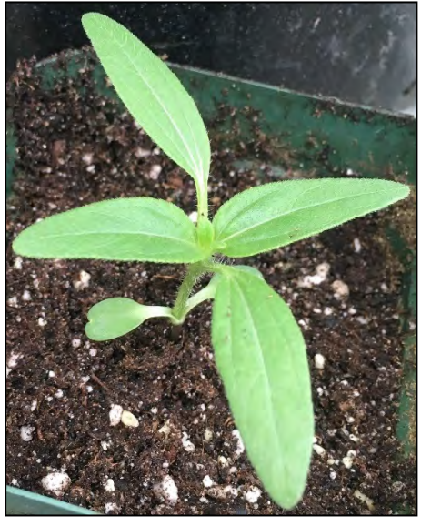
Young Bolander's sunflower plant.