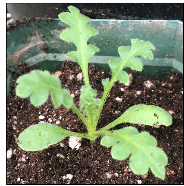
Young fivespot plant.