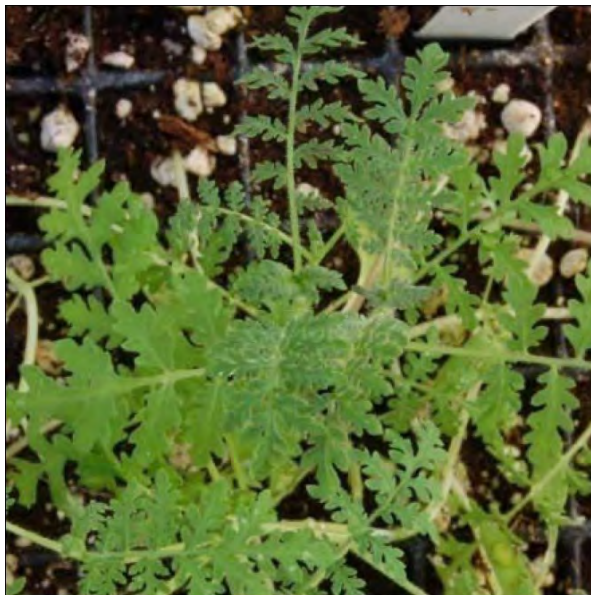
Young lacy phacelia plants.