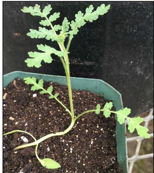
Young Great Valley phacelia plant.