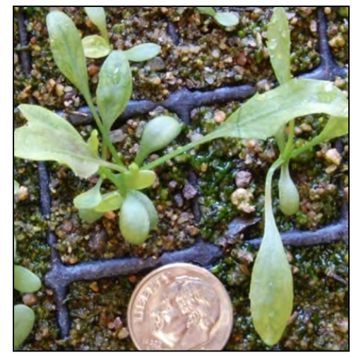
Gumplant seedlings. Dime is pictured for scale.

This plant is very valuable to pollinators because it blooms late in the year, when few other flowers are available. All parts of the plant are quite sticky to the touch.