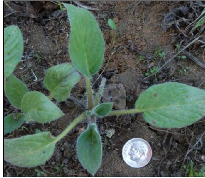
Young California phacelia plants. Dime is pictured for scale.