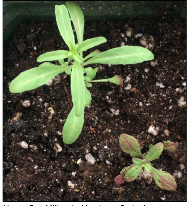
Young Fort Miller clarkia plants. Both plants are the same age, but the smaller plant was grown in cooler conditions.