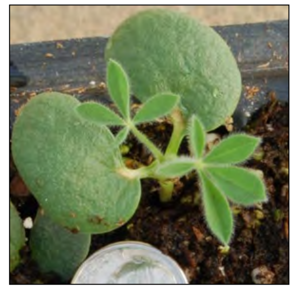
Summer lupine seedling. Dime is pictured for scale.

At low elevations, this lupine blooms later than most other lupine species.