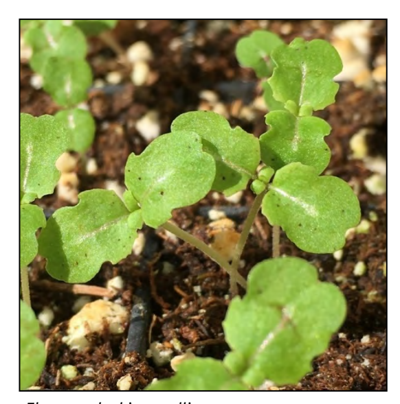
Elegant clarkia seedlings.

This plant will grow under partial shade. Flower color ranges from pale lavender-pink to deep fuchsia.