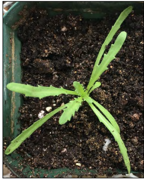
Young tidytips plant.