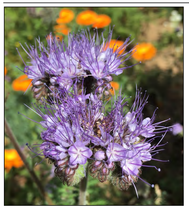
Lacy phacelia flower clusters.