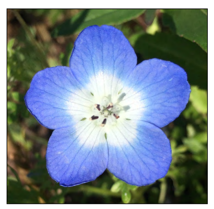
Baby blue eyes flower.