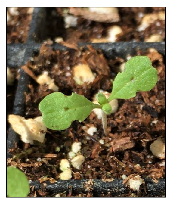
Fort Miller clarkia seedling.

This plant will grow under partial shade.