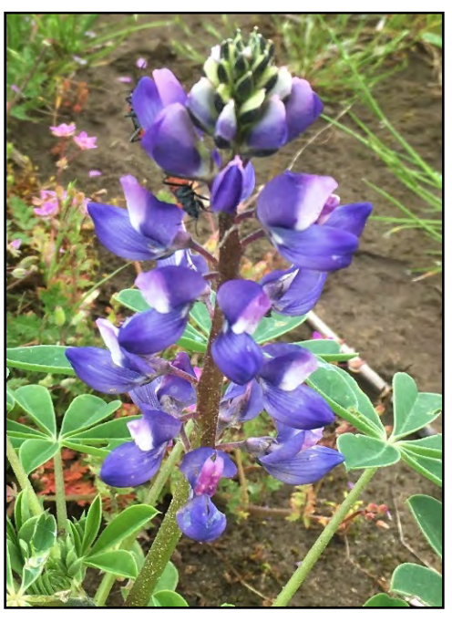
Arroyo lupine flower cluster.