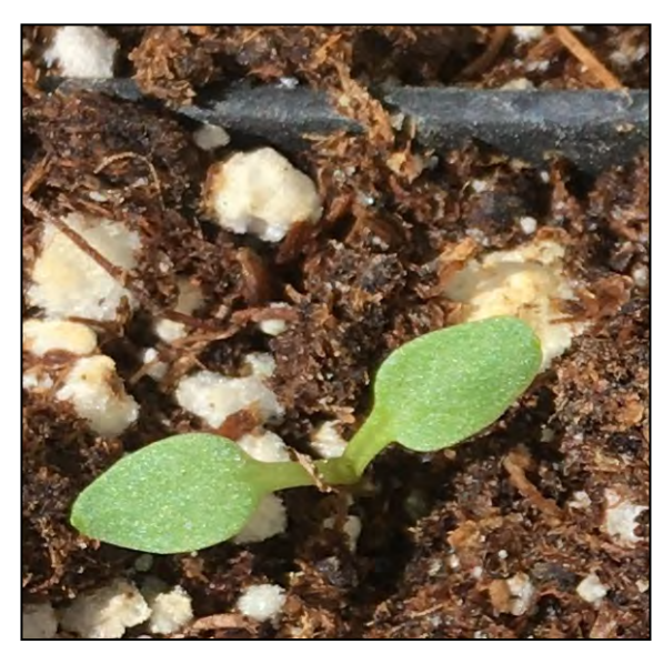
Bluehead gilia seedling.