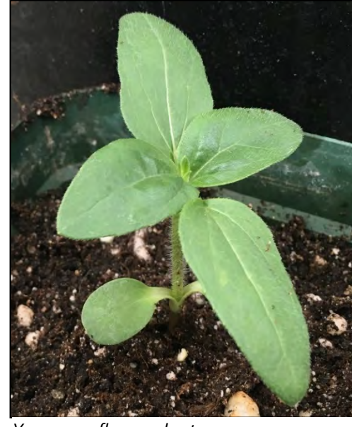
Young sunflower plant.