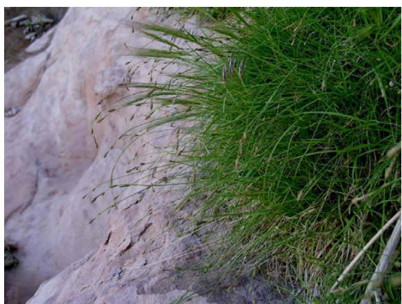
Navajo sedge ( Carex specuicola).

Contributed by: USDA NRCS Idaho and Utah Plant Materials Program