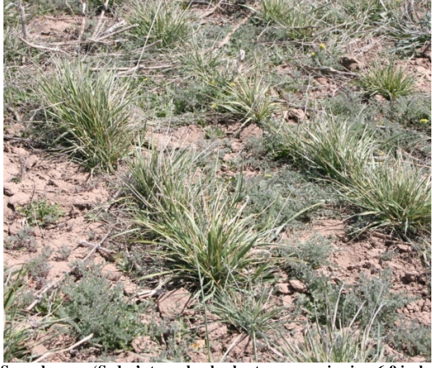
Second season 'Sodar' streambank wheatgrass growing in a 6-9 inch precipitation site northwest of Aberdeen, Idaho.

tolerate slightly acidic to moderately saline conditions with a pH of 6.0 to 9.5 (Scher 2002). They are cold tolerant, can withstand moderate periodic flooding in the spring, are moderately shade tolerant, and very tolerant of fire. They will not tolerate long periods of inundation, poorly drained soils, or excessive irrigation (Holzworth and Lacey 1993).