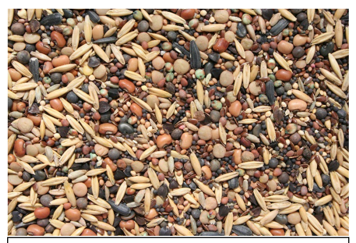
Figure 1. Calibrating a seed drill for highly diverse mix can be intimidating, but by following a few simple steps it can be accomplished without much difficulty.

To achieve the desired outcome of a seeding practice, an important step is the calibration of