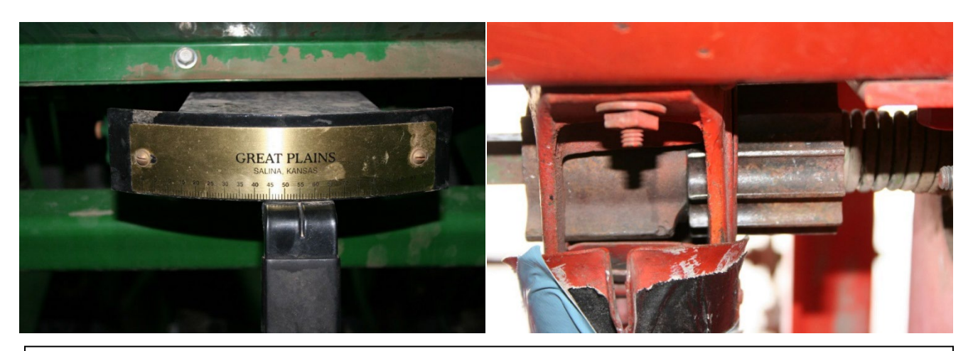
Figure 2. Most drills, like the Great Plains No-till drill (left) come equipped with a graduated lever for easy calibration, while older drills (right) may have to be adjusted manually by sliding the opener shaft one way or the other.

Drills are calibrated by adjusting the sizes of the openings through which the seeds fall. Many drills have an adjustable lever and a seed chart for calibrating for single species (Figure 2). However, when seeding a multiple species mixture like a cover crop mix, it can be hard to know where to begin.