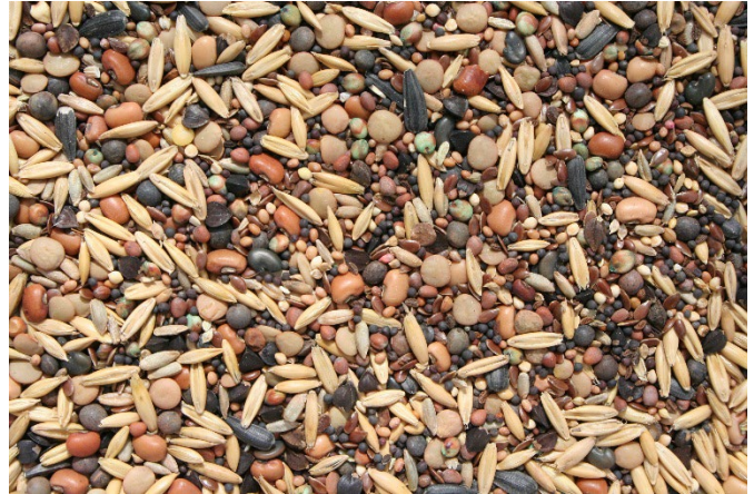
Figure 1. Calibrating a seed drill for highly diverse mix can be intimidating, but by following a few simple steps it can be accomplished without much difficulty.

Composition of cover crop mixes can be very diverse with seeds ranging in size from very small clovers (270,000 seeds/lb) to very large peas/beans (2,000 seeds/lb). Additionally, the makeup of each mix will vary depending on the site, planting window and resource concern being addressed. The final seed mixture could be comprised primarily of larger seeded species, smaller species or a blend of both (Figure 1). For more information on developing a mix see Regional Technical Note 2: Cover Crop Selection Tool. For species descriptions see Idaho Technical Note 67: Cover Crops for the Intermountain West.