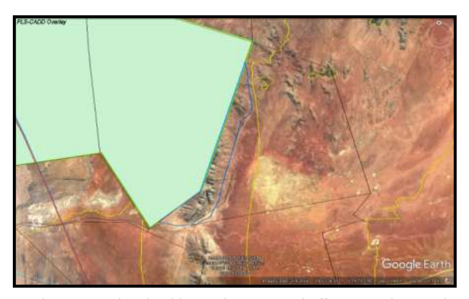
Figure 1: The area outlined in blue is the proposed offset area, being adjacent to the area already within the Richtersveld National Park (Klein Duin section; green shading).

unique botanical hotspot. Although it was not highlighted in the EIA or the RoD as a target area for the biodiversity offset I believe the conservation of this area would help conserve an irreplaceable national conservation priority area, and thus falls within the general ambit of what the required biodiversity offset is supposed to achieve. The fact that it is adjacent to an area already managed by SANParks (see Figure 1) makes it doubly suitable, and it is an obvious fit that ticks all the boxes for biodiversity conservation.