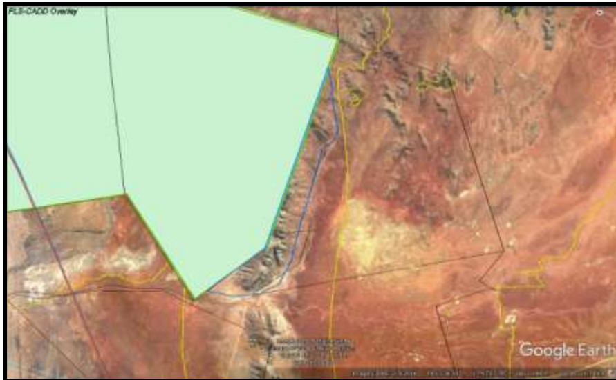
Figure 1: The area outlined in blue is the proposed offset area, being adjacent to the area already within the Richtersveld National Park (Klein Duin section; green shading).

unique botanical hotspot. Although it was not highlighted in the EIA or the RoD as a target area for the biodiversity offset I believe the conservation of this area would help conserve an irreplaceable national conservation priority area, and thus falls within the general ambit of what the required biodiversity offset is supposed to achieve. The fact that it is adjacent to an area already managed by SANParks (see Figure 1) makes it doubly suitable, and it is an obvious fit that ticks all the boxes for biodiversity conservation.