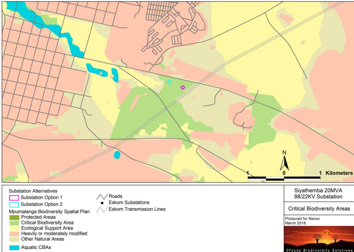
Figure 3. Extract of the 2014 Mpumalanga Biodiversity Spatial Plan showing the Critical Biodiversity Areas in the broad area around the study site.