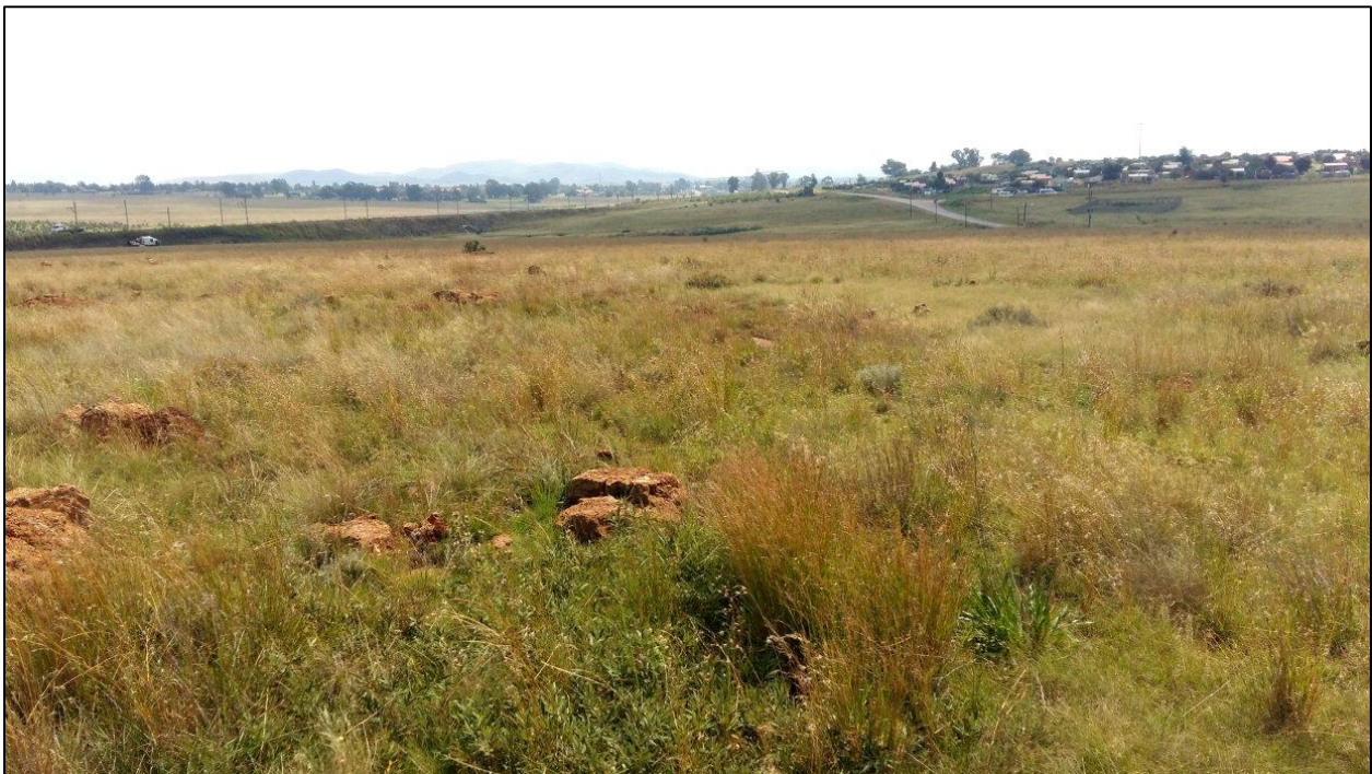
Figure 5. Looking west over the footprint area of Substation Option 2 towards Siyathemba, with the railway line on the left and the road into Balfour on the right. The vegetation consists of largely natural grassland with occasional low rocky outcrops.