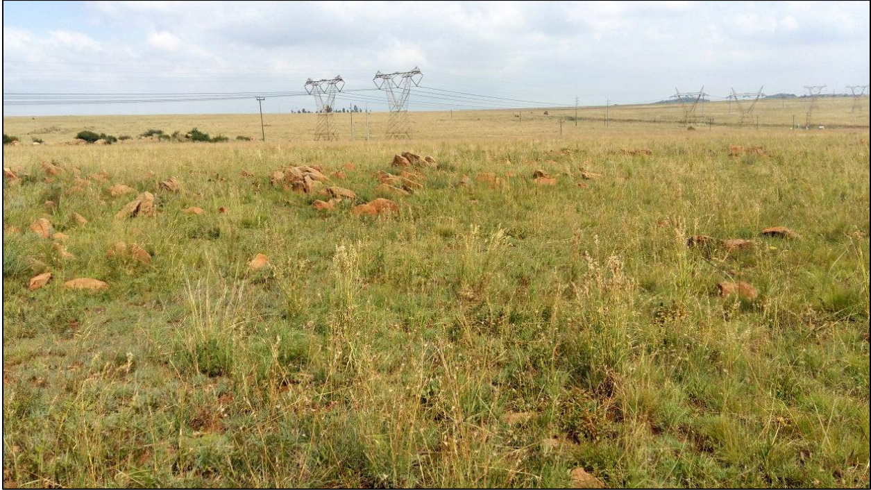
Figure 4. Looking southeast over the footprint area of Substation Option 1 with the 400kV and 88kV lines visible in the distance. The vegetation is dominated by grasses and low forbs with occasional woody shrubs.