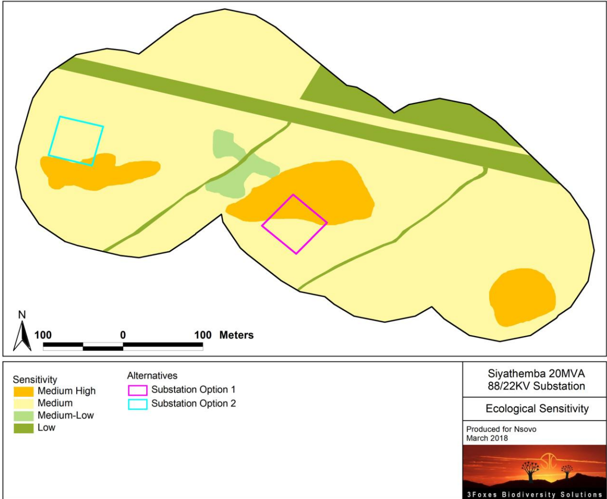
Figure 7. Ecological sensitivity map of the area affected by the Siyathemba Substation and adjacent areas.