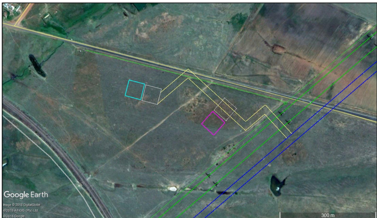
Figure 1. Map of the study area, showing the 2 alternatives considered, with Option 1 in purple, nearest the existing lines and Option 2 in blue further away. The turn-in lines themselves are not part of the current assessment.

Dipaleseng Local Municipality proposes the development of 88/22KV Substation to ensure supply of electricity around Balfour. The substation would link to the proposed Siyathemba switching station and associated loop in and loop out power lines. The proposed project is beneficial as it will ensure supply of electricity around Balfour and will form part of the Grootvlei 88kV network. The proposed development will be located on Farm Vlakfontein 566IR Portion 5 within the jurisdiction of Dipaleseng Local Municipality, Mpumalanga province. Two substation alternatives are being considered, which are illustrated below in Figure 1.