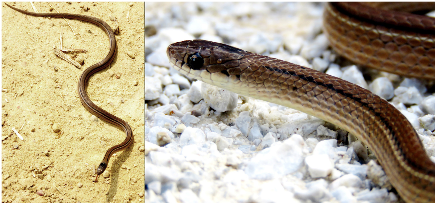
Fig. 1. Dorsum (left) and lateral view of the head (right) of a Lined Stripe-necked Snake ( Liopeltis calamaria ) encountered at Gairigaun, Makwanpur, Nepal.

Liopeltis calamaria is a terrestrial, diurnally active snake reportedly found in dry tropical forests associated with plateaus (Narayanan 2016). In Nepal, this species has been recorded from only two locations, both in severely altered habitats. The new location was a degraded Sal ( Shorea robusta ) forest approximately 100 km east of the earlier record (Bhattarai et al. 2017a). The snake was near a village