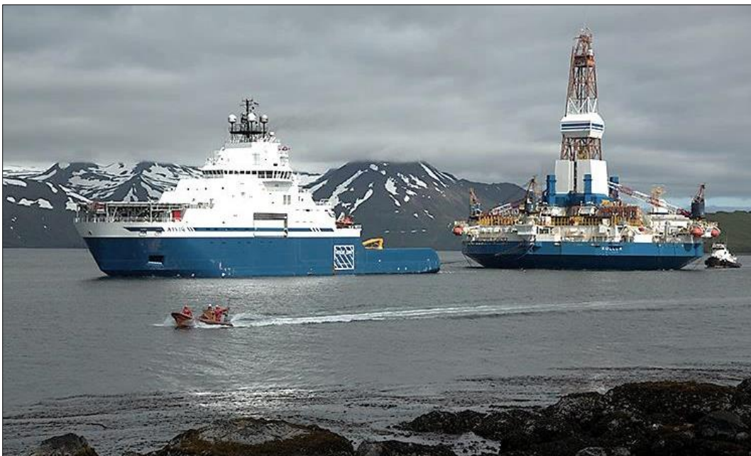
Tow vessel Aiviq , left, tows Shell's conical drilling rig Kulluk before the Kulluk grounding in December 2012.

The ice-class mobile offshore drilling unit (MODU) Kulluk , owned by Shell Offshore, Inc., and operated by Noble Drilling, grounded in heavy weather near Ocean Bay on the eastern coast of Sitkalidak Island off Kodiak Island, Alaska, about 2040 local time on December 31, 2012. The Kulluk , under tow by the ice-class anchor-handling tow supply vessel Aiviq , departed Captains Bay near Unalaska, Alaska, 10 days earlier for the Seattle, Washington, area for maintenance and repairs. 1 Four crewmembers on the Aiviq sustained minor injuries as a result of the accident.