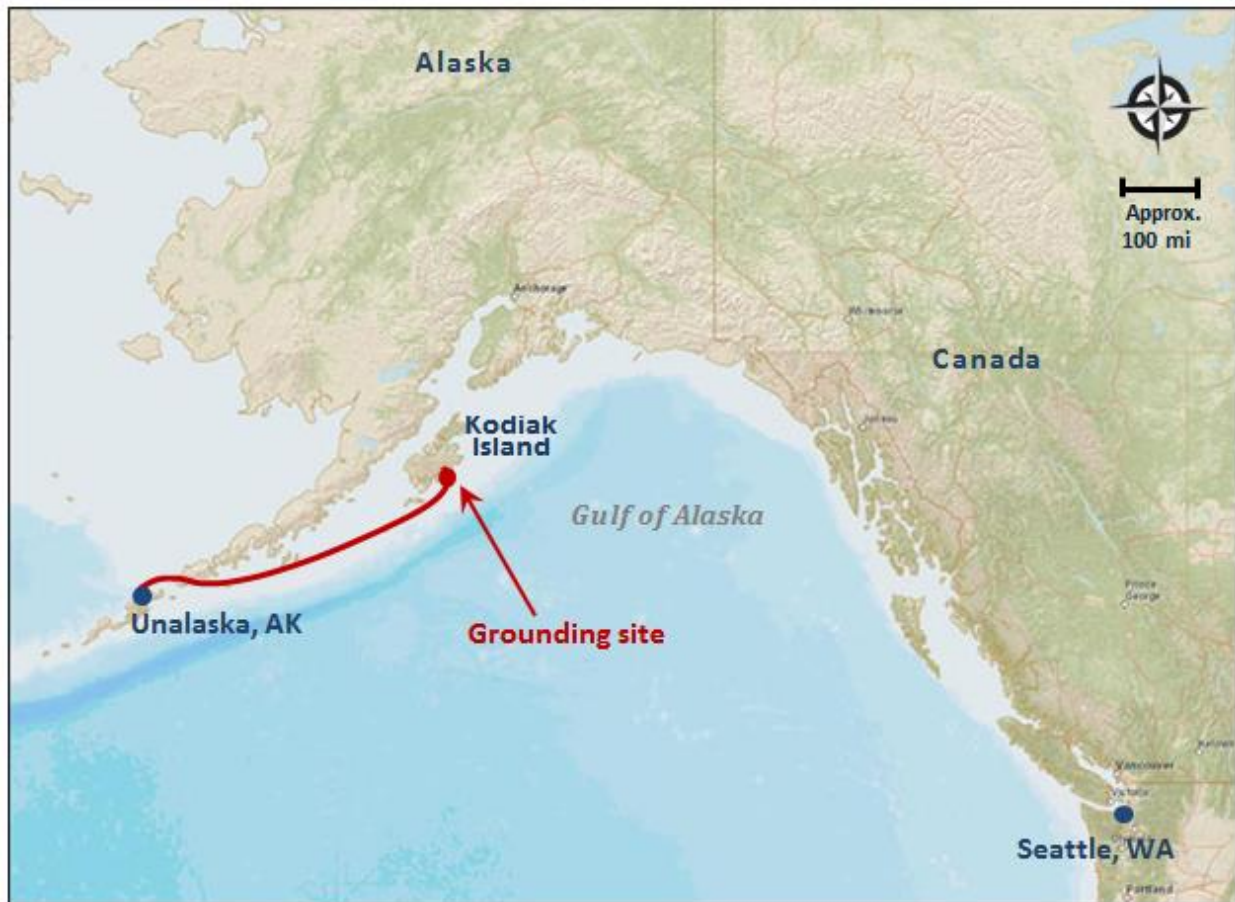
Approximate course taken by the Aiviq towing the MODU Kulluk between Unalaska, Alaska, and the site of the grounding near the southeast coast of Kodiak Island. The Seattle, Washington, area was the intended destination.

The towing plan was developed by Shell’s Alaska marine manager and reviewed by the Aiviq master, the Shell Alaska operations manager, Alaska drilling manager, logistics team lead, health safety and environmental team lead, emergency response specialist, tow master, Noble Drilling Kulluk rig manager and operations manager for Alaska, and the GL Noble Denton warranty surveyor. 4 The Shell Alaska operations manager was the final approval authority. Because he was on vacation at the time the tow plan was approved, a subordinate whom he had designated approved the tow plan in his place.