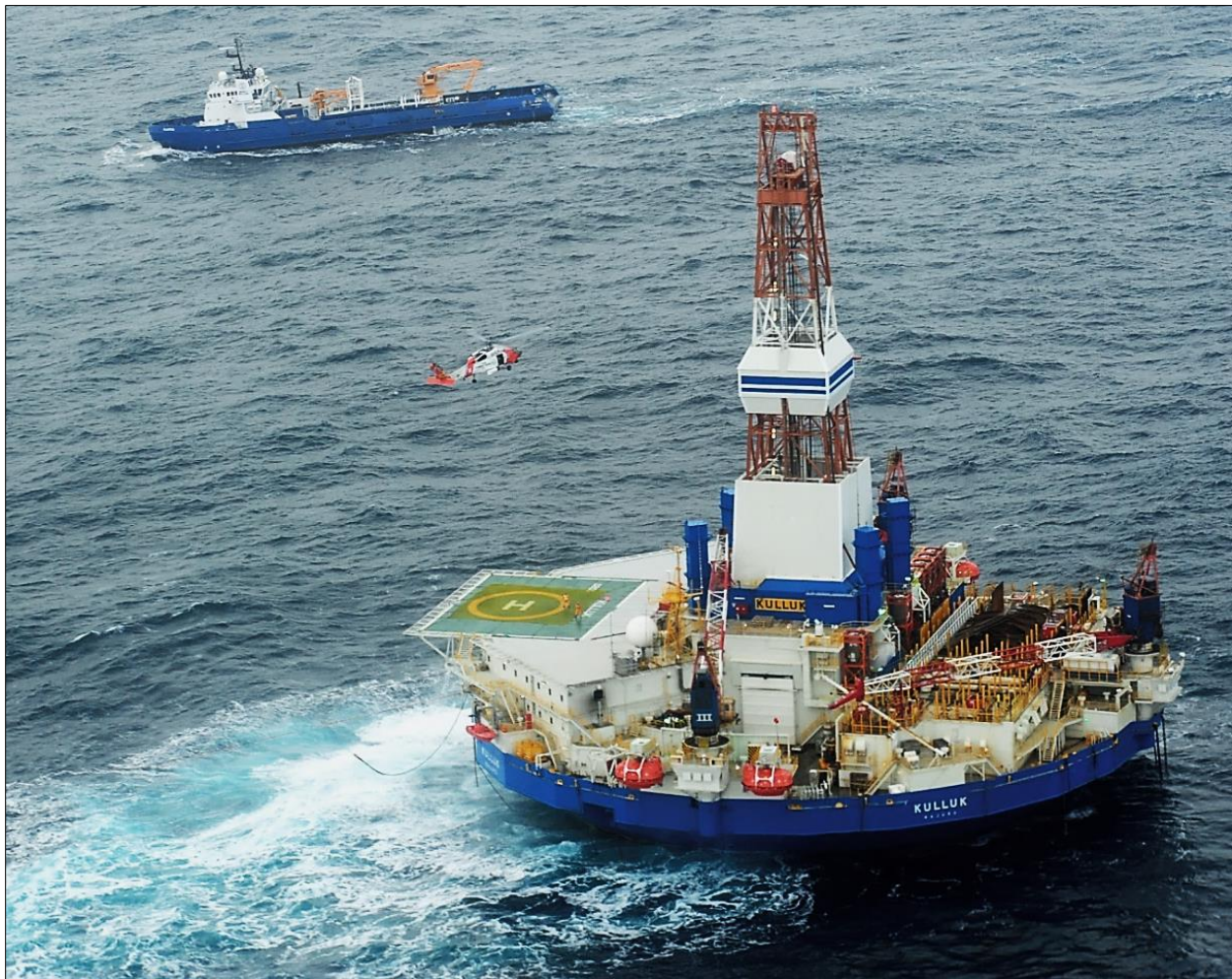
Coast Guard MH-60 Jayhawk helicopters from Air Station Kodiak airlifted 18 crewmembers from the Kulluk on December 29. The oil spill response vessel Nanuq is in the background.

By the afternoon, the Guardsman arrived on scene, and at 1329, personnel connected a tow line from the Guardsman to the Aiviq while the Aiviq remained connected to the Kulluk , and both vessels, in tandem, then began to tow the MODU. Because of the worsening weather and continuing problems with tow lines and the Aiviq engines, a Shell representative contacted the Coast Guard about 1800 that evening to request evacuation of the 18 persons on the Kulluk .