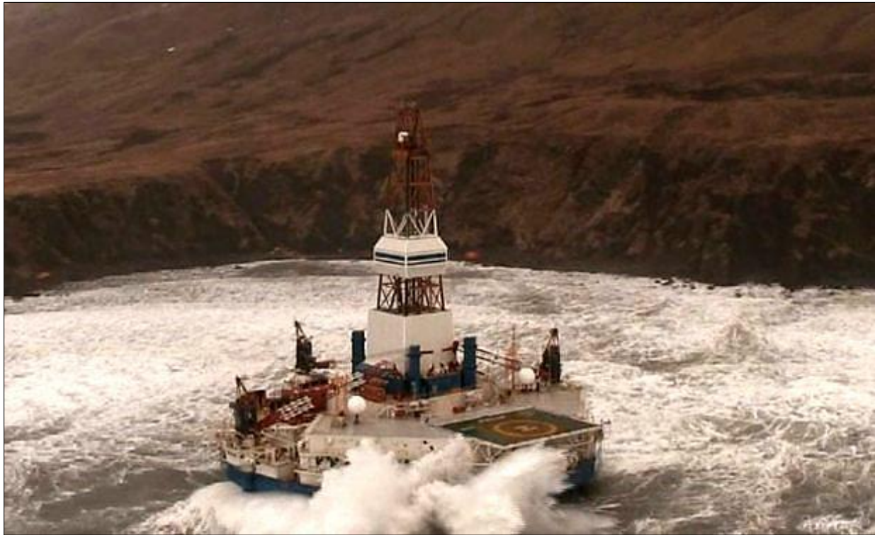
MODU Kulluk aground off Ocean Bay, Sitkalidak Island, Alaska.