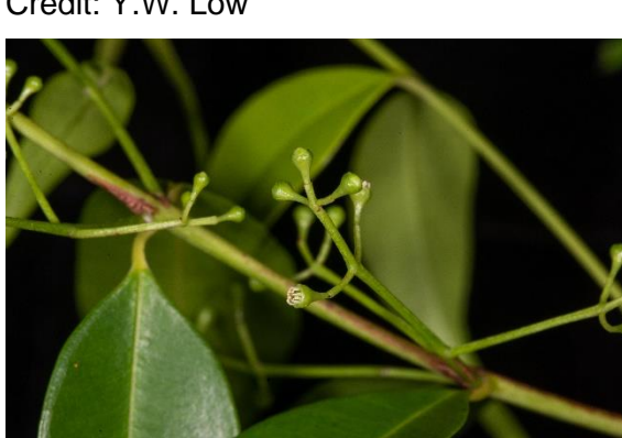
Syzygium singaporense

Close-up of a flowering and fruiting branchlet of Syzygium singaporense , a species native to Singapore and Peninsular Malaysia. Flowers of this peculiar species are only 1mm wide and with 8 stamens; and mature fruit is up to 7mm wide. This species can be found in the Central Catchment Nature Reserve of Singapore.