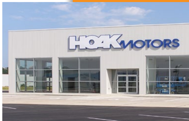
Commercial / Industrial