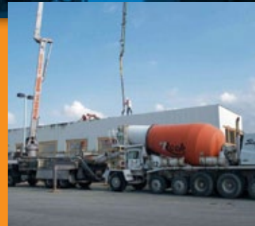
3. Concrete Pour