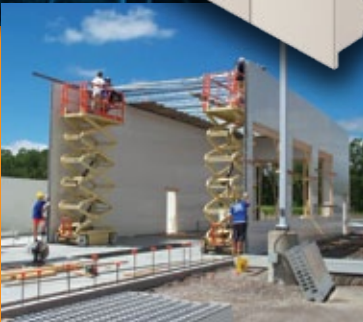
1. Wall Erection