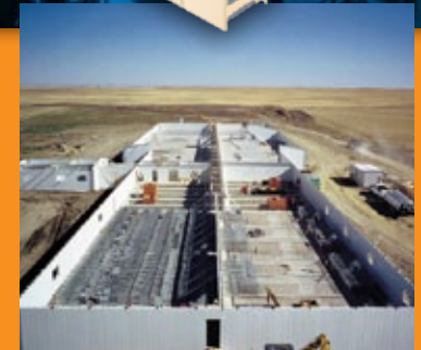
4. Completed Walls

Rigid polymer forms easily slide together, creating durable pre-finished walls that can be constructed quickly in any climate.