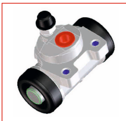
BRAKE WHEEL CYLINDER